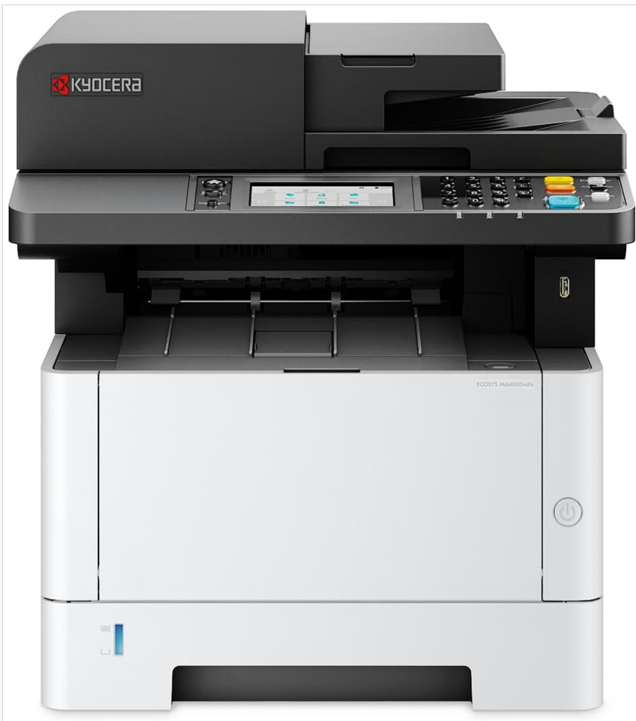
Figure 1: Front view of the KYOCERA ECOSYS MA4000wifx printer.