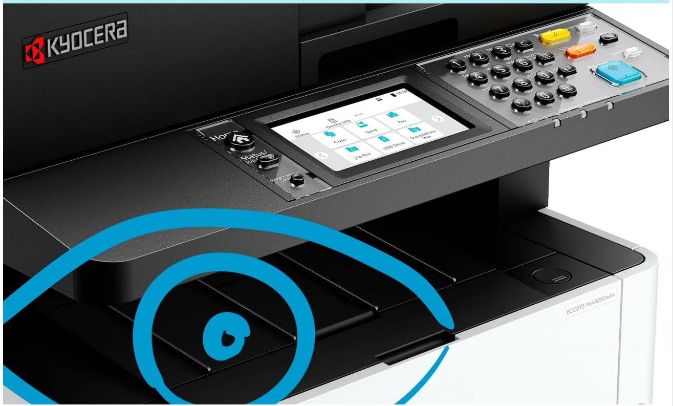
Figure 3: The printer offers wireless connectivity for flexible placement and usage.

Compatible with Kyocera mobile apps and third-party mobile OS.