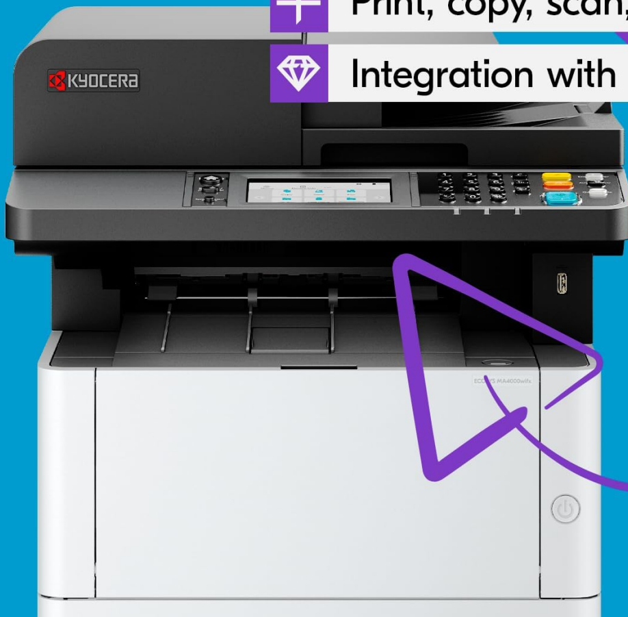
Figure 4: Overview of the KYOCERA ECOSYS MA4000wifx's core functionalities.