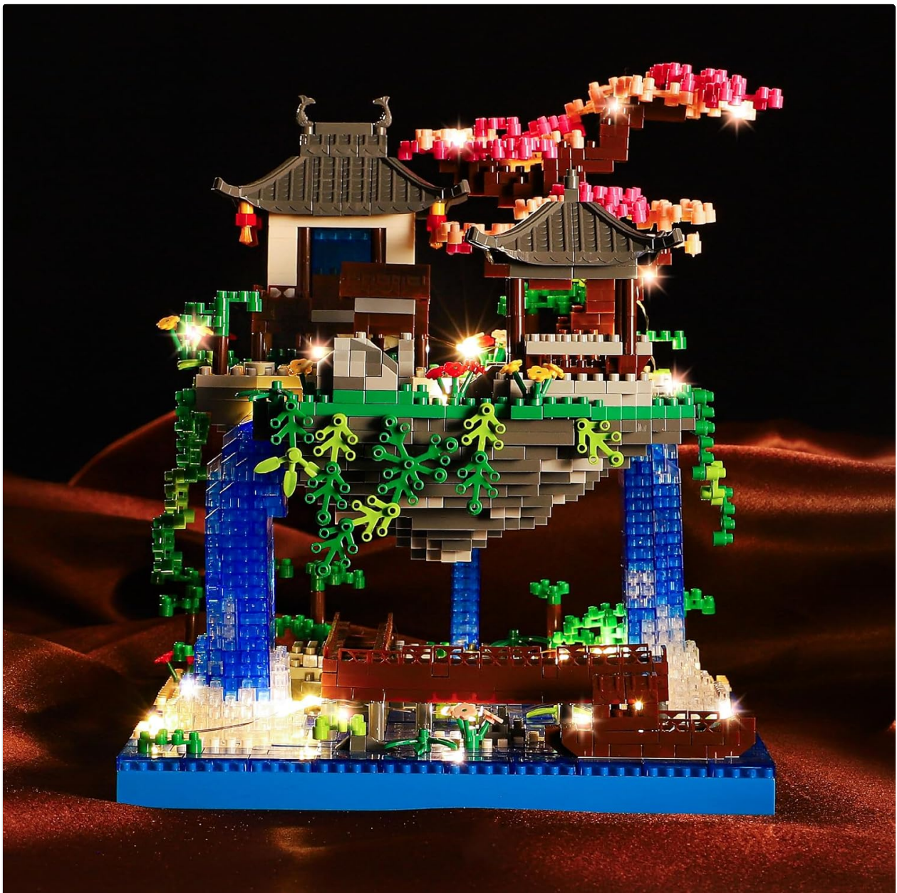
Image: A detailed view of the waterfall and boat components, illustrating the intricate micro-block assembly.