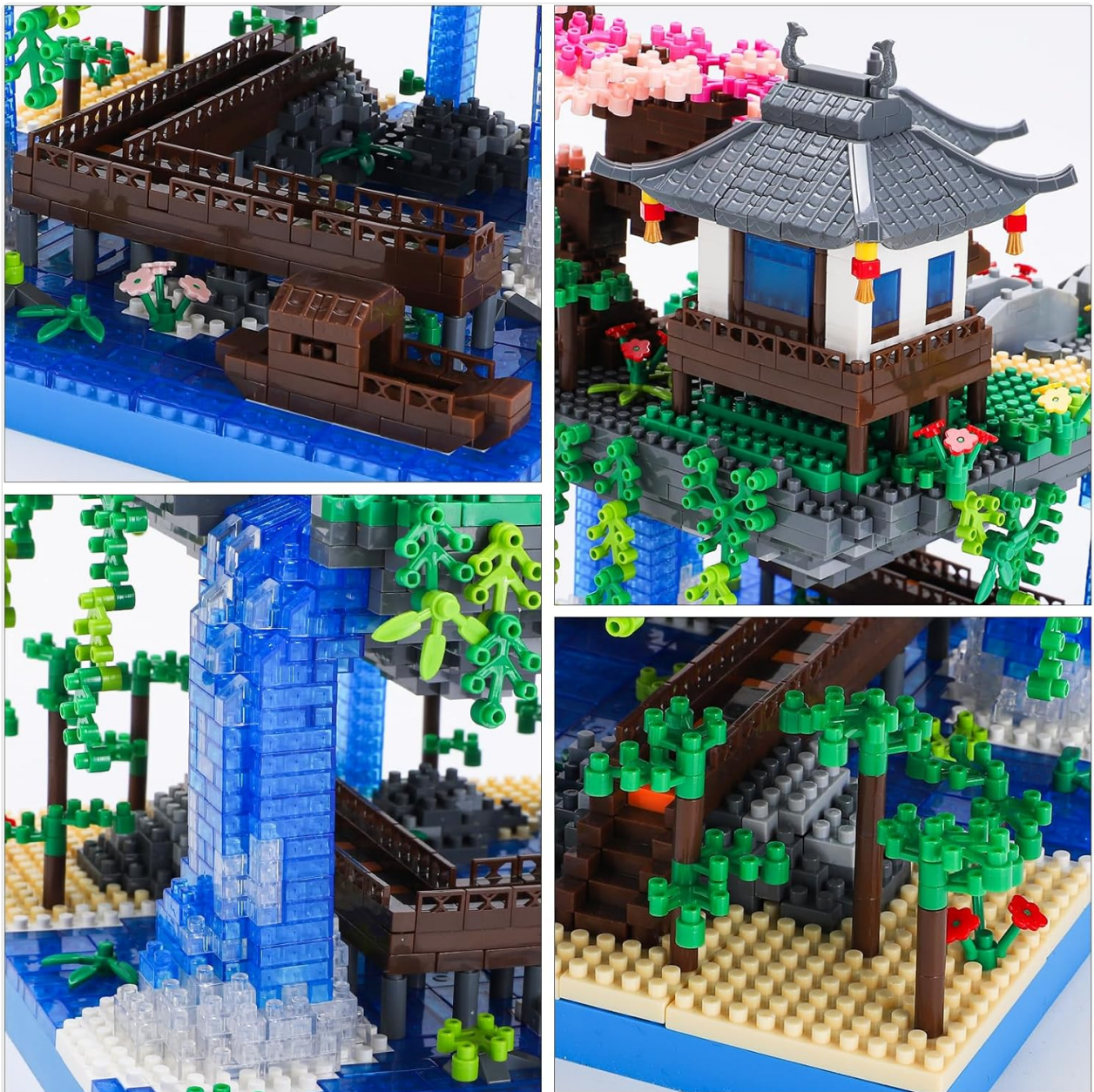
Image: A close-up of the pavilion and peach blossom tree, highlighting the fine details achieved with micro blocks.