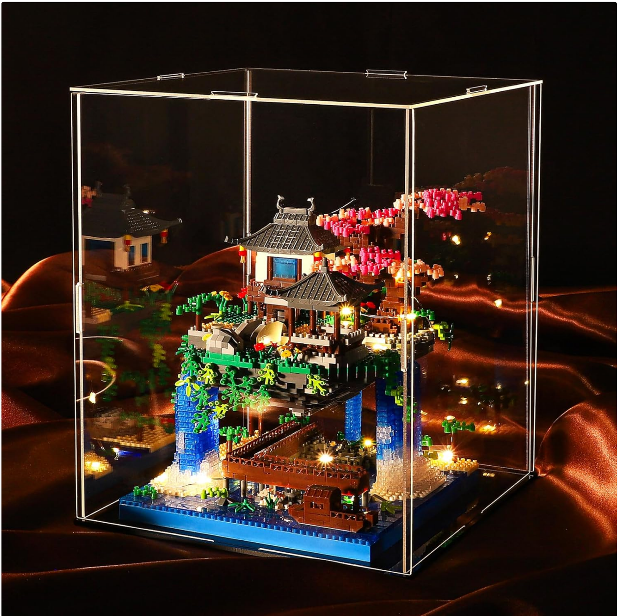
Image: The completed Peach Blossom Pond model showcased within its acrylic display case, highlighting its aesthetic appeal.