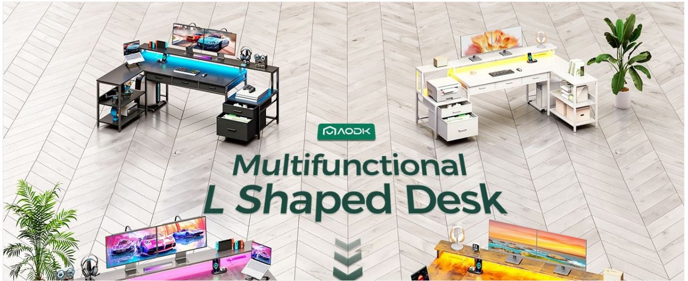
Image: Overview of the multifunctional L Shaped Desk, showing different arrangements and storage capabilities.