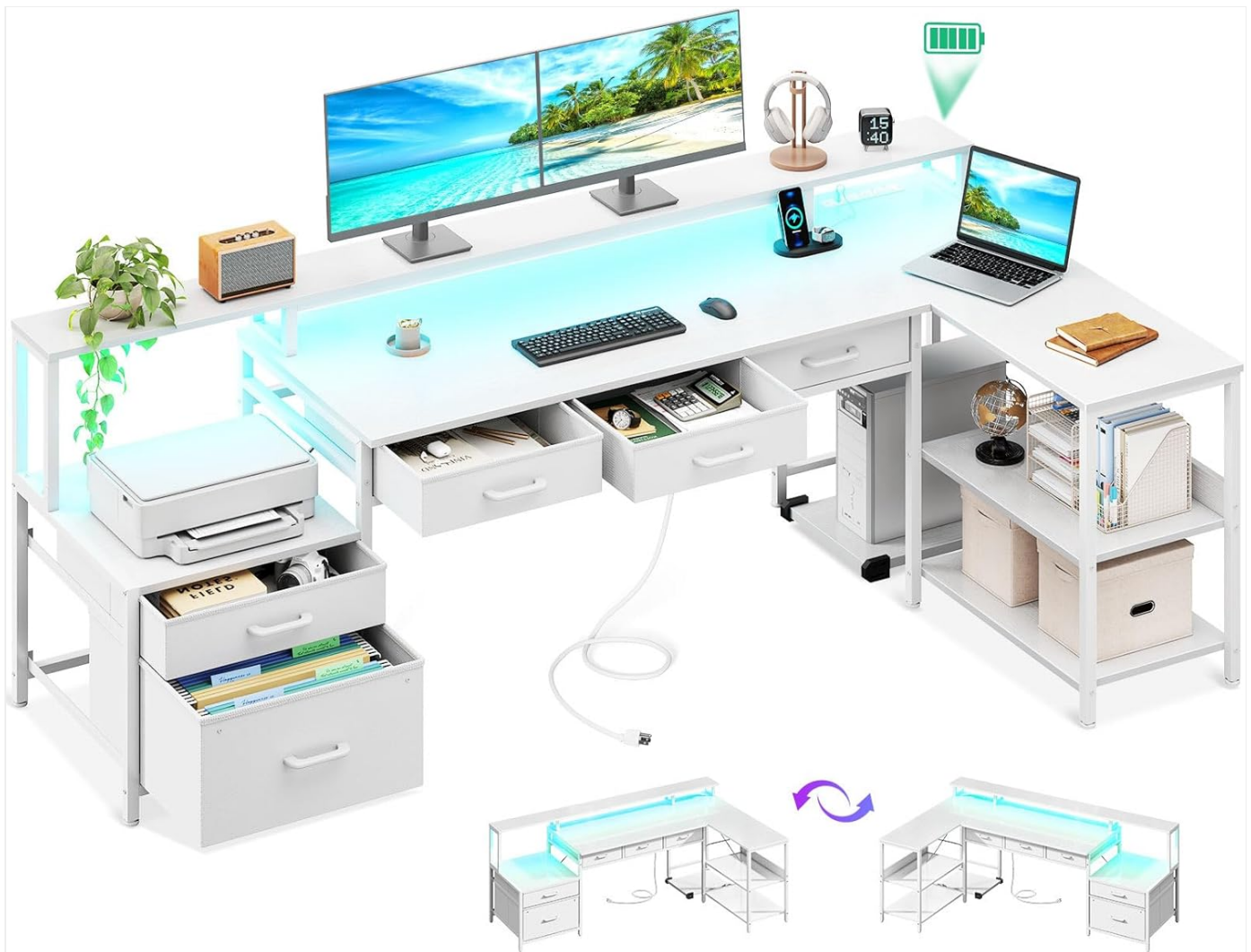
Image: The AODK 75-inch L Shaped Desk, showcasing its full configuration with monitors, laptop, and organized storage.