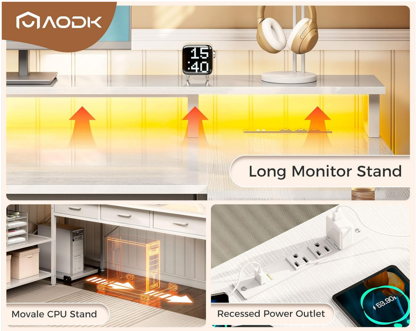
Image: Detailed view of the long monitor stand, movable CPU stand, and the integrated power outlet with USB ports.