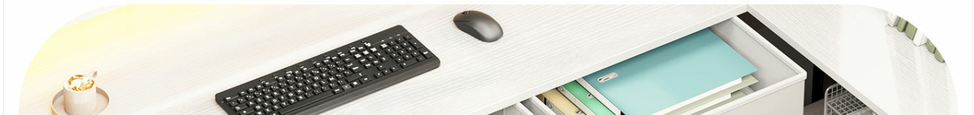
Image: The ample storage space provided by the desk, featuring three under-desk fabric drawers filled with various office supplies.