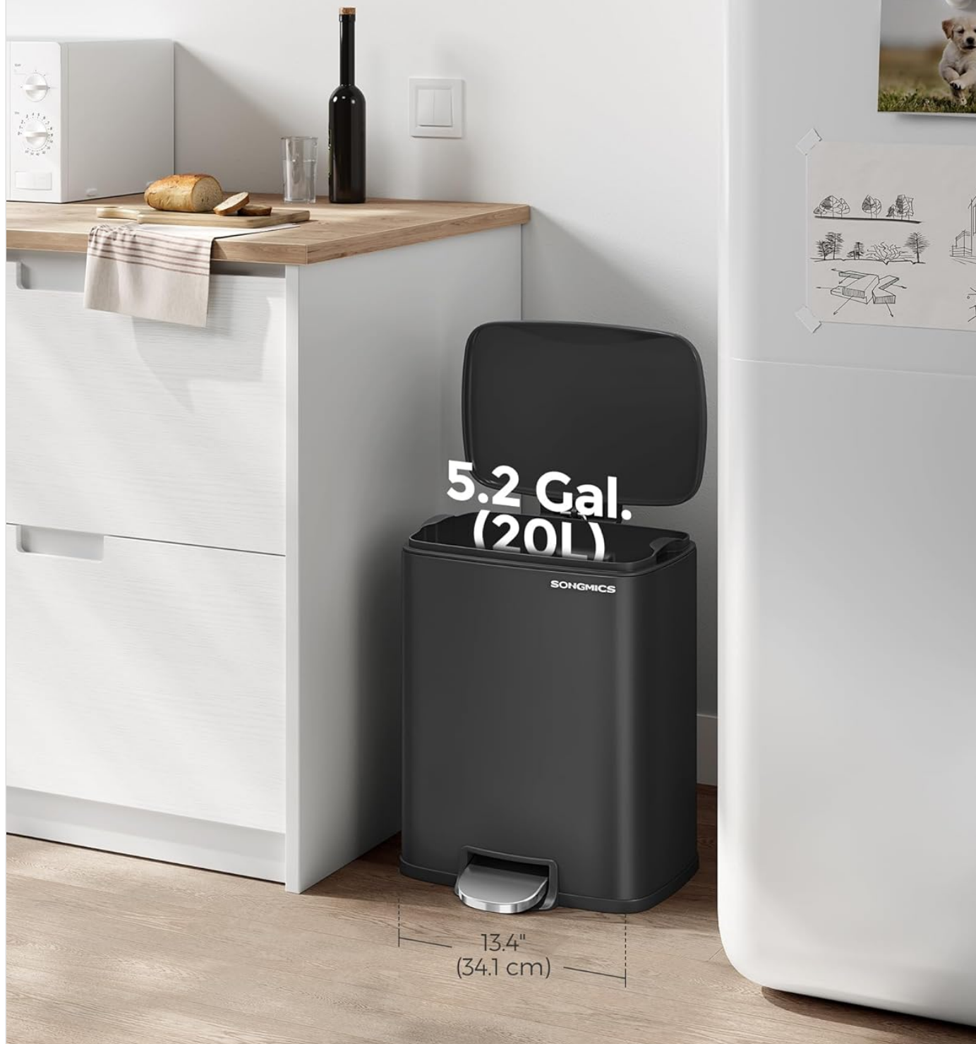
Image: Detailed dimensions of the trash can and its inner bucket.