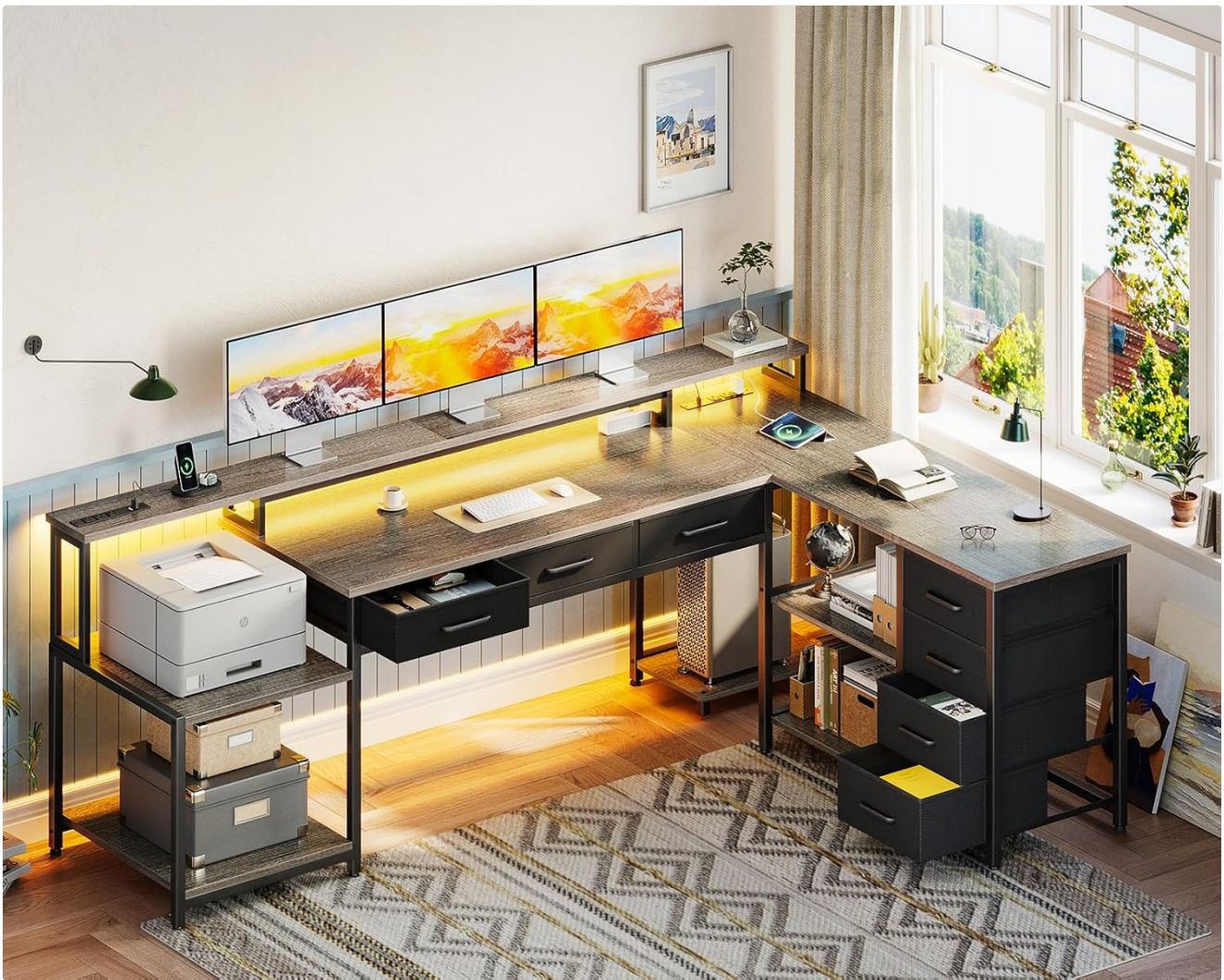
Image: The AODK 79-inch L-Shaped Desk in a modern office setup, featuring multiple monitors, a printer, and organized storage.