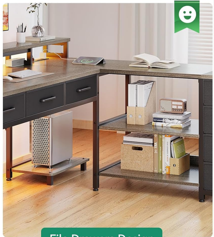
File Drawers Design

Image: Detailed diagram showing the overall dimensions and key measurements of the AODK L-Shaped Desk.