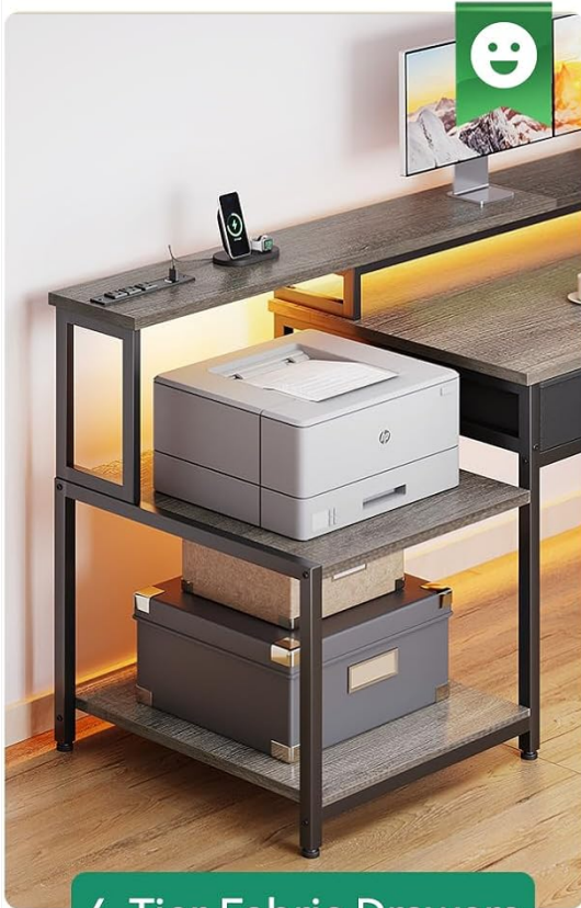
4-Tier Fabric Drawers