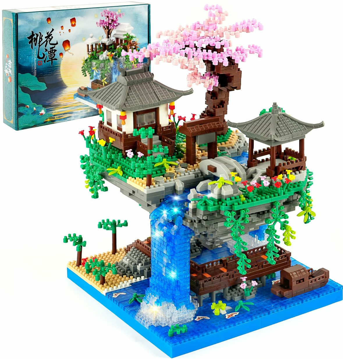
The complete HOTUT Cherry Blossom Micro Building Block Kit, showcasing its unique design and LED light feature.