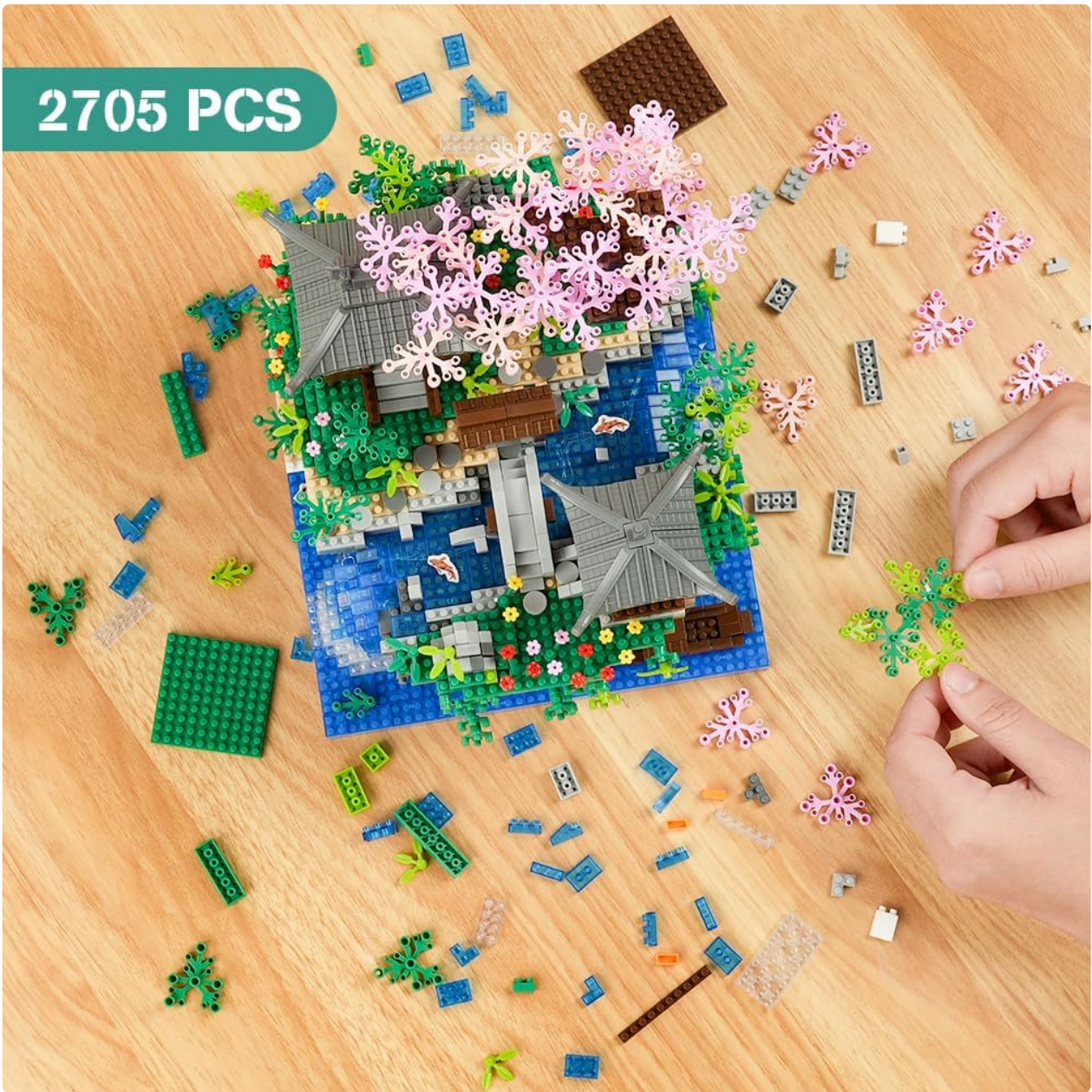
An overview of the micro building blocks and the assembly process, emphasizing the small size of the components.