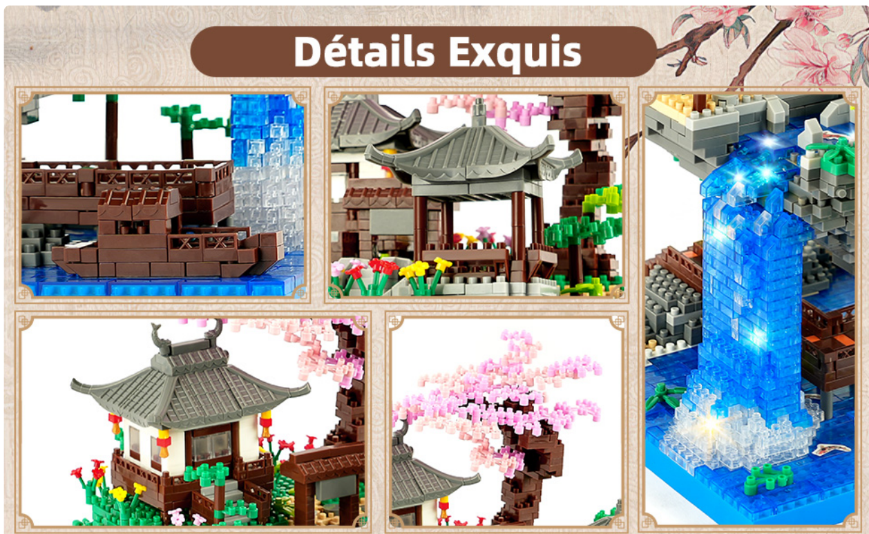
Close-up images highlighting the intricate details of the waterfall, pavilion, and cherry blossom elements.