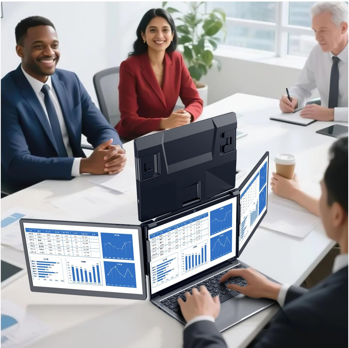
Image: A laptop with the ADREAMER AireScreen13S attached, displaying a quad-screen setup in an office environment.