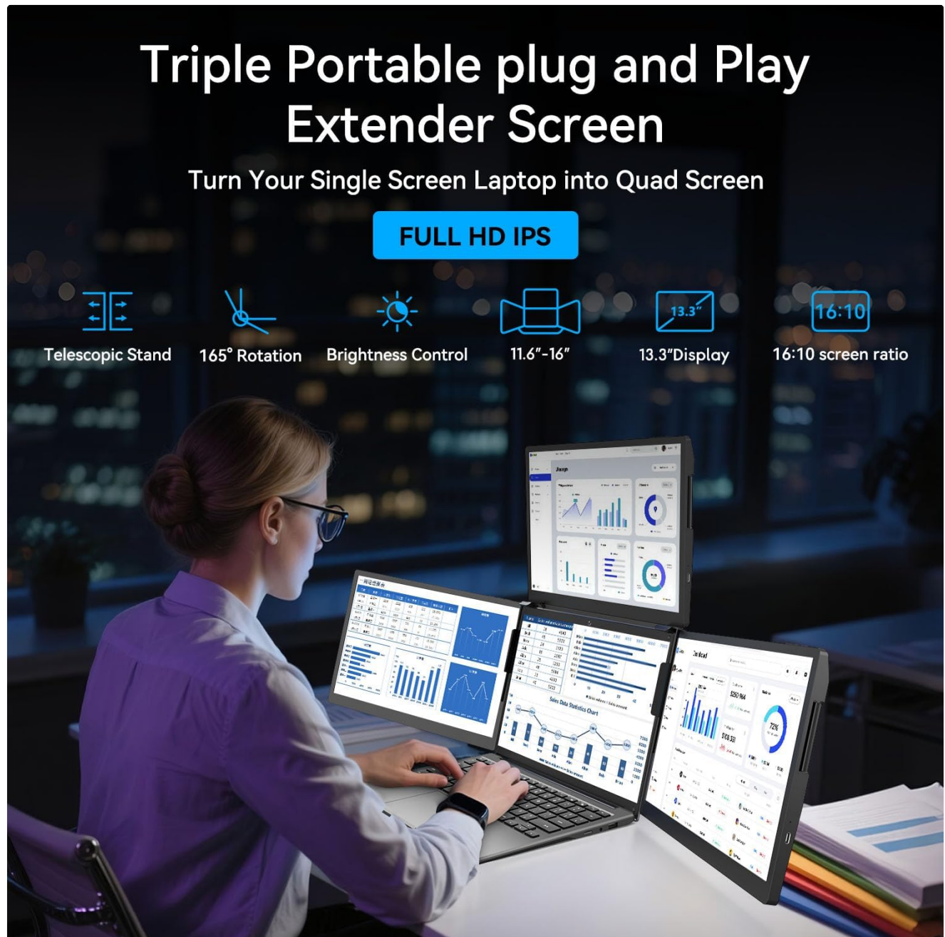
Image: The ADREAMER AireScreen13S demonstrating its versatile screen rotation capabilities, allowing for various configurations.

The side and upper screens can be rotated up to 165 degrees, allowing for customizable viewing angles to suit various tasks and environments. This flexibility is ideal for multi-participant meetings, data analysis, programming, or remote teamwork. The independent support bracket ensures stability during adjustments.