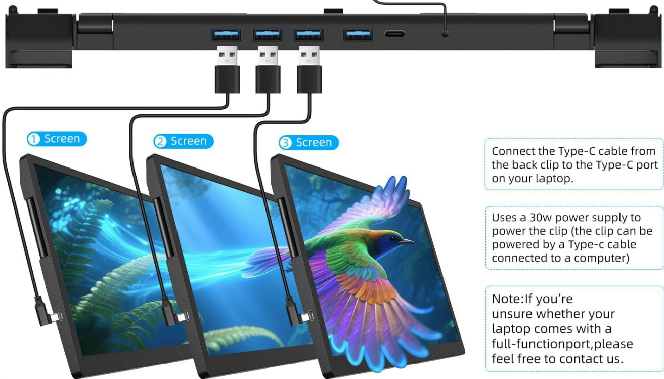
Image: A visual guide to connecting the three display cables and the main power/data cable from the monitor extender to a laptop.