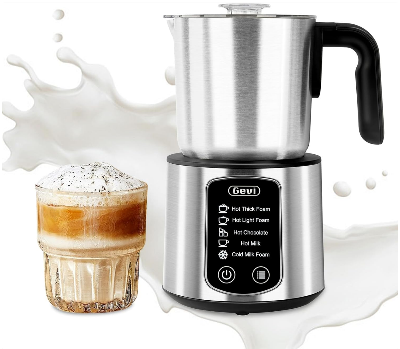
The Gevi Hot Chocolate Maker and 5-in-1 Milk Frother, showcasing its sleek stainless steel design and control panel.