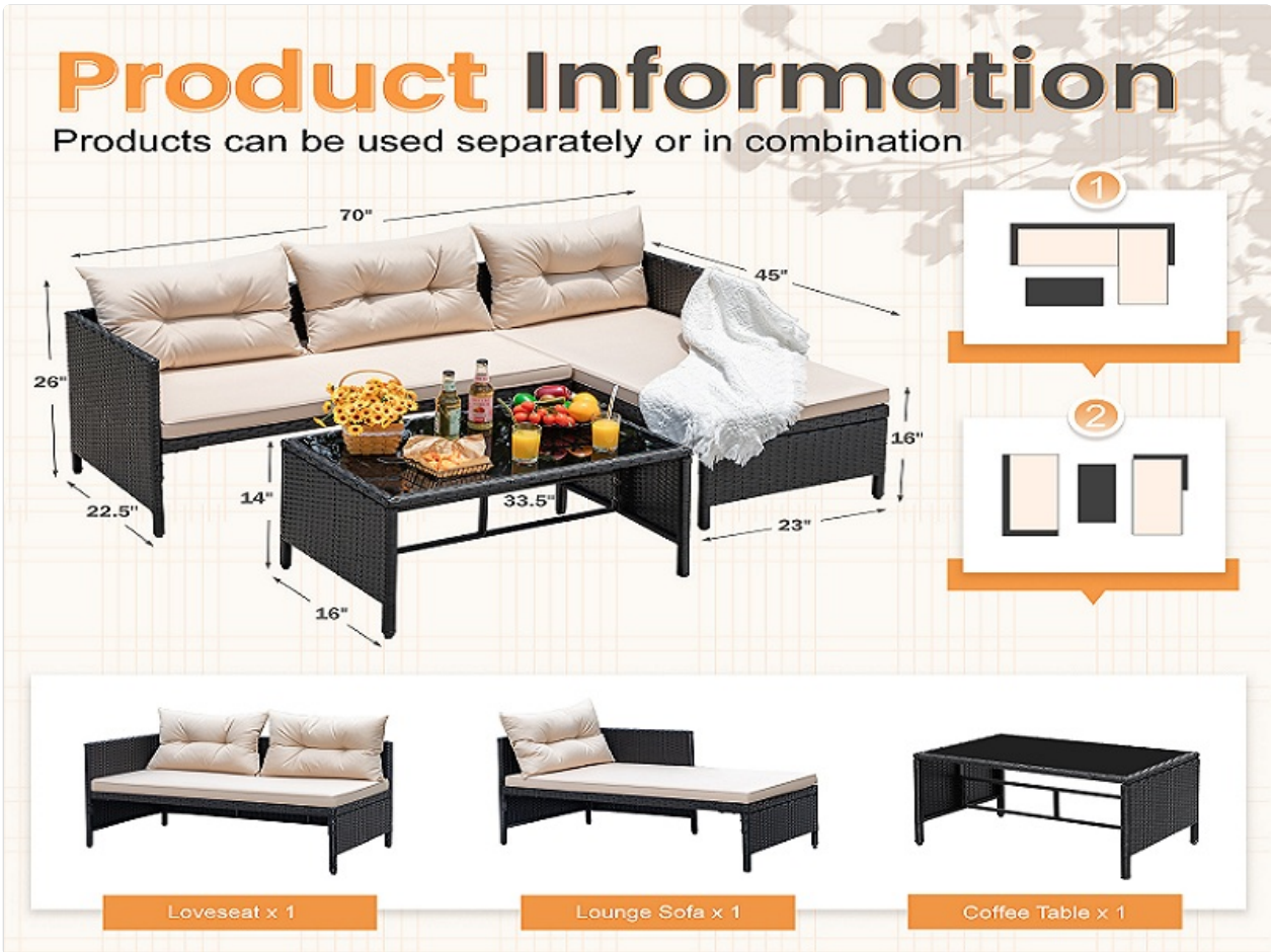
Image: An illustration detailing the dimensions and individual components of the Devoko 3-piece patio furniture set, including a loveseat, lounge sofa, and coffee table.