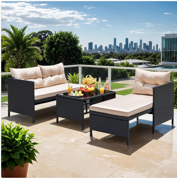
Image: The Devoko sectional sofa arranged in an L-shape on a patio, demonstrating a common setup.