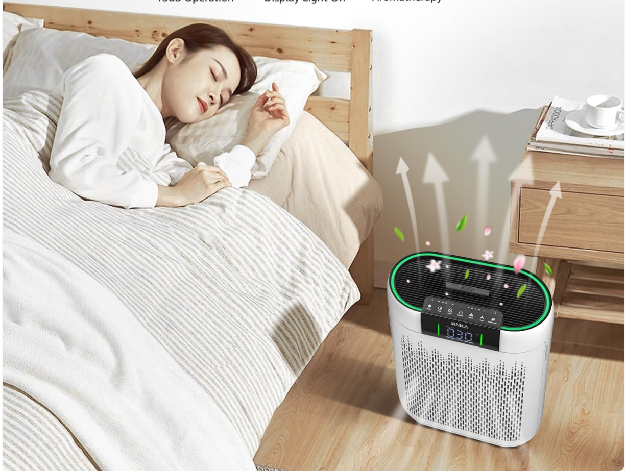
Image: The air purifier in a bedroom setting, highlighting its low noise operation, display light off feature, and aromatherapy function for peaceful sleep.