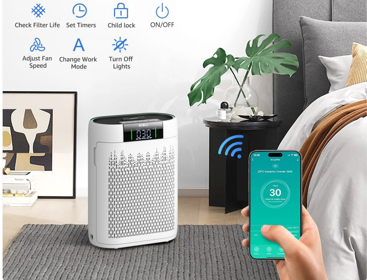
Image: The air purifier connected to the 'Smart Life' app on a smartphone, demonstrating remote control capabilities.

Setting schedule and control functions from free Smart Life app