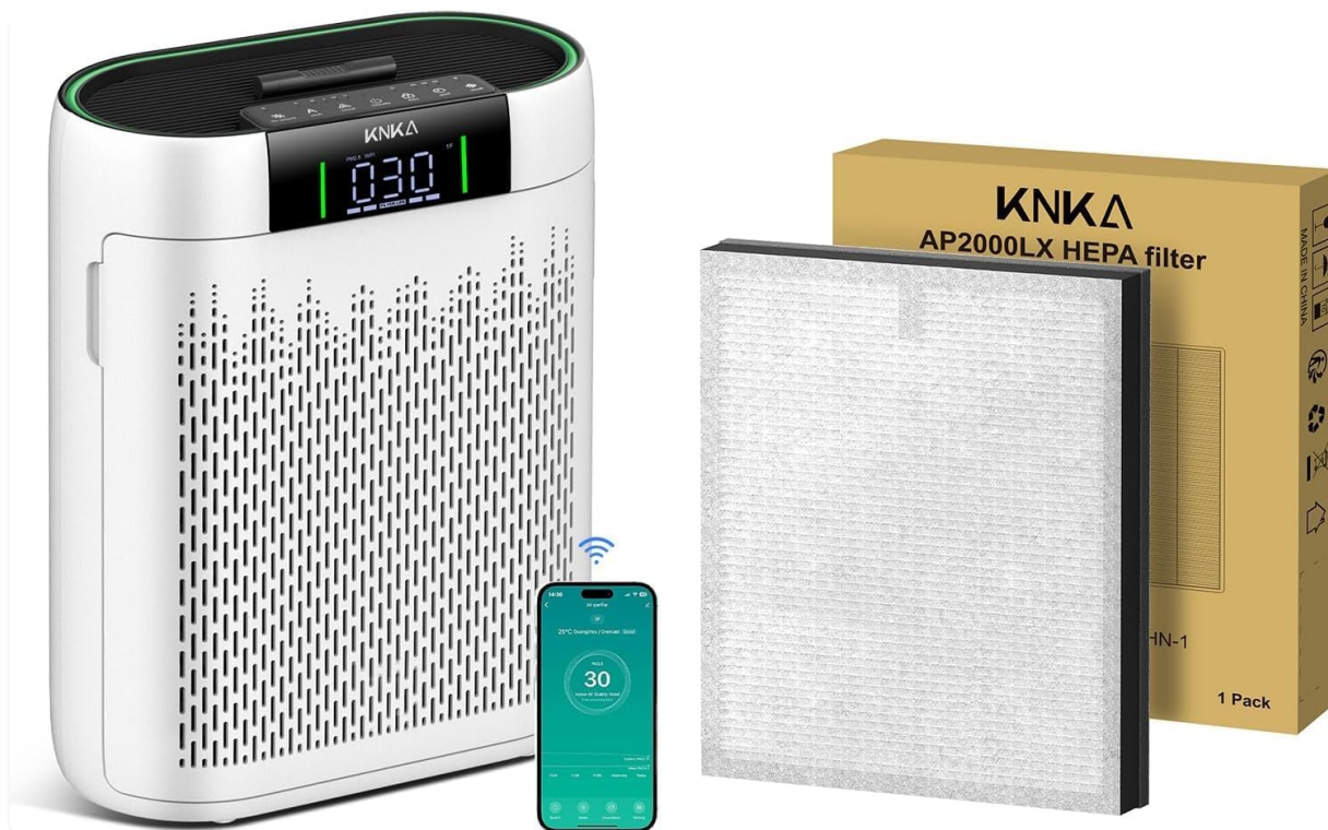
Image: KNKA AP2000WF Air Purifier with its genuine replacement filter.

The KNKA AP2000WF Air Purifier is designed to provide clean and fresh air by effectively capturing airborne particles. It features advanced filtration, real-time air quality monitoring, and smart control options for a healthier indoor environment.