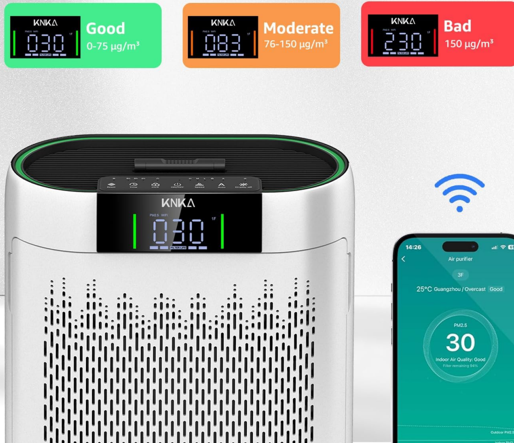
Image: The air purifier's display showing PM2.5 readings and how they correspond to Good, Moderate, and Bad air quality indicators.

More accurate identification of air quality View real-time PM2.5 readings