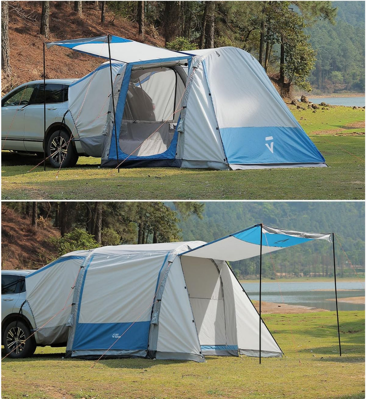
Figure 5: Tent with flexible sunshades extended.