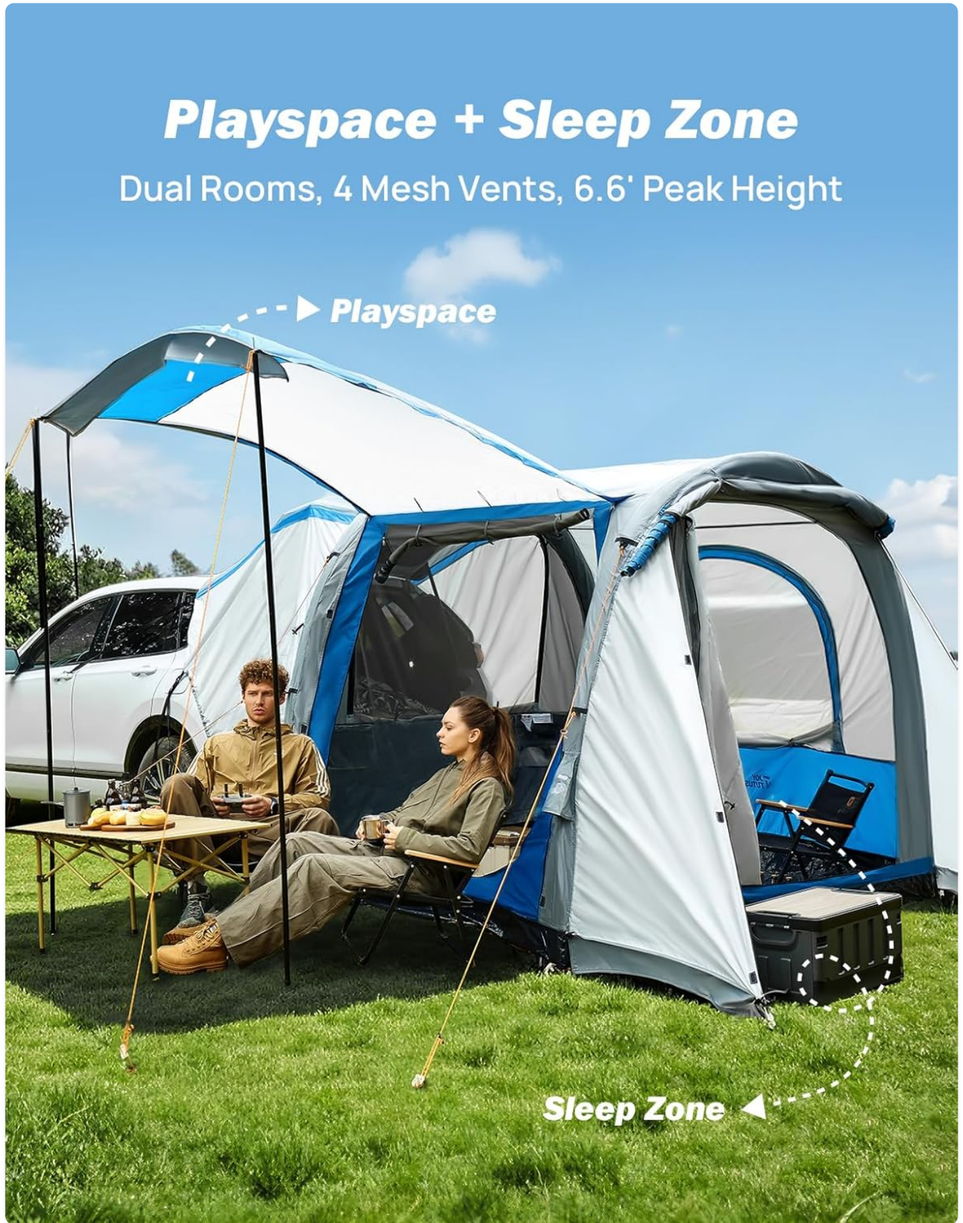
Figure 6: Interior layout with designated playspace and sleep zone.

The tent features dual doors and multiple mesh windows to enhance ventilation and provide easy access. The mesh screens keep insects out while allowing airflow. The main tent area offers a 6.6 ft peak height for comfortable movement.