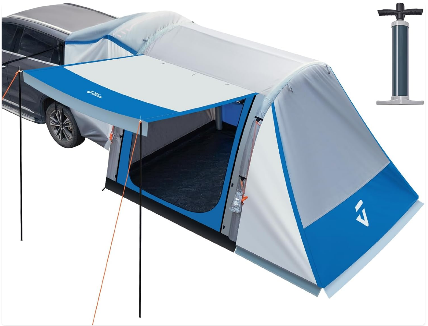
Figure 1: JOYTUTUS Inflatable SUV Tent (Model H1201-01011-BL) in use with an SUV.