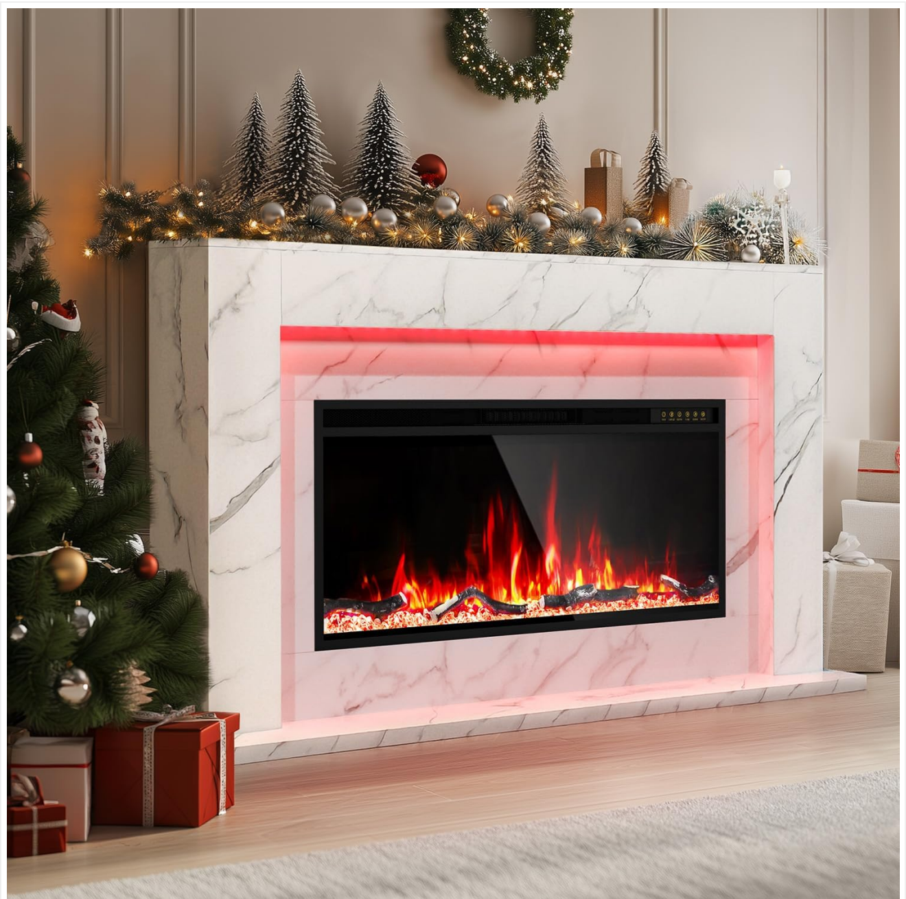
Figure 2.1: Front view of the Eshoma 60 Inch Electric Fireplace with Mantel, showcasing its white marble finish and realistic flame effect.