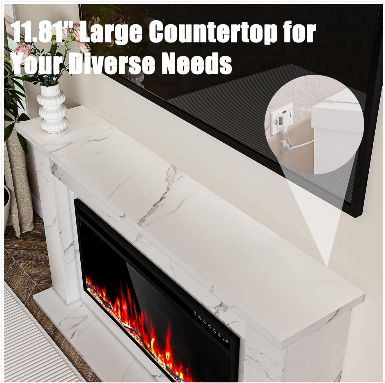
Figure 3.2: Illustration of key structural and aesthetic components of the fireplace mantel.