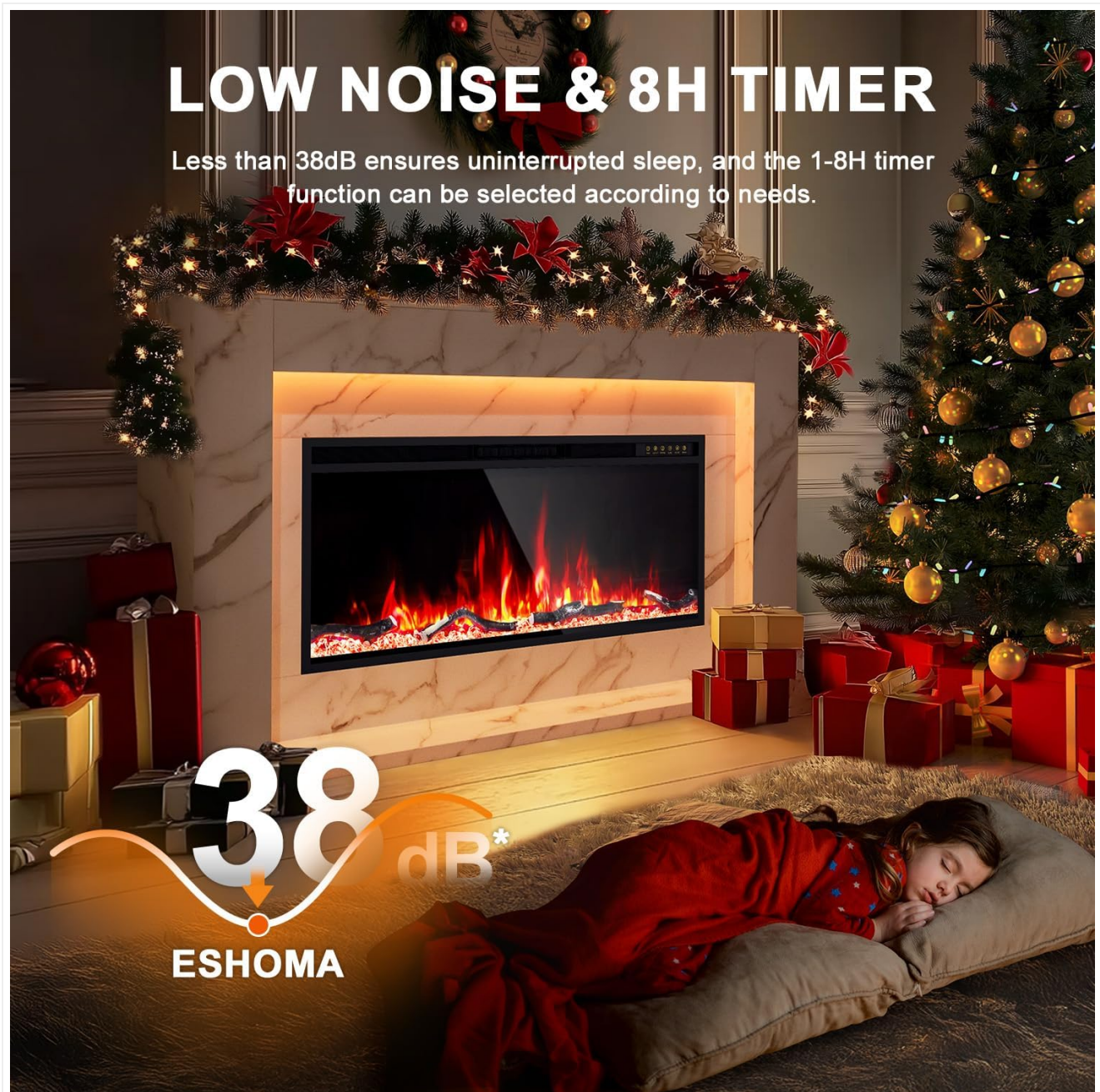
Figure 4.6: The fireplace features quiet operation and a programmable timer for convenience.