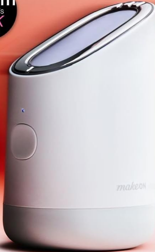
Image: The MakeOn Skin Light Therapy 3 device, highlighting its name and purpose as a beauty device.