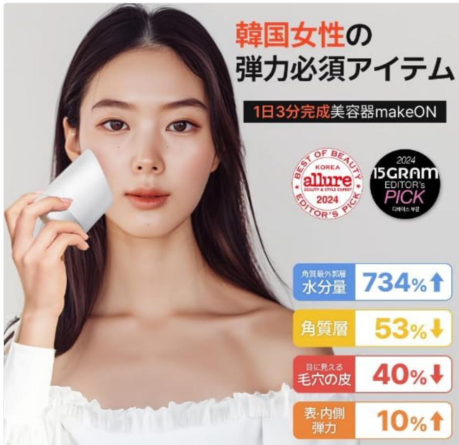
Image: A user demonstrating the device, accompanied by charts illustrating the significant improvements in skin moisture, reduction in dead skin cells and visible pores, and enhanced elasticity.