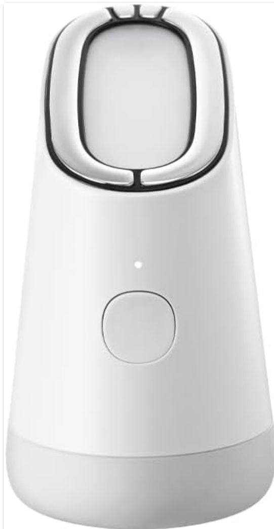
Image: The main unit of the MakeOn Skin Light Therapy 3, illustrating its compact design and primary controls.

To power on the device, press and hold the main button until the indicator light illuminates. Press the button briefly to cycle through the available modes. The device features 5 distinct modes, including a newly added Retinol mode, each designed for specific skin concerns.