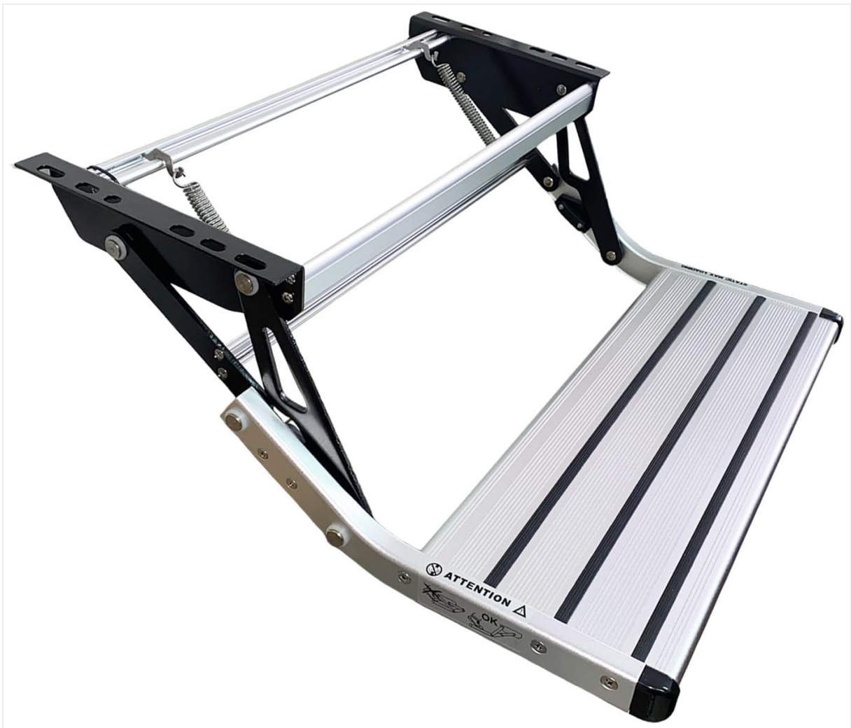
Figure 3: GEARFLAG RV Step in extended position.