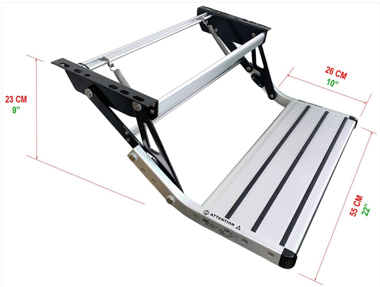
Figure 5: Extended dimensions of the RV step.