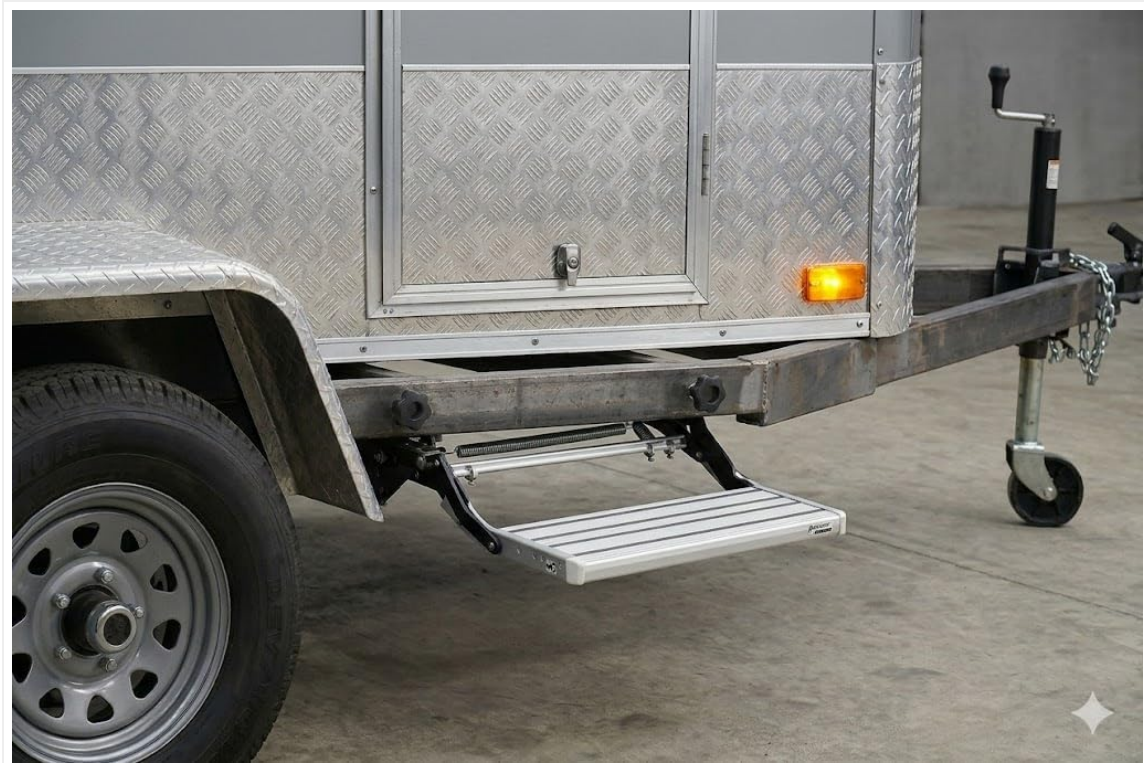
Figure 2: GEARFLAG RV Step installed on a trailer.