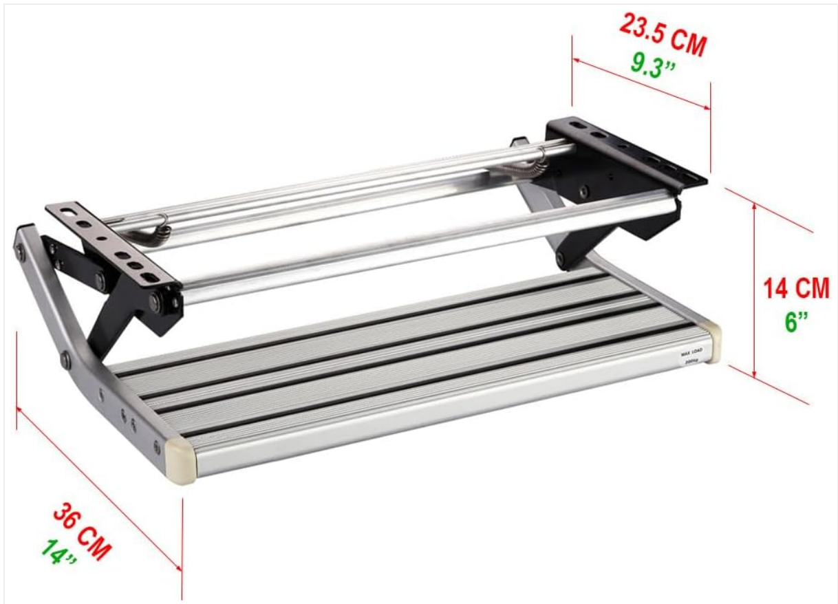
Figure 6: Folded dimensions of the RV step.