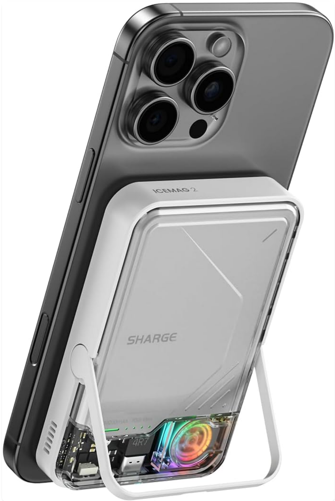
Figure 1: ICEMAG 2 MagSafe Power Bank attached to an iPhone, demonstrating its compact design and integrated stand.