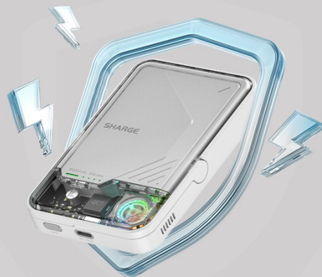
Figure 9: Visual representation of the comprehensive safety features built into the ICEMAG 2.