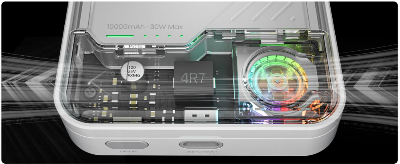
Figure 3: Detailed view of the ICEMAG 2's active cooling system, showing the internal fan and transparent design.