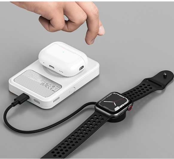
Figure 7: The power bank charging smaller devices like earbuds and a smartwatch, demonstrating low-power mode functionality.

Low-Power mode designed specifically for wearable devices providing better protection.