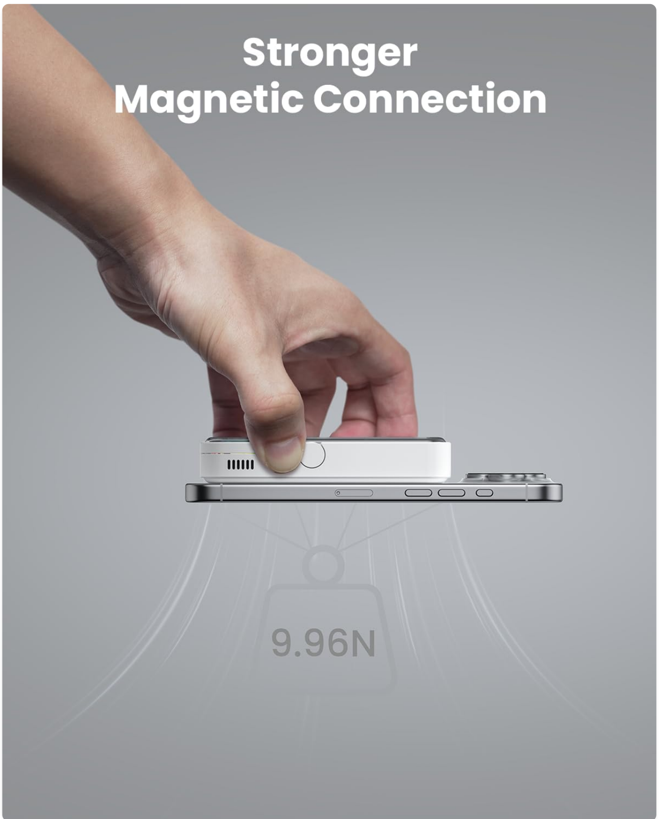
Figure 4: Demonstration of the strong magnetic connection between the power bank and a smartphone.