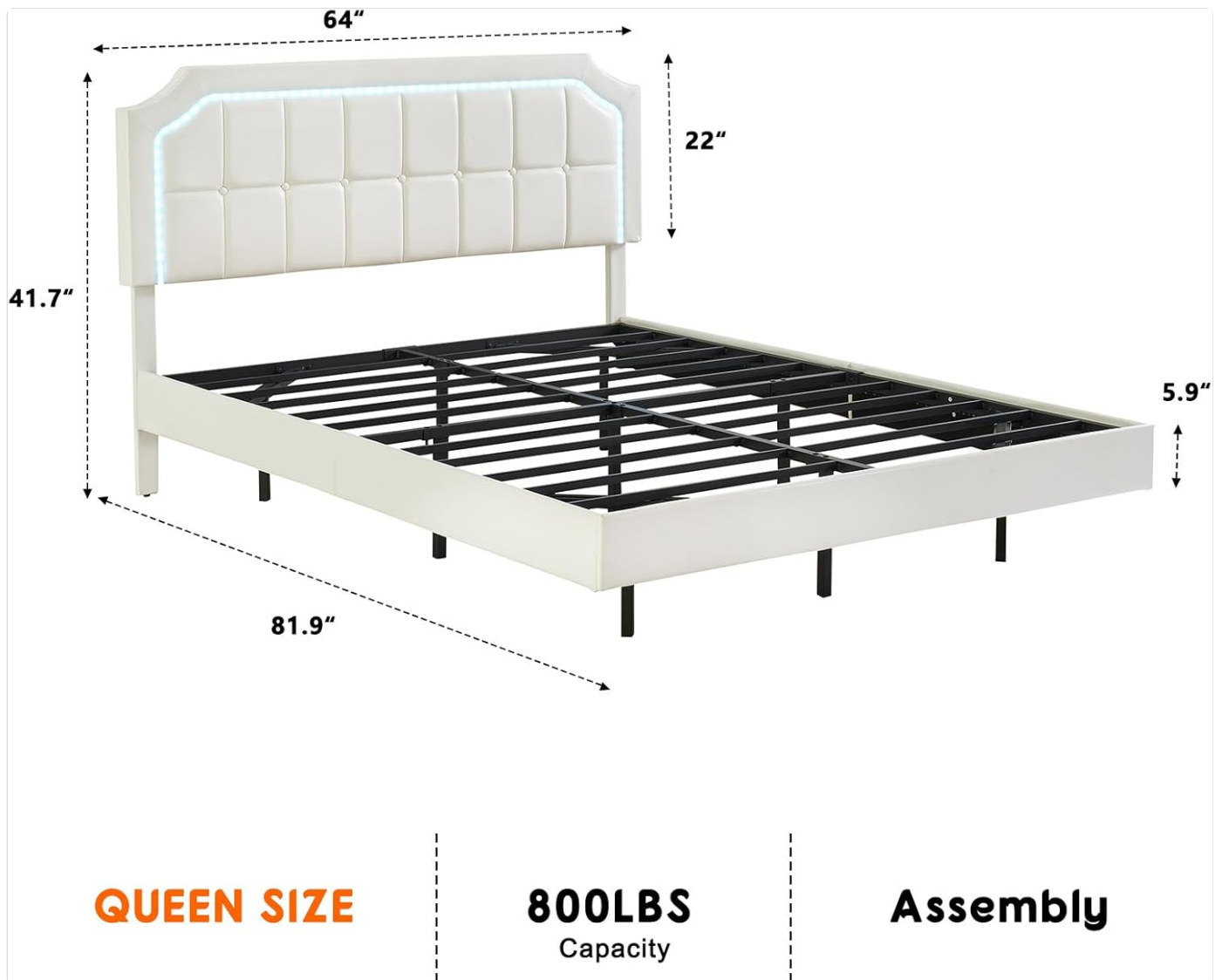
Image: Diagram showing the dimensions of the GAOMON Queen Size Floating Bed Frame (81.9"L x 64"W x 41.7"H) and its components, including the headboard height and frame height.