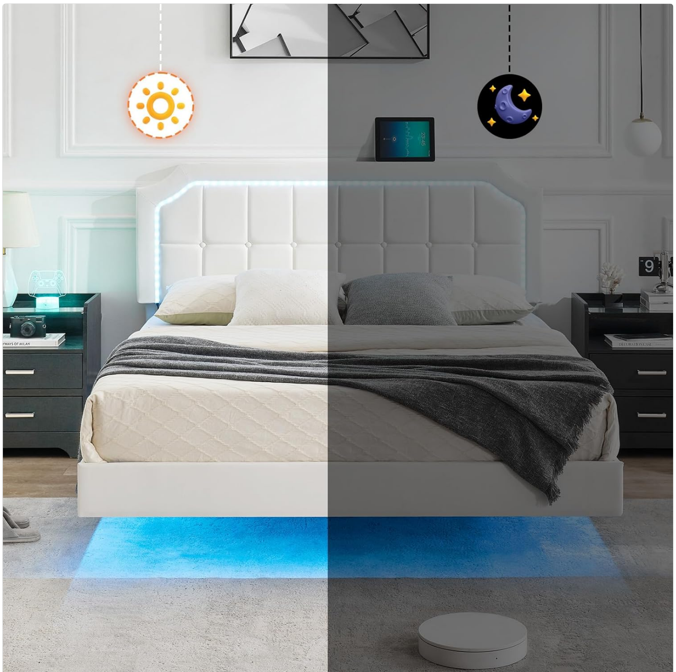
Image: A split image demonstrating the visual effect of the GAOMON bed frame's LED lights in both daytime and nighttime settings, showcasing the ambient glow.