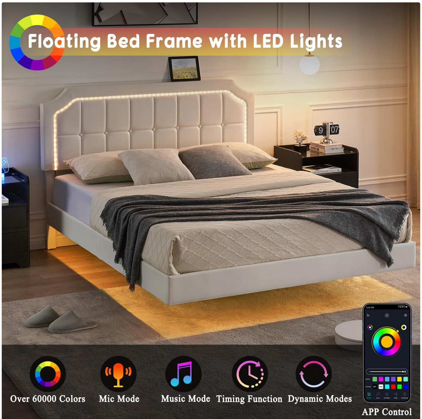
Image: Visual representation of the GAOMON floating bed frame with LED lights, highlighting features such as over 60,000 colors, mic mode, music mode, timing function, dynamic modes, and control via a mobile application.