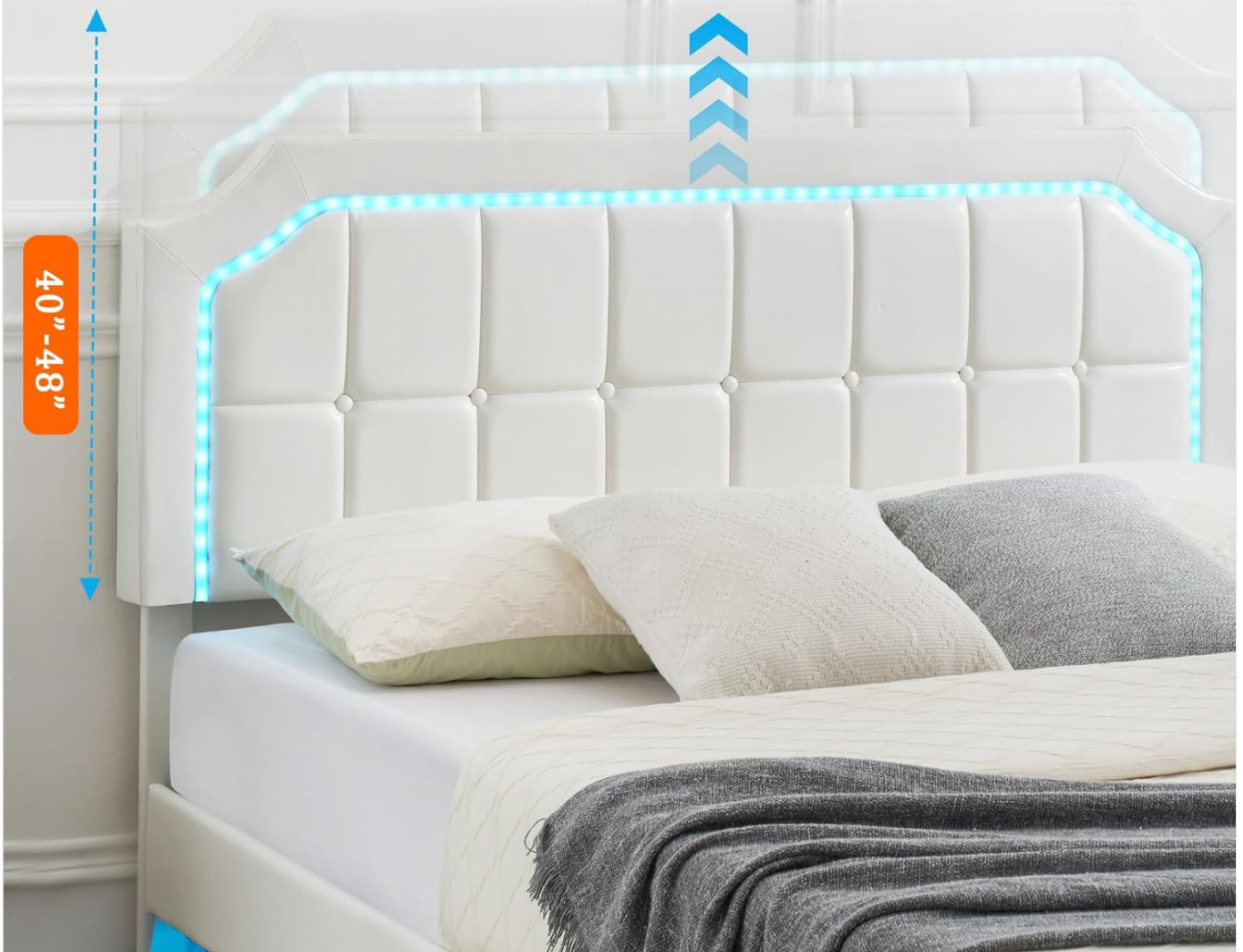
Image: Illustration showing the adjustable height feature of the headboard, ranging from 40 to 48 inches, with a recommendation for mattresses between 6 and 14 inches thick.