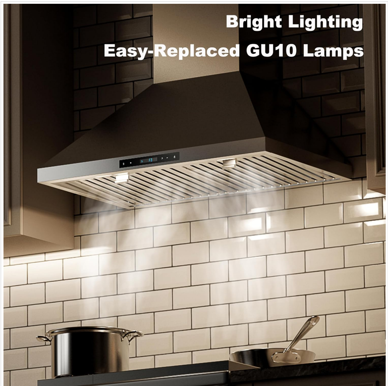
Figure 6: View of the range hood with its bright, easy-to-replace GU10 LED lights illuminating the cooking surface.

Illuminate your cooking area with the bright LED lights. Press the light button on the control panel or remote to turn the lights on or off. The GU10 lamps are easy to replace.