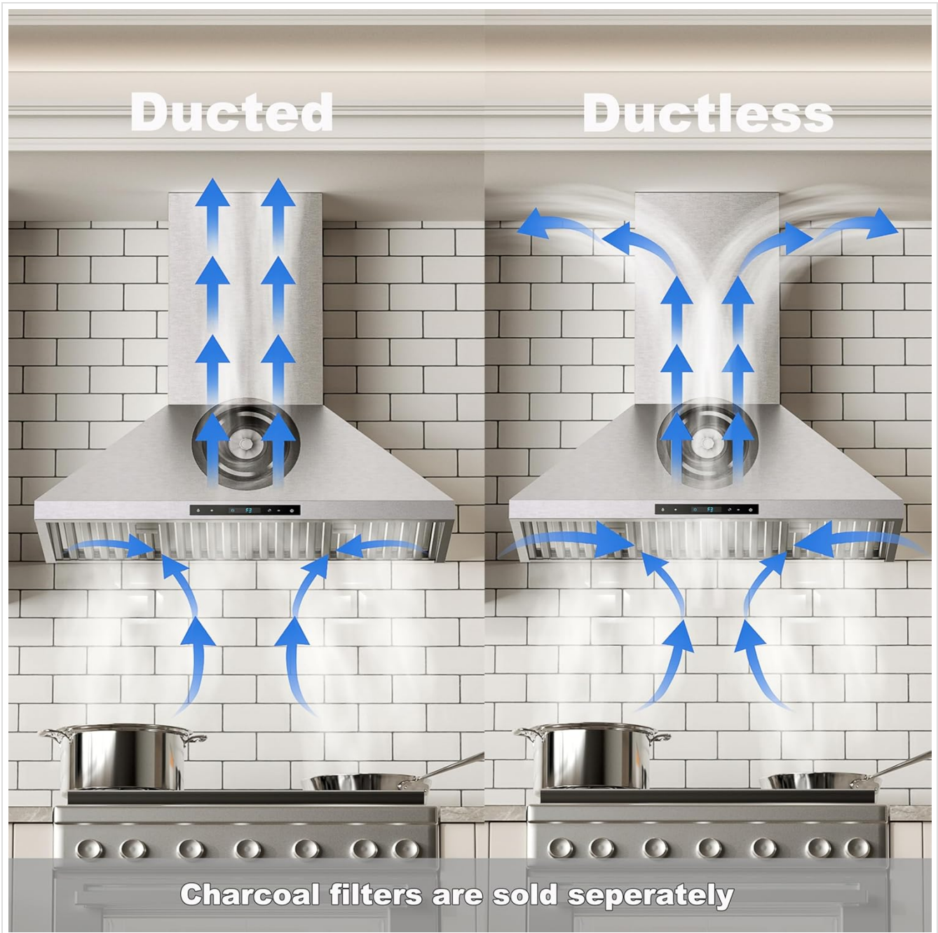
Figure 2: Illustration of ducted and ductless installation methods. Charcoal filters are required for ductless operation.

For ducted installation, connect the flexible venting pipe to the range hood's exhaust outlet and extend it to the outside. Ensure the pipe is fully extended and has minimal bends for optimal airflow. For ductless installation, install the charcoal filters (sold separately) and ensure the air is recirculated back into the kitchen through the chimney vents.