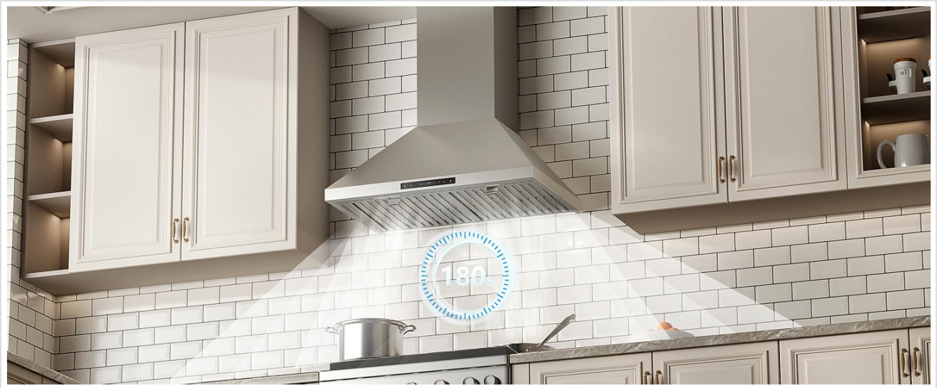
Figure 7: Close-up of the durable, dishwasher-safe stainless steel baffle filters.