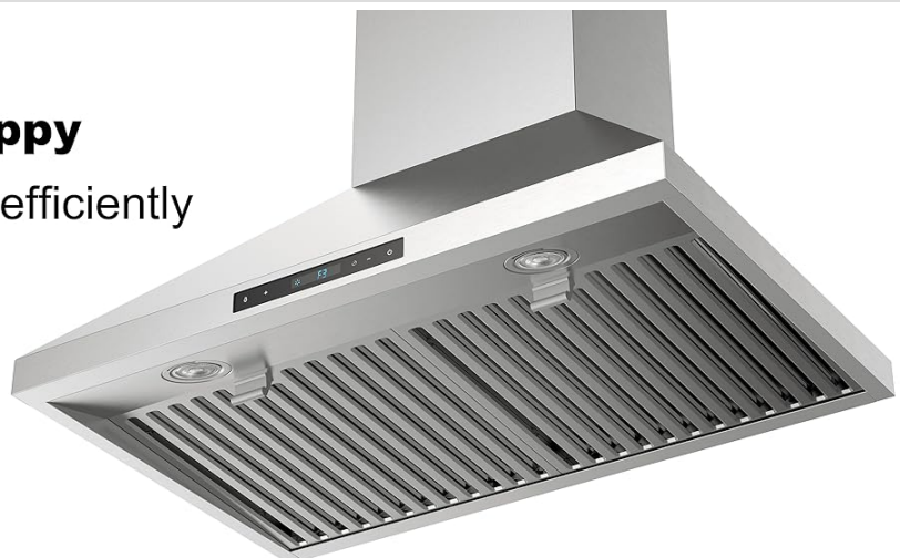
Figure 5: Highlighting the efficient and quiet operation of the premium brushless DC motor.

Sunken Smoke Canopy captures cooking fumes efficiently