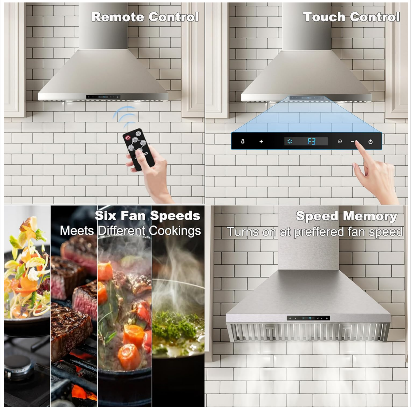
Figure 3: Close-up of the touch control panel and included remote control for easy operation.

The range hood features a sleek touch control panel and comes with a remote control for convenient operation from anywhere in your kitchen.