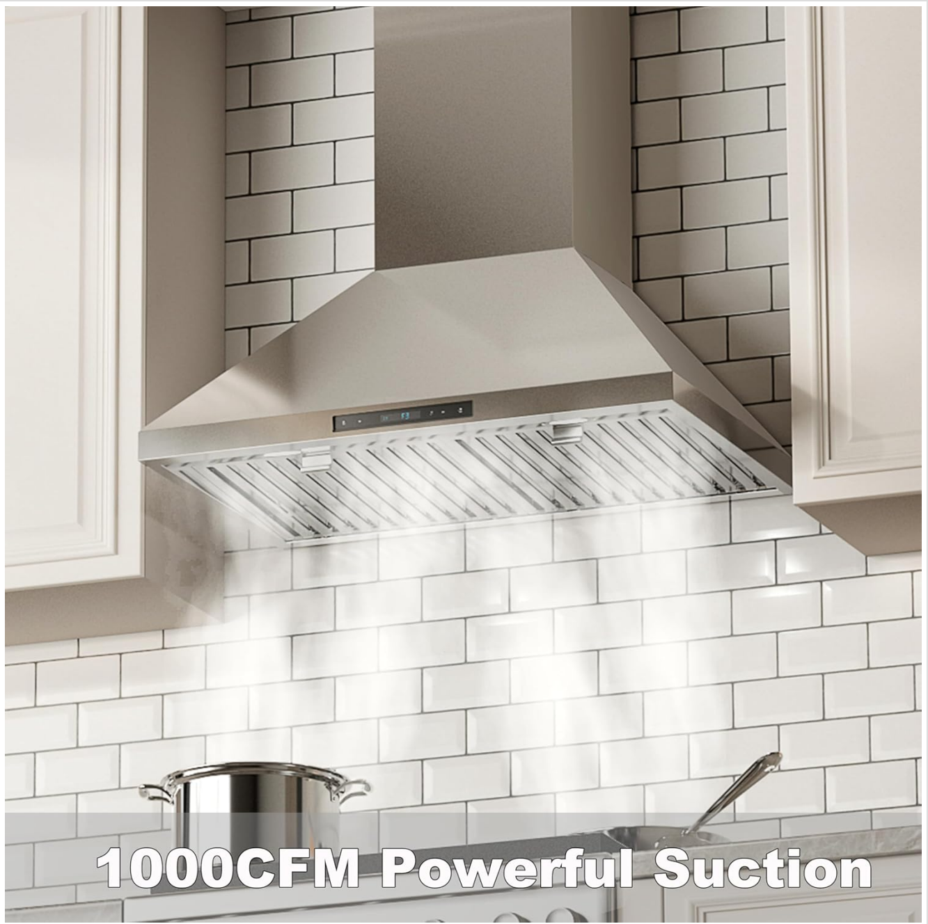
Figure 4: Demonstrates the powerful 1000 CFM suction capability of the range hood.

Sunken Smoke Canopy captures cooking fumes efficiently