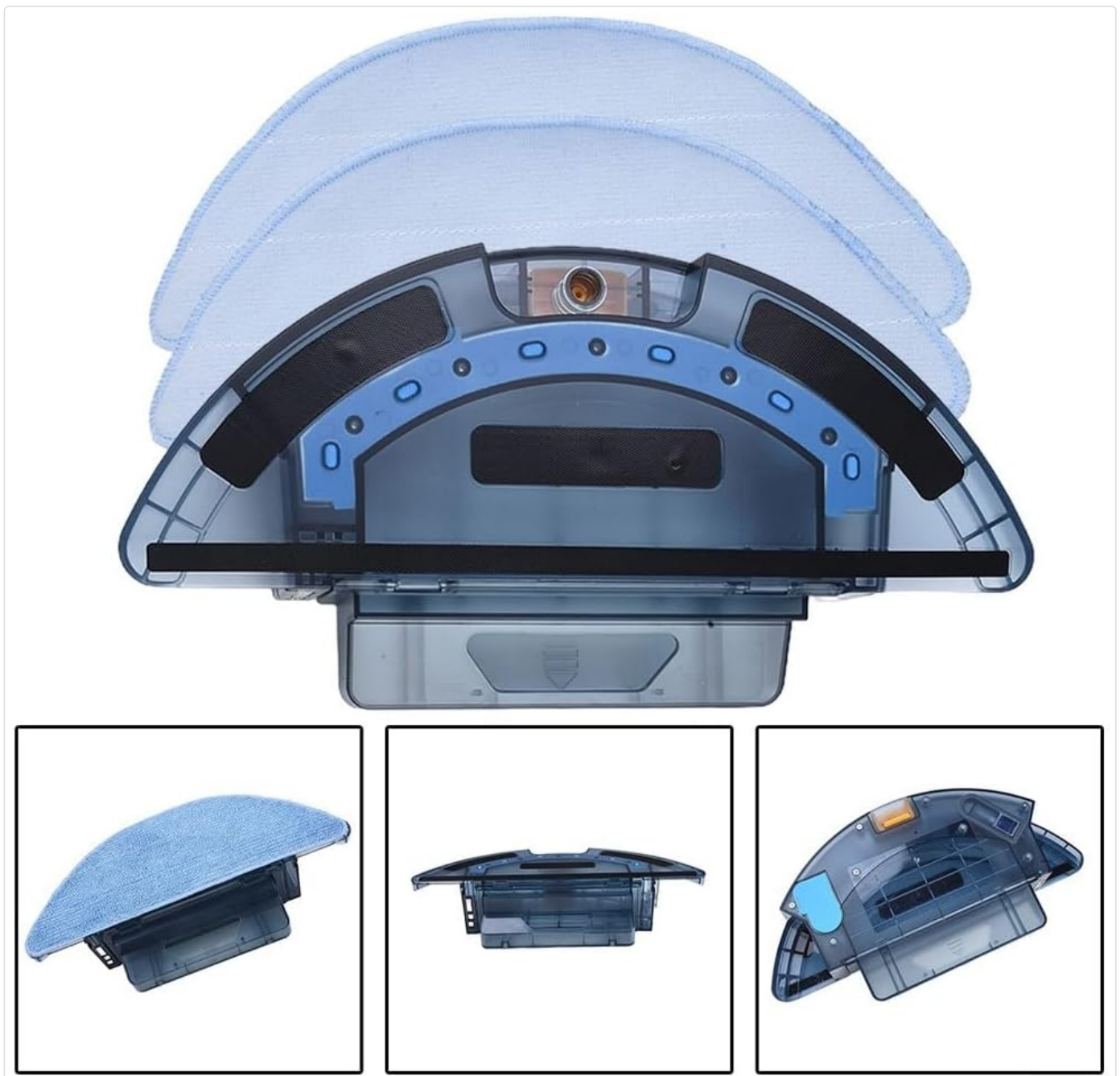
Figure 2: Underside of the water tank, illustrating how the mop cloths are attached.