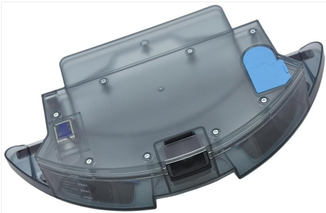
Figure 1: Top view of the water tank, showing the transparent body and the blue fill cap.