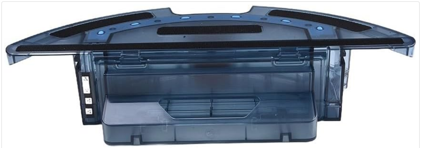
Figure 5: Front view of the water tank, highlighting the main opening for installation into the robot.