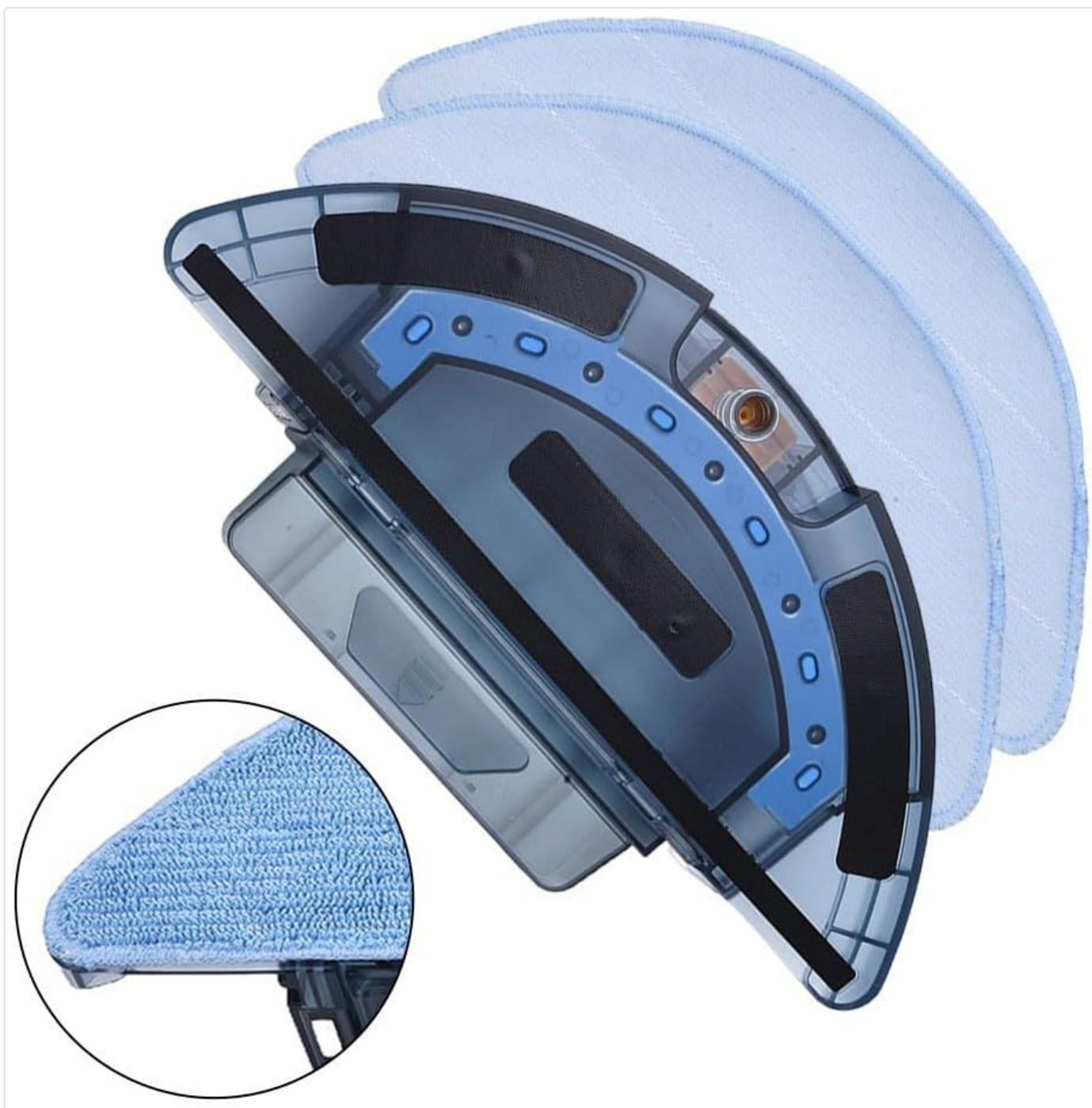
Figure 3: Angled perspective of the water tank, showing the secure attachment points for the mop cloths.