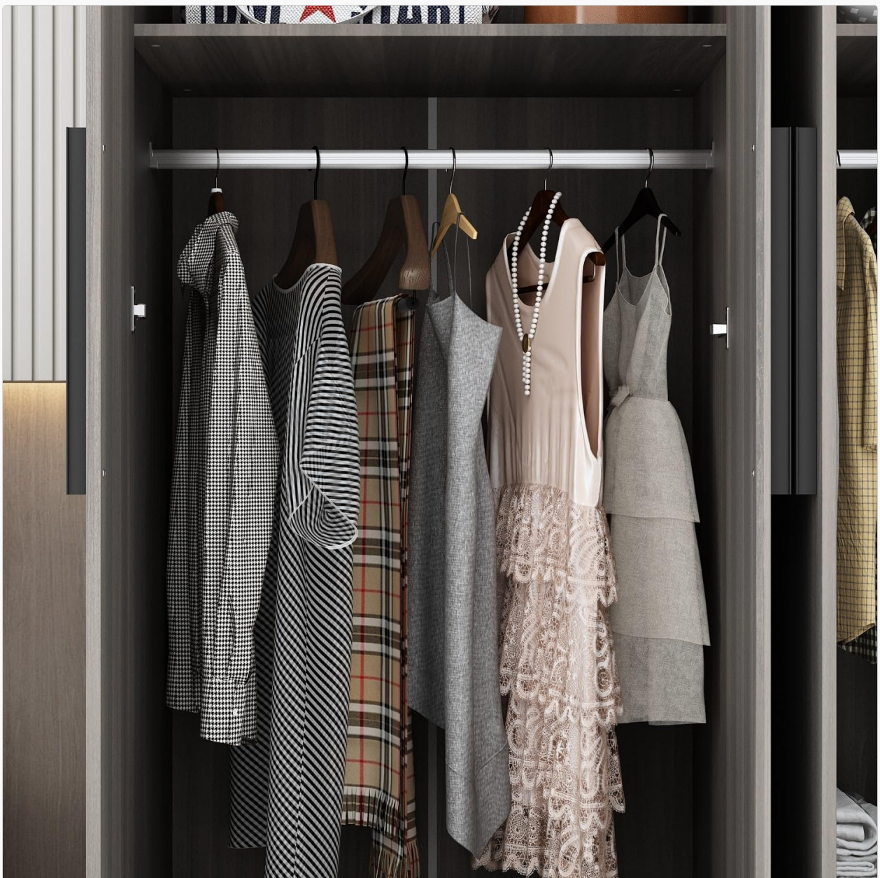
The left cabinet provides ample space for hanging clothes, keeping them organized and accessible.

The wardrobe's design allows for efficient organization of your belongings.