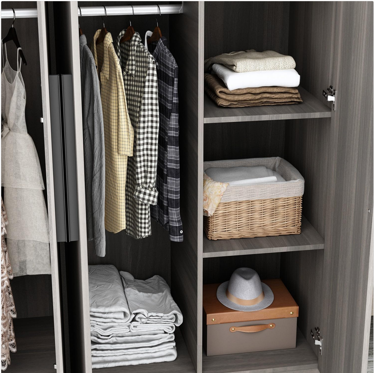
The right cabinet features multiple shelves for storing folded garments, bedding, or other personal items.