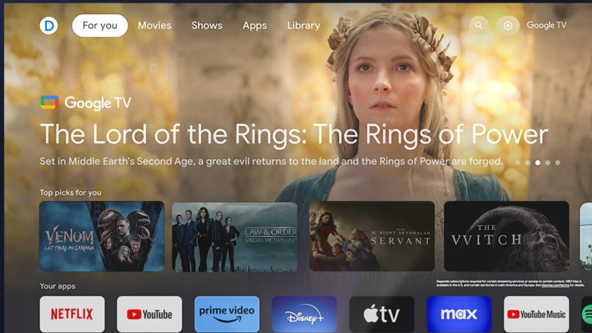
Figure 4.1: Google TV interface with various streaming apps.