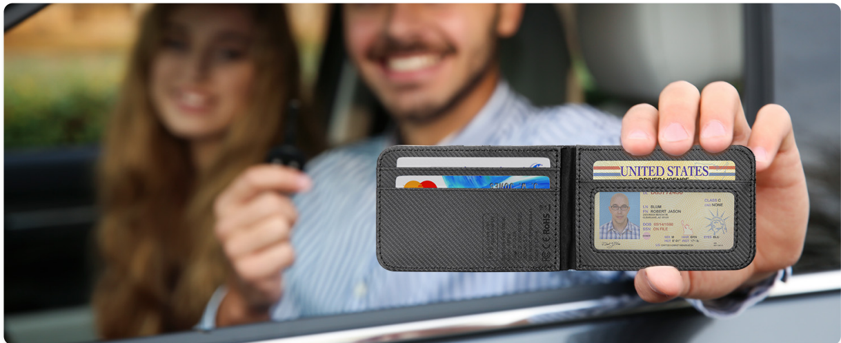
Figure 5: The wallet open, displaying a clear window for an ID card, making it visible without removal.