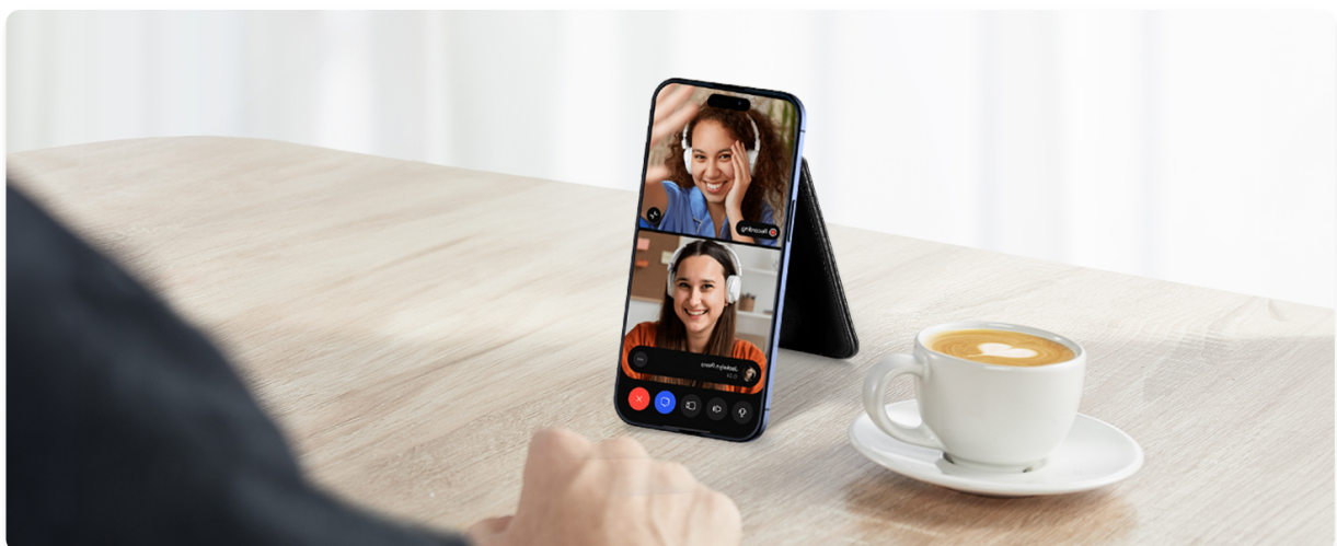
Figure 8: An iPhone positioned vertically using the wallet as a stand, suitable for video calls or browsing.