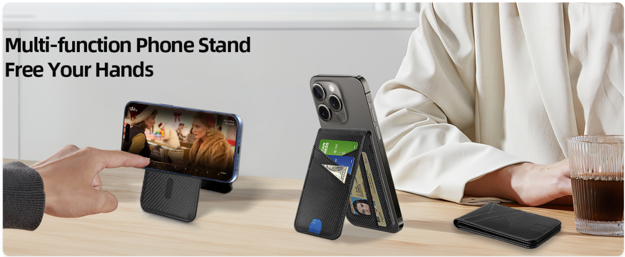
Figure 6: An iPhone propped up by the wallet acting as an adjustable stand, showing a person watching content hands-free.