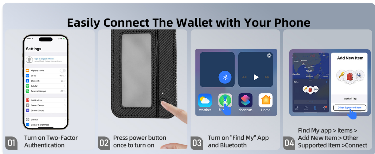
Figure 2: Visual guide for connecting the wallet to the Find My app. The image displays four phone screens illustrating the connection process: enabling two-factor authentication, pressing the wallet's power button, opening the Find My app, and adding the wallet as a new item.