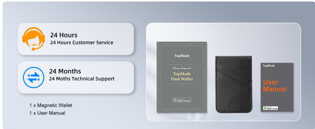
Figure 12: Contents of the product package, including the Magnetic Wallet Stand Tracker and the User Manual.