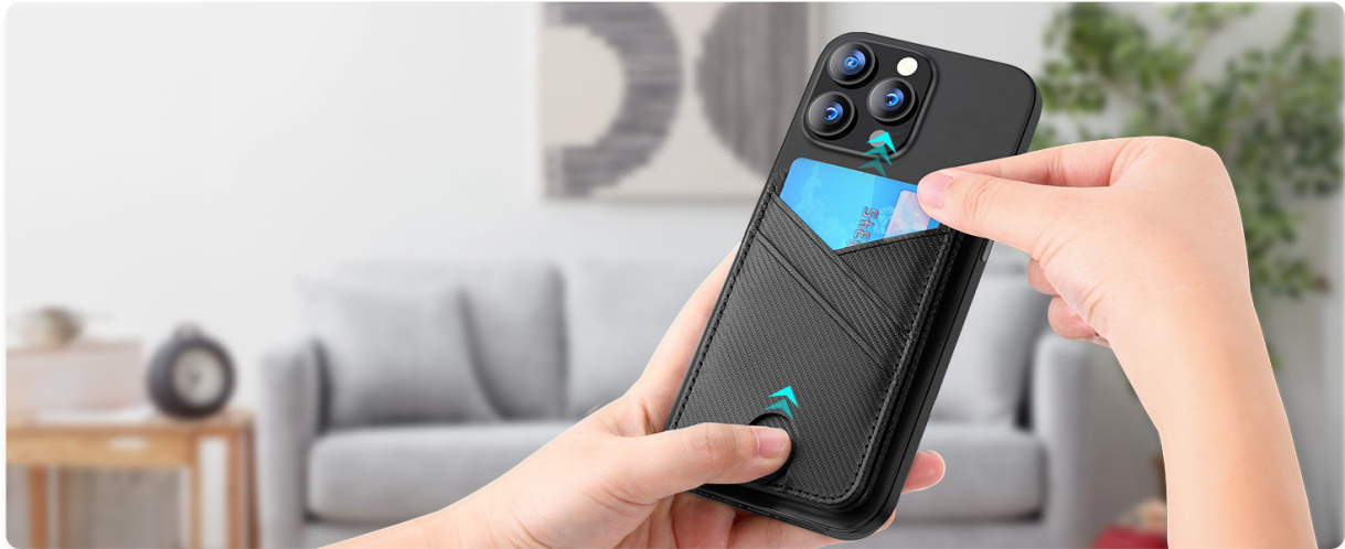
Figure 4: A hand demonstrating how to easily slide cards out of the wallet using the thumb slot.