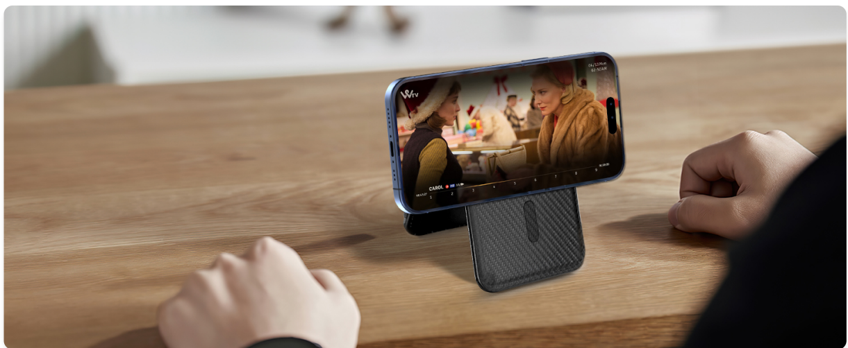
Figure 7: An iPhone positioned horizontally using the wallet as a stand, ideal for watching videos.