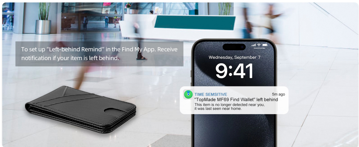
Figure 10: An iPhone displaying a 'Left-Behind' notification, indicating the wallet is no longer detected nearby.