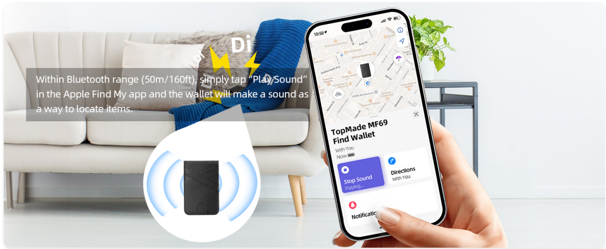
Figure 9: An iPhone screen displaying the 'Play Sound' option within the Find My app, with an illustration of sound waves emanating from the wallet.