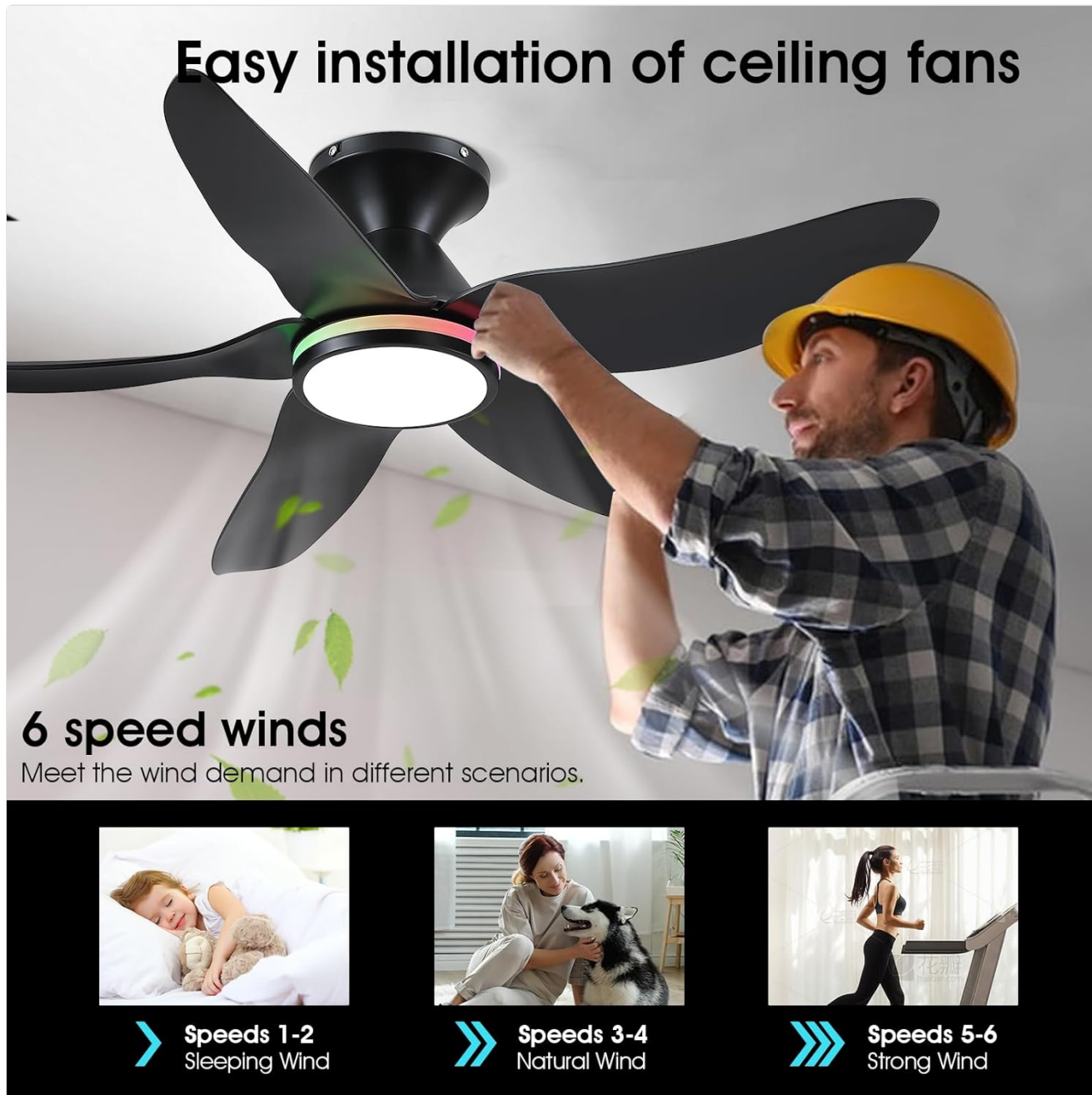
Figure 3: Visual Guide for Easy Installation

Video 1: Detailed Installation Guide for Kviflon 46-inch Ceiling Fans