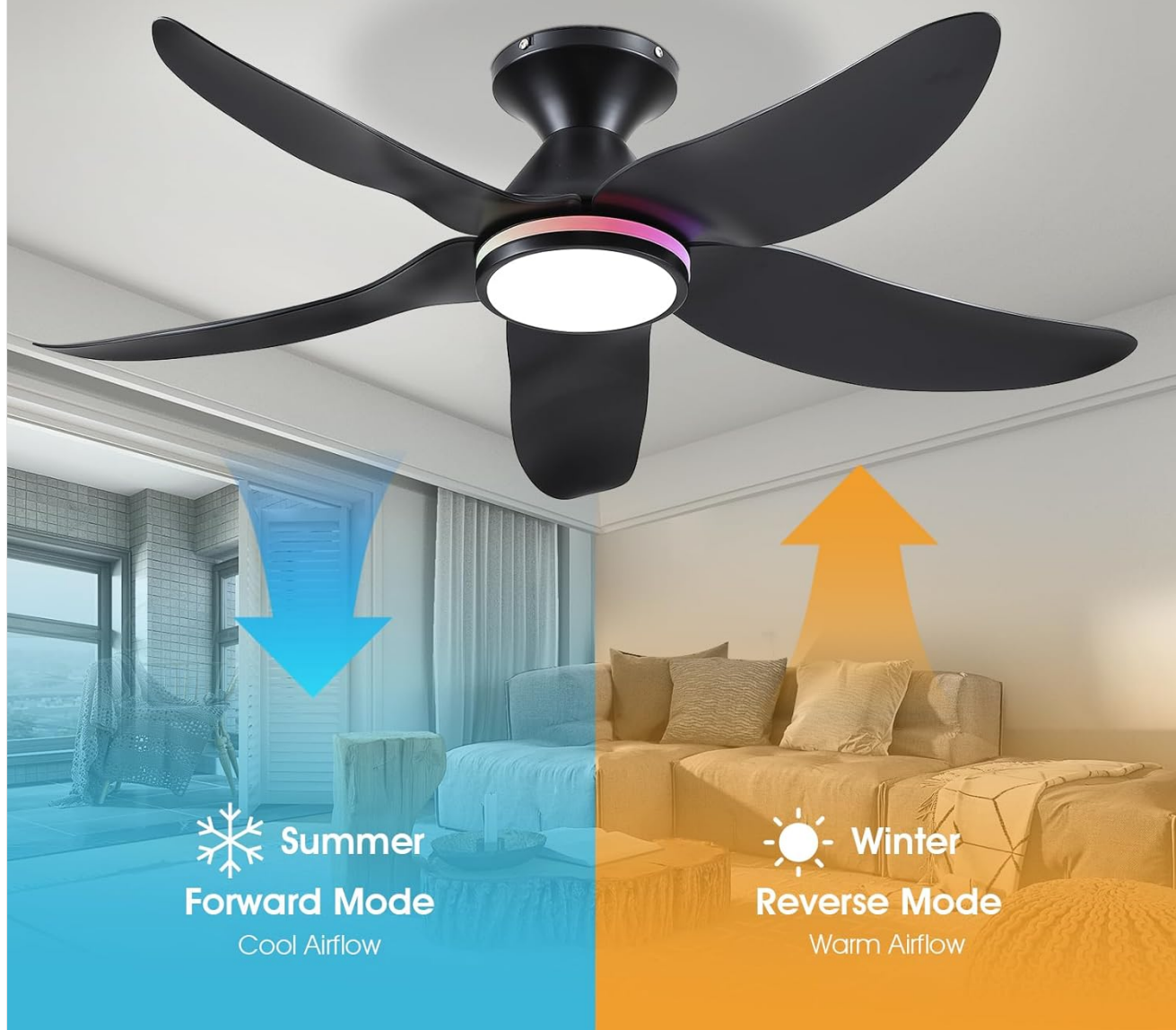
Figure 6: Reversible DC Motor for Summer and Winter Modes

Multi-seasonal applications- not just for summer