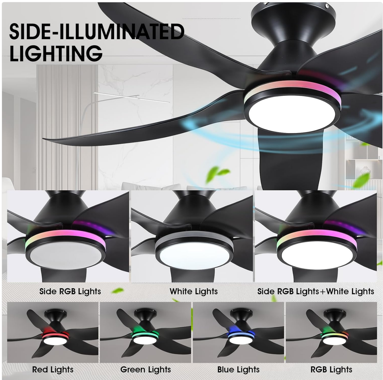
Figure 5: Side-Illuminated RGB Lighting Options