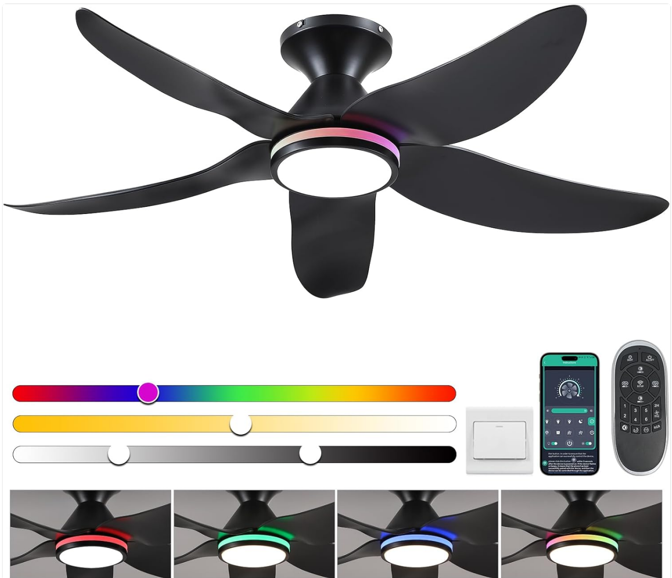
Figure 1: Kviflon 46-inch Ceiling Fan with Lights