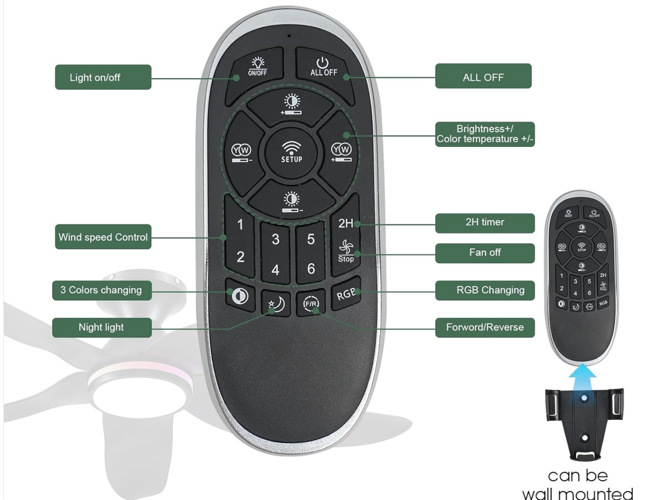
Figure 4: Remote Control Layout and Functions