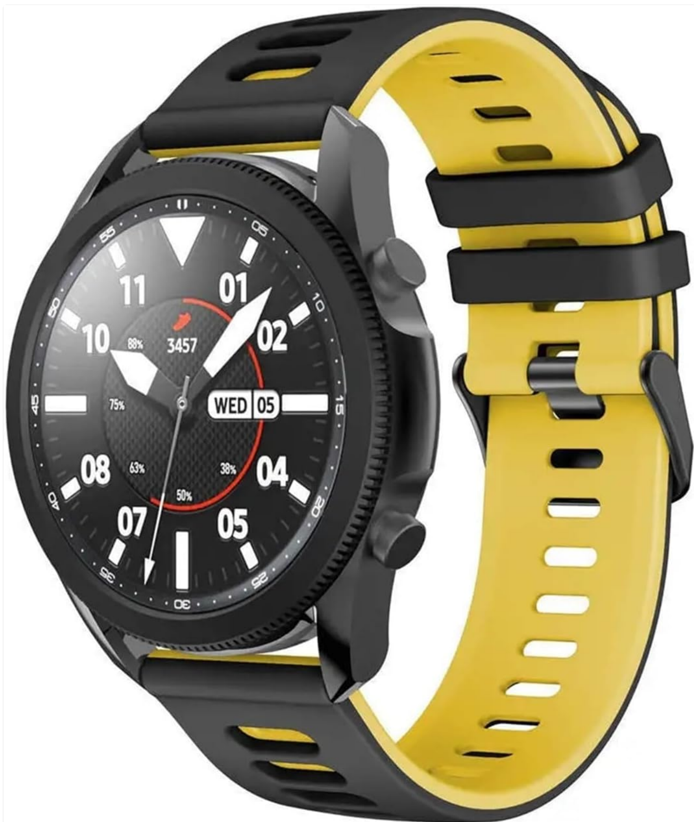
Figure 5.2: Example of the strap correctly installed on a smartwatch (Black Yellow variant).