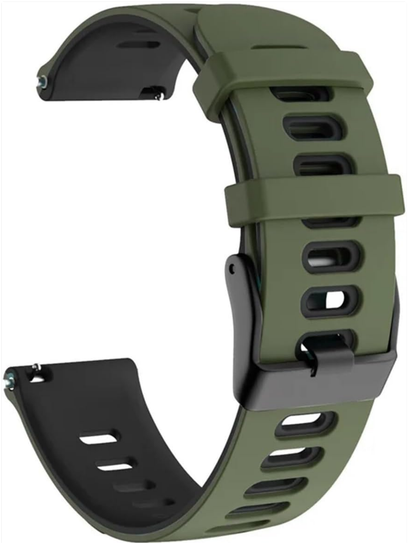
Figure 1.1: GerRit 22mm Silicone Smart Watch Strap (Army Green Black variant).