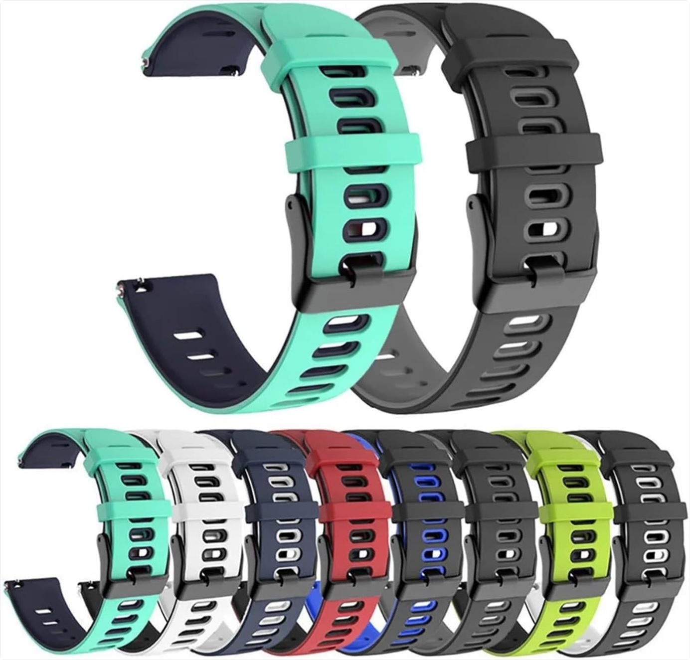
Figure 2.1: The strap is available in multiple color combinations to suit different preferences.