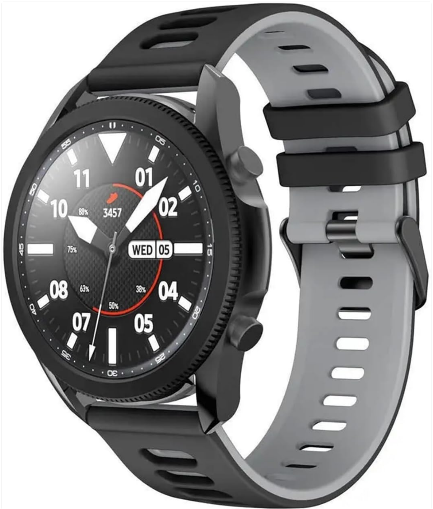
Figure 5.3: Example of the strap correctly installed on a smartwatch (Black Grey variant).