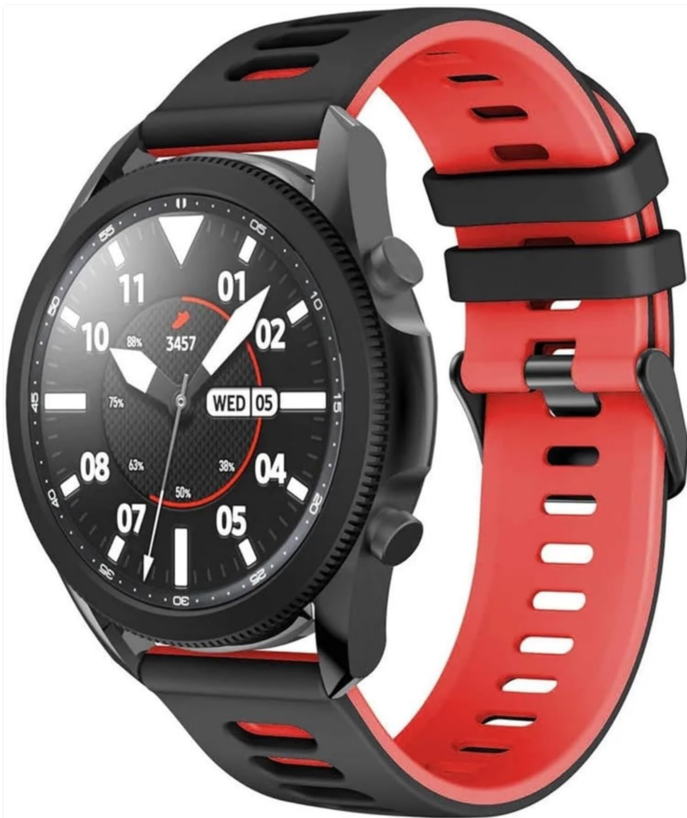
Figure 5.1: Example of the strap correctly installed on a smartwatch (Black Red variant).