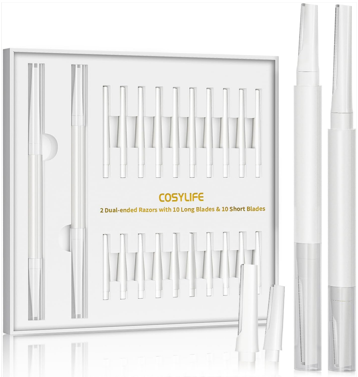
Image: Illustration detailing the two types of blades included: 10 coarse (serrated) blades for eyebrow shaping and 10 fin blades for dermaplaning, showing their distinct designs and uses.