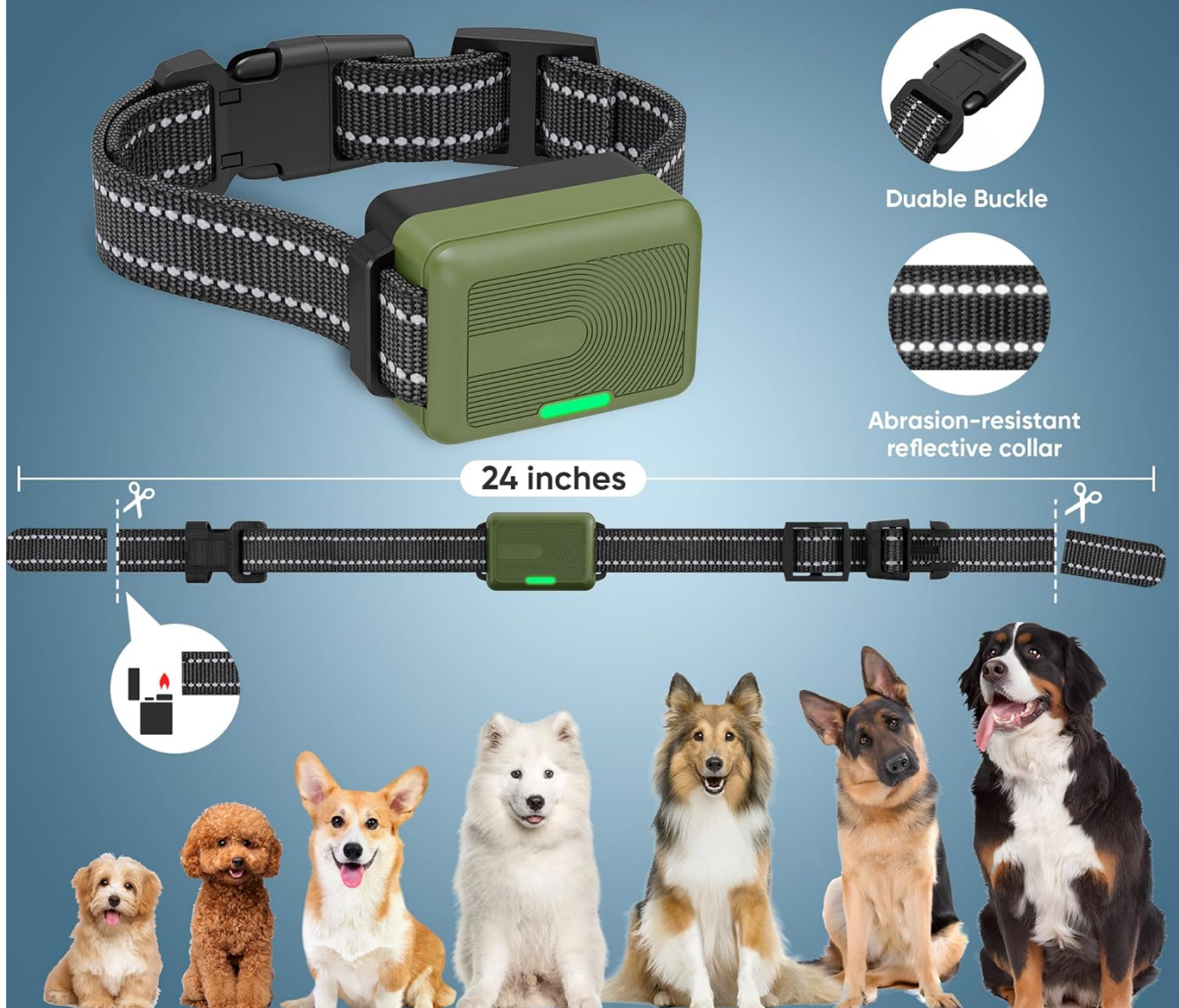
Figure 4: Proper collar fitting and size guide.