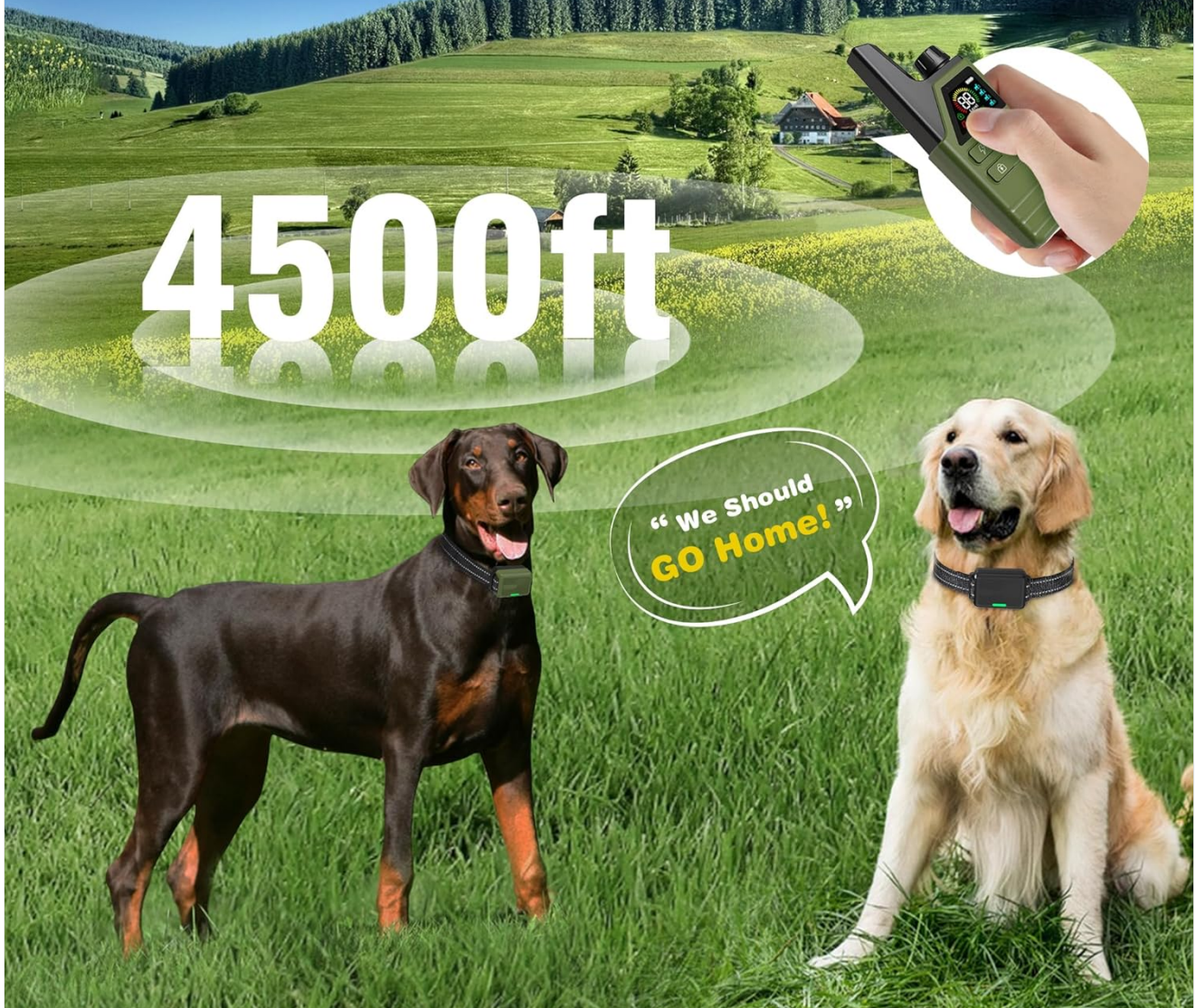
Figure 7: Remote control range demonstration.

More stable and powerful signal, easy to use