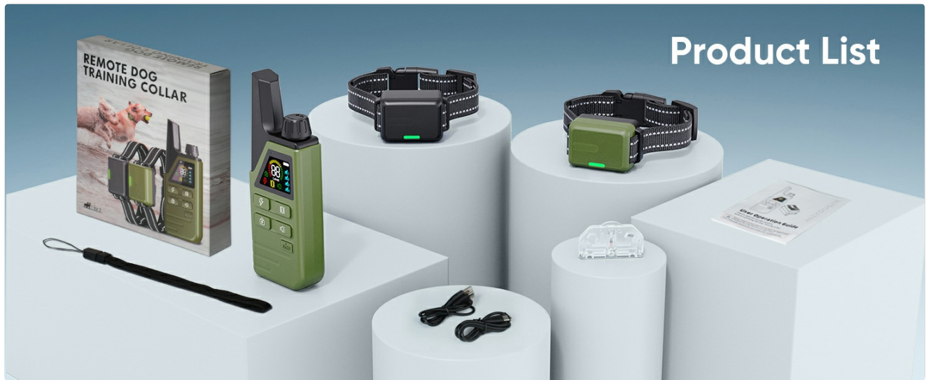
Figure 1: Included components of the Bwrethay Dog Training Collar system.