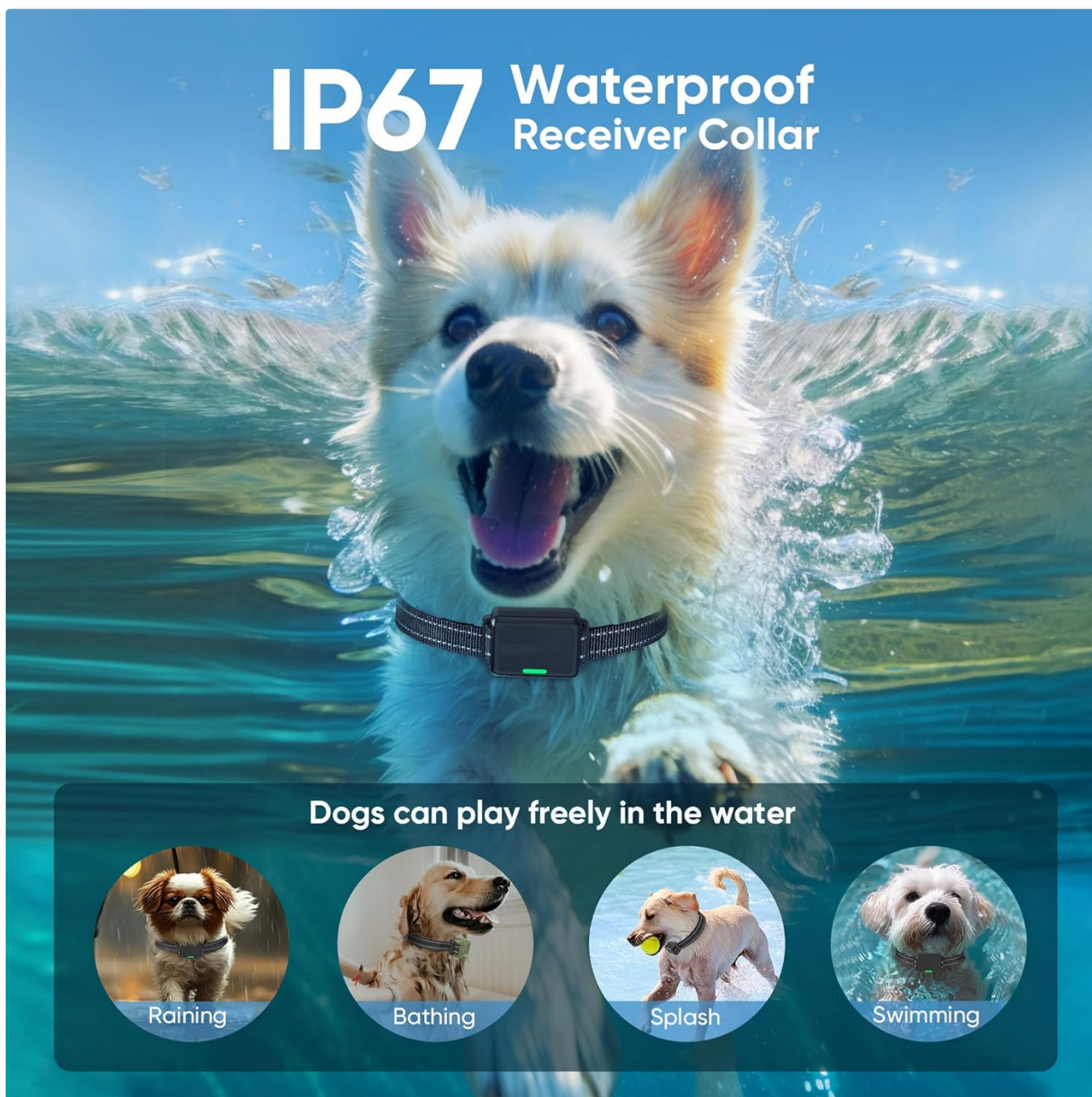
Figure 8: Receiver collar's IP67 waterproof capability.

The receiver collar is IP67 waterproof and dustproof, allowing your dog to wear it during activities like bathing, splashing, and swimming. Ensure the charging port's rubber cap is securely closed when not charging to maintain its waterproof integrity.