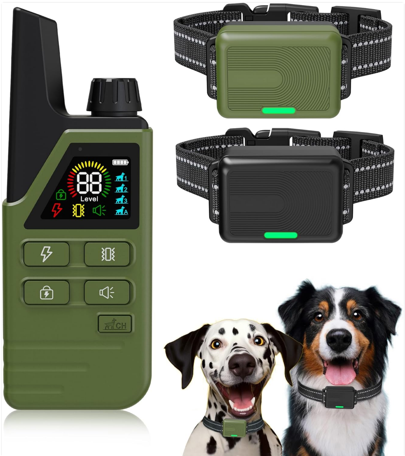
Figure 2: Bwrethay Dog Training Collar Remote and Receiver Collars.