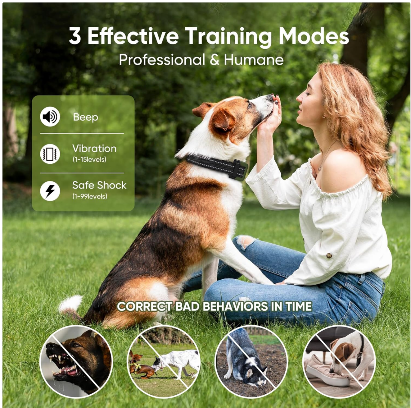
Figure 5: Overview of the three effective training modes.