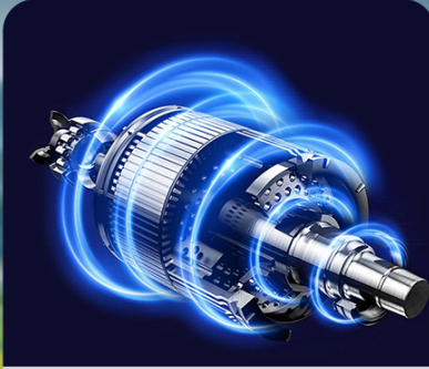
Specialized motors Double Vibration Intensity