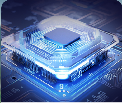
Next-gen intelligent chip Precise control of safety current