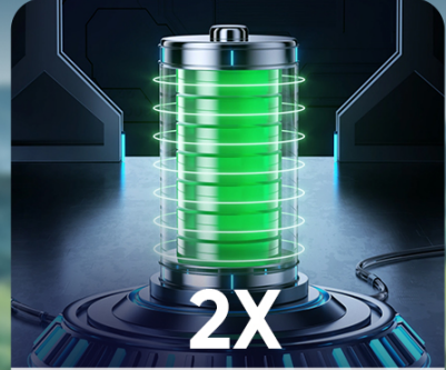
New generation of high-capacity battery