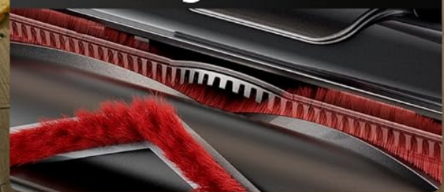
Image: A detailed view of the Proscenic P16's floor brush, highlighting the green light technology that reveals hidden dust and debris on the floor.