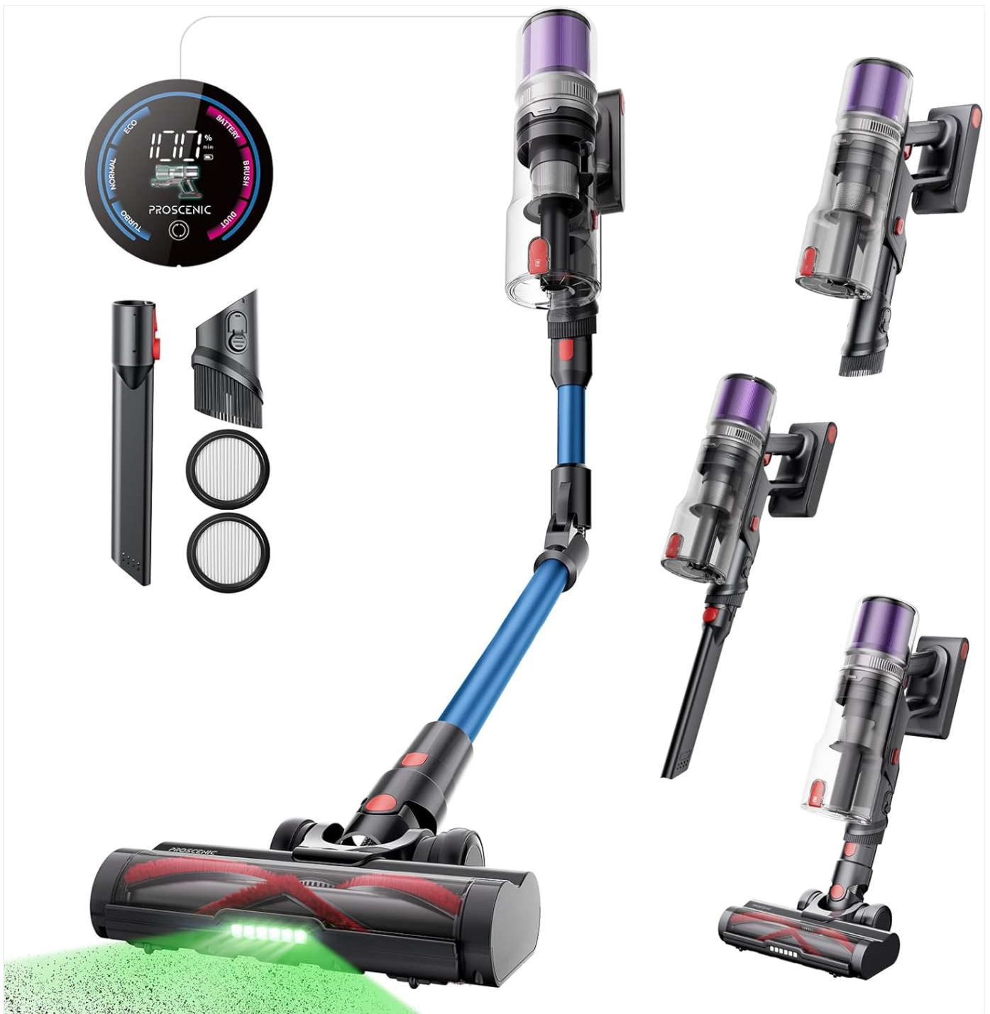
Image: All components included with the Proscenic P16 Cordless Vacuum Cleaner, including the main body, battery, bendable tube, floor brush, power adapter, wall mount, crevice tool, extra HEPA filter, user manual, and cleaning brush.