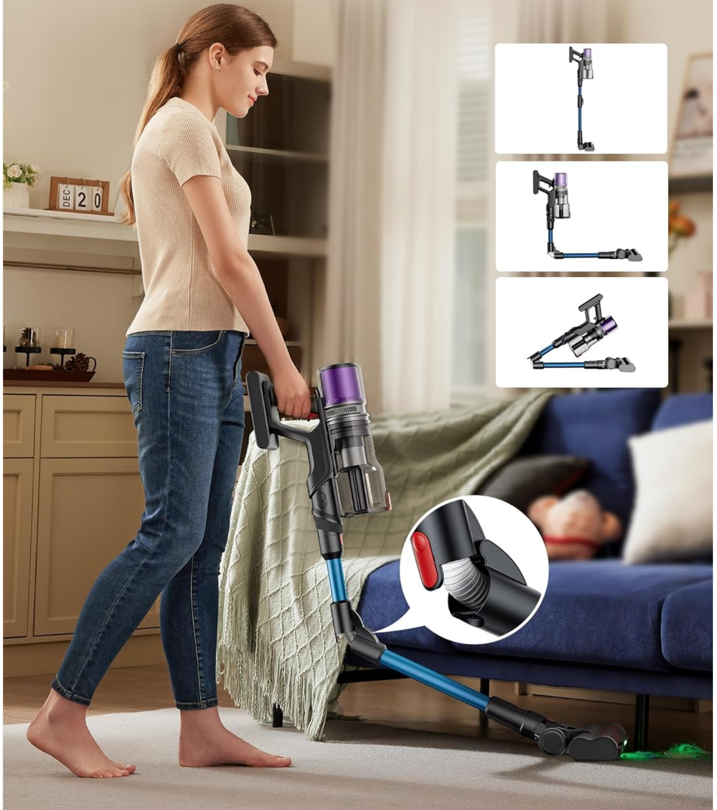
Image: A woman demonstrating the 180° bendable wand feature of the Proscenic P16, allowing for easy cleaning under furniture without bending.

Easy under-furniture Cleaning without Bending