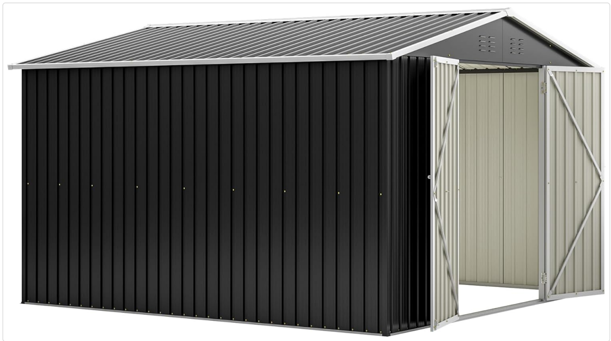
Figure 6: Close-up of shed details, including plastic corner caps, hinge doors, and aluminum frames, ensuring durability and functionality.