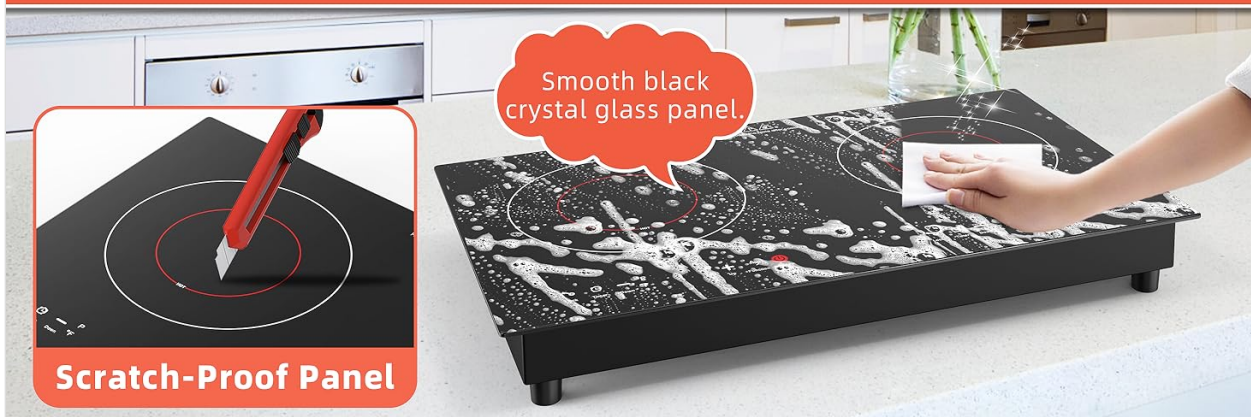
The electric cooktop being cleaned, with an inset showing a knife attempting to scratch the surface, emphasizing its scratch-proof panel and smooth black crystal glass.