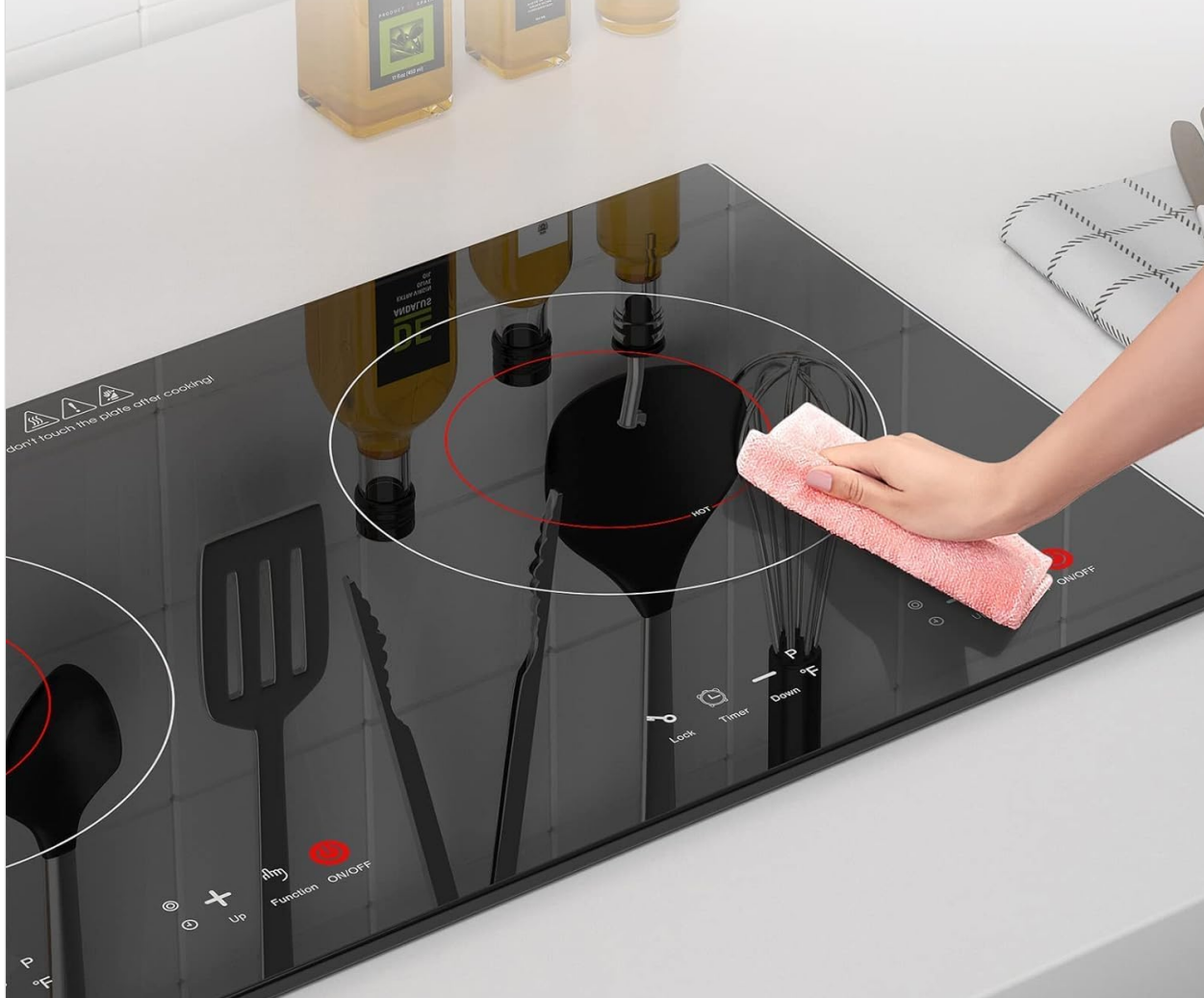
A hand wiping the smooth black ceramic glass surface of the cooktop with a cleaning cloth, demonstrating its ease of cleaning.

High quality glass surface, just wipe it with a cleaning cloth.