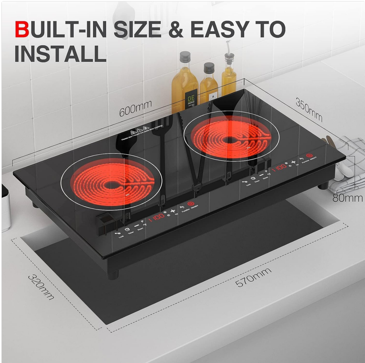
Illustration of the cooktop's dimensions and the required cutout size for built-in installation, showing 600mm length, 350mm width, and 80mm height, with a cutout of 570mm by 320mm.