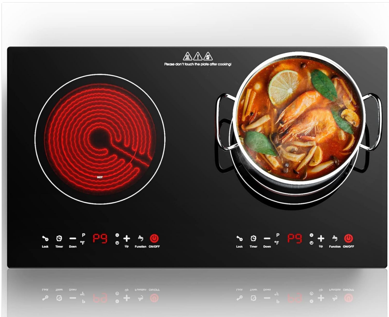
Front view of the GTKZW Electric Stove 2 Burners, showcasing its sleek design and touch controls, with a pot of soup on the right burner.