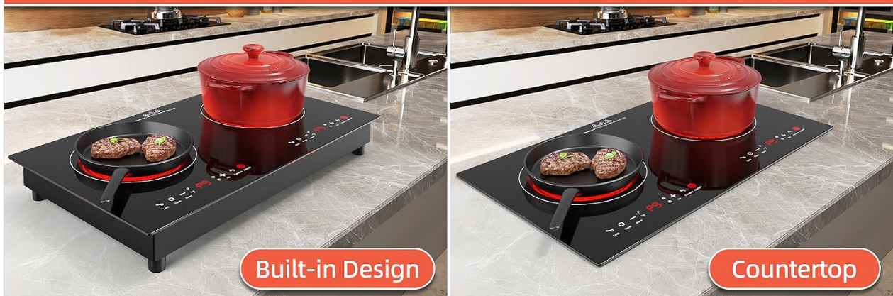
Visual comparison demonstrating the two installation methods: built-in design for seamless integration and countertop use for