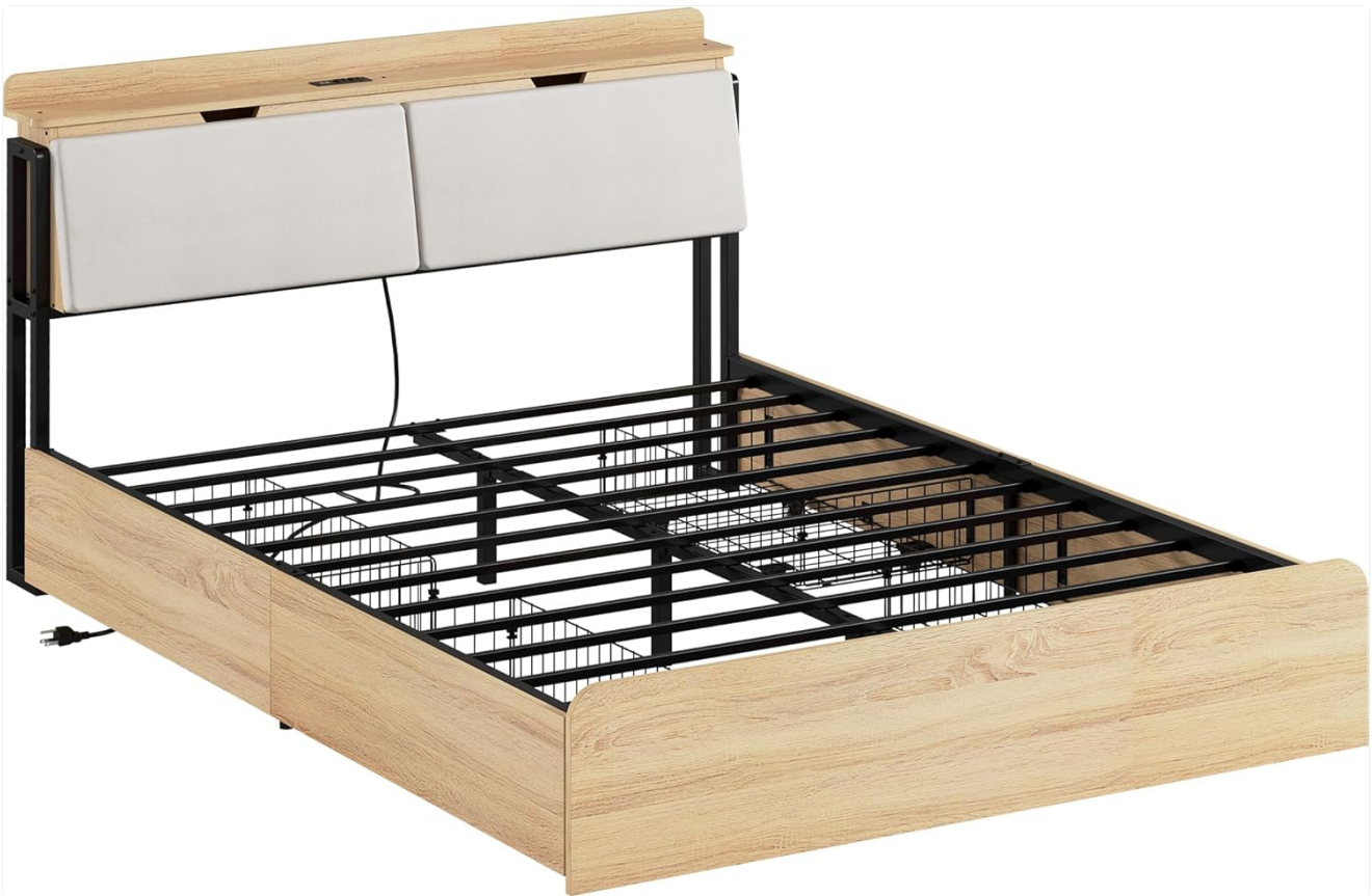
Image: The four under-bed storage drawers, shown pulled out to reveal their capacity and the integrated wheels for mobility.