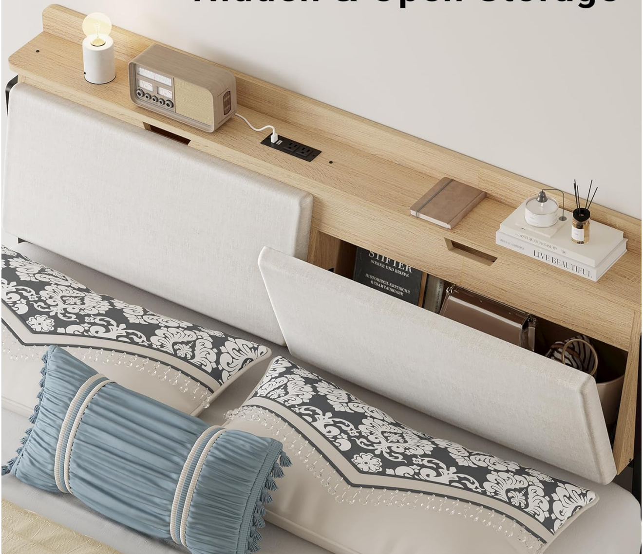
Image: The headboard with both hidden and open storage options visible, demonstrating its dual functionality.