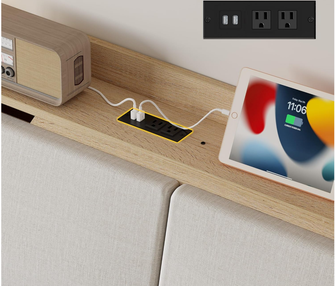
Image: Close-up of the built-in charging station on the headboard, showing USB and Type C ports in use with a tablet and other devices.