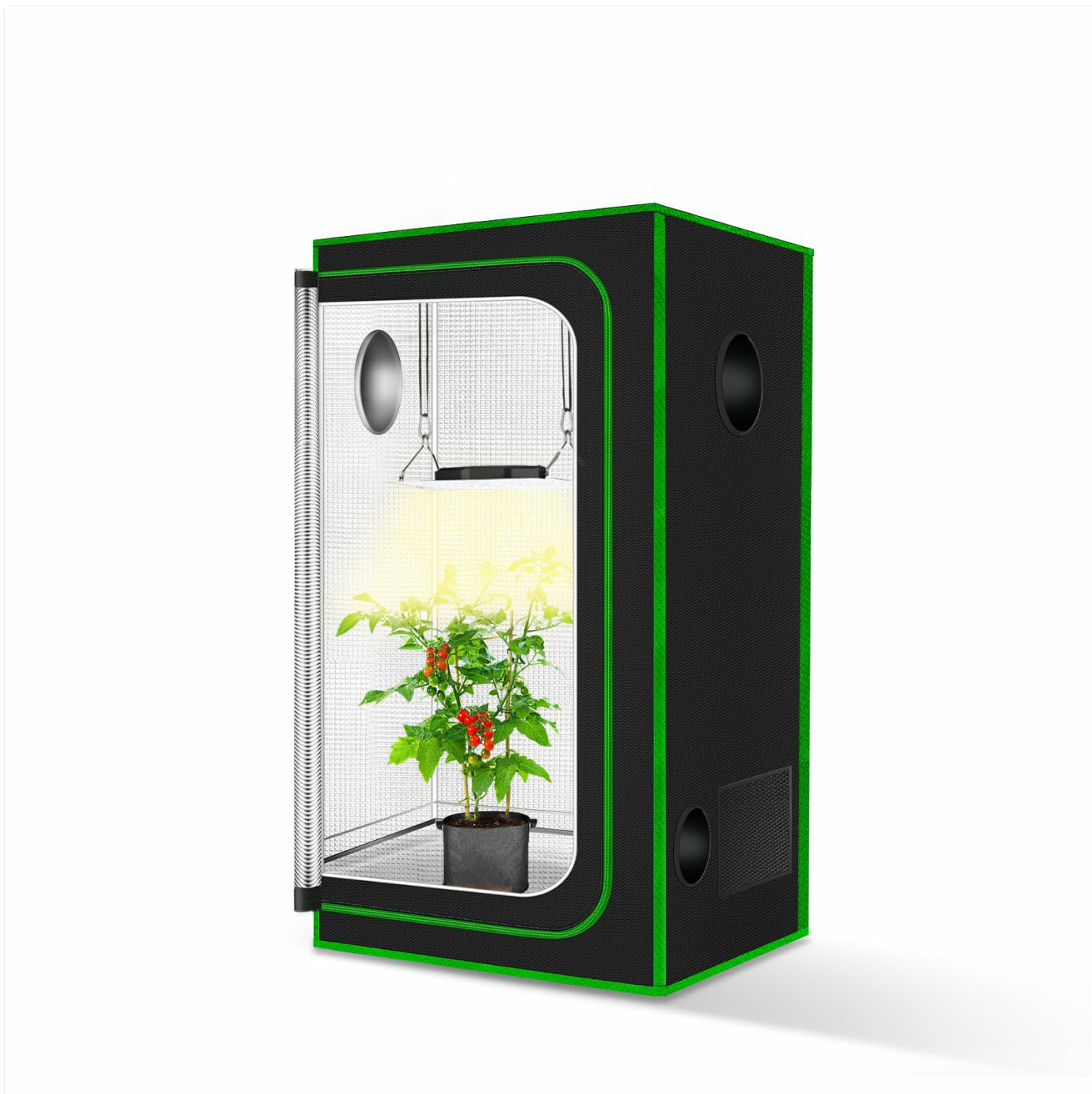
Figure 1: Assembled MELONFARM Small Grow Tent (18"x18"x36").