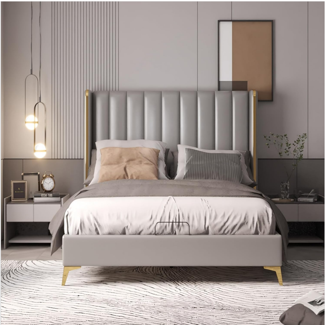
Image: Detailed dimensions of the Queen size bed frame.