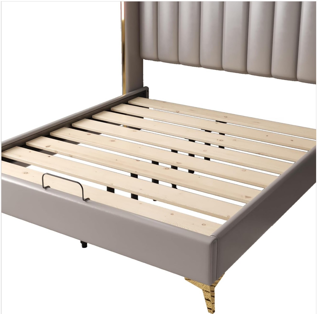
Image: Close-up of the wooden slats laid across the frame with the mattress anti-displacement bar in place.