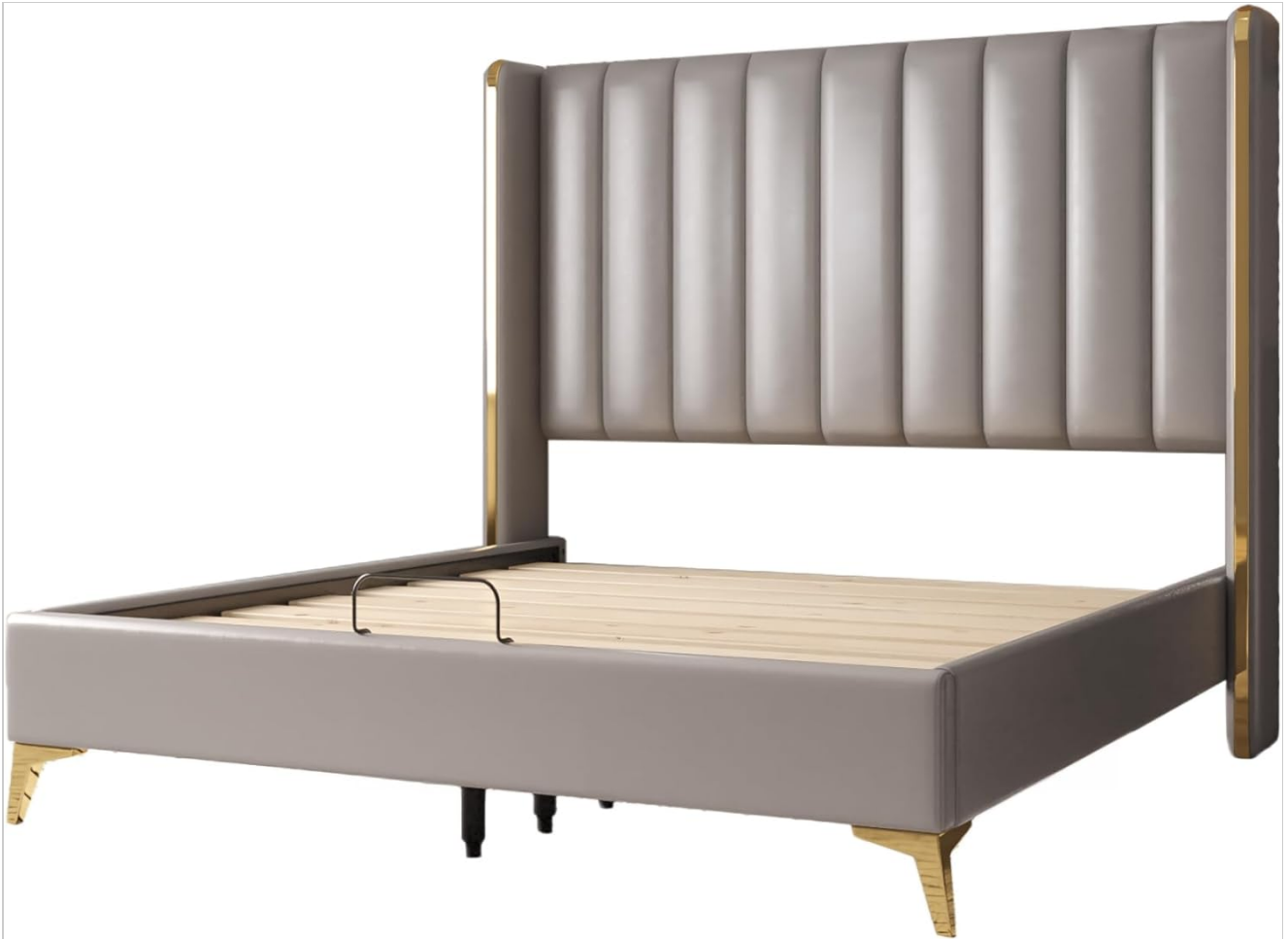
Image: Bed frame structure showing headboard, footboard, and side rails connected.

Connect the side rails (B) to the headboard (A) and footboard (C) using the provided bolts and washers from the hardware pack (H). Do not fully tighten bolts until all parts are aligned.