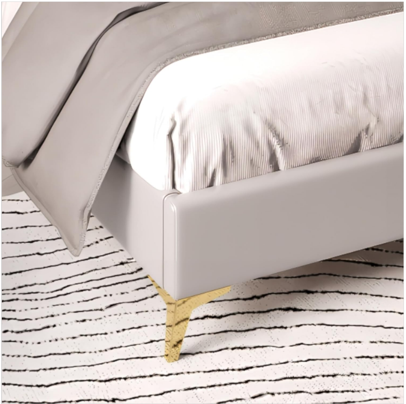
Image: Detail of one of the golden metal legs attached to the bed frame.