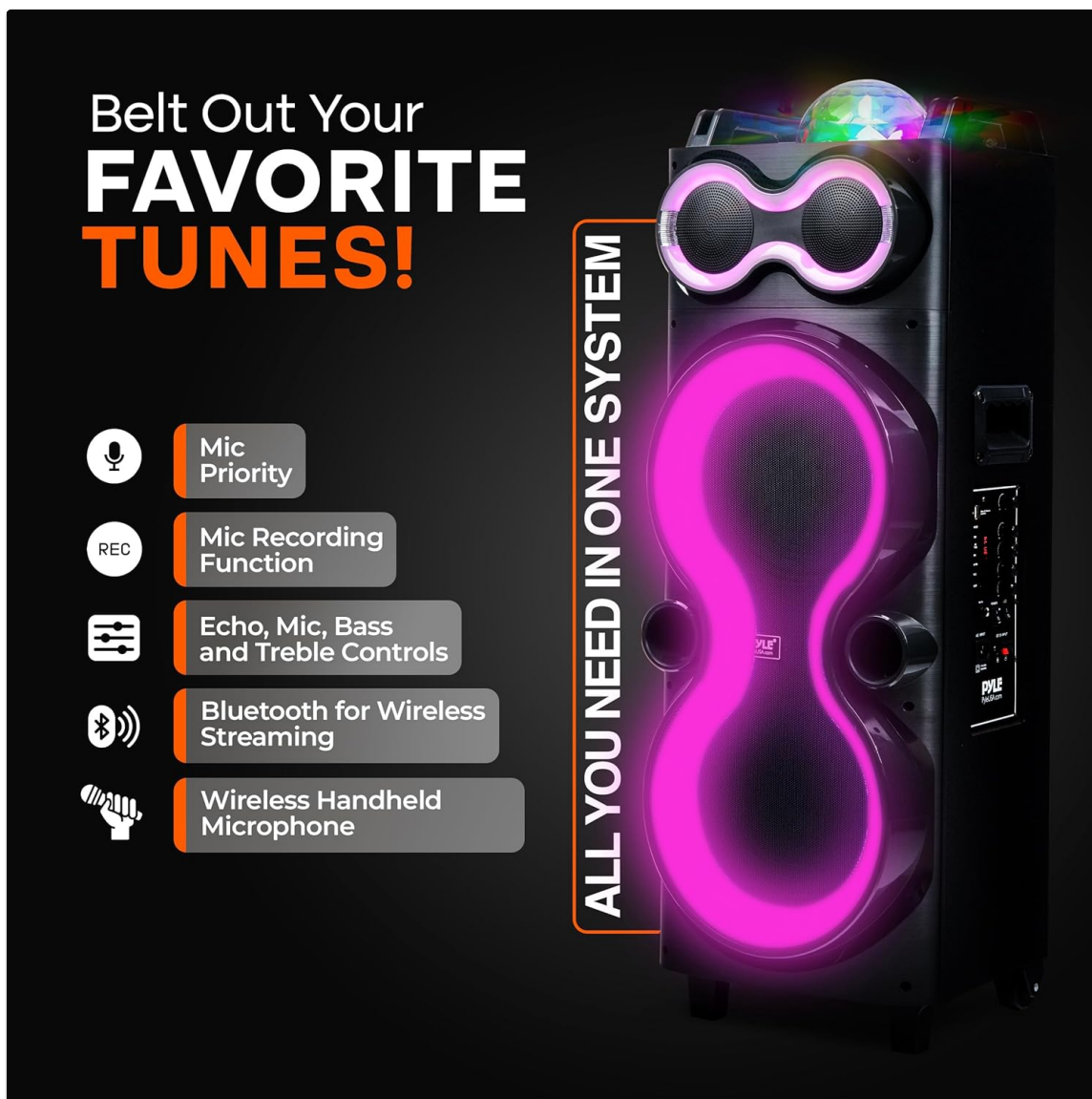
Figure 2: Side panel controls and inputs. This image highlights the various knobs, buttons, and ports available on the speaker's control panel, including volume, EQ, and input jacks.

Familiarize yourself with the main components and control panel of your Pyle PPHP1028 speaker system.