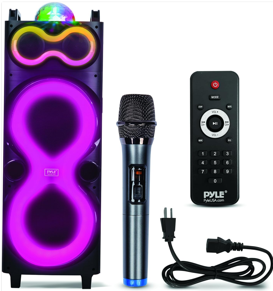
Figure 1: Included components of the Pyle PPHP1028 system. This image displays the main speaker unit, a wireless microphone, a power cord, and a remote control, illustrating the complete package.