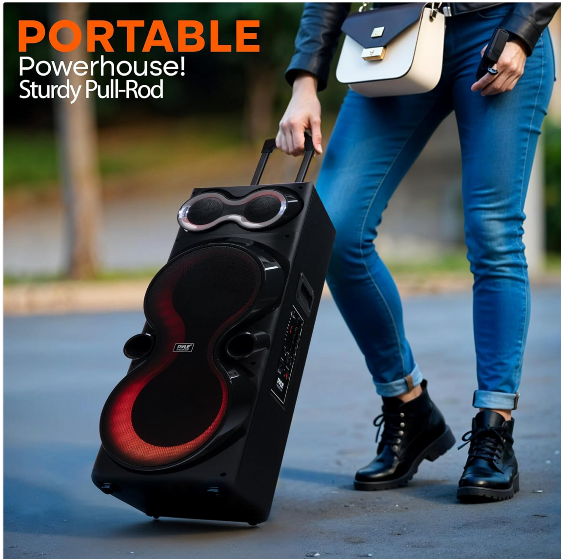
Figure 4: Portability feature. This image shows a person easily transporting the speaker using its extendable handle and integrated wheels.

For optimal sound distribution, place the speaker on a stable, flat surface. Ensure there are no obstructions directly in front of the speaker grilles. The integrated wheels and extendable handle facilitate easy transport.