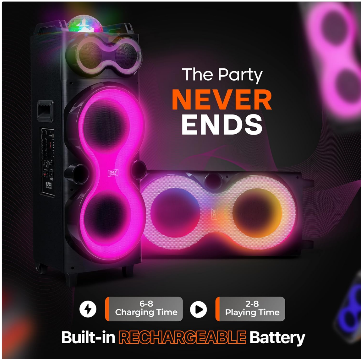
Figure 3: Battery charging and usage information. This graphic illustrates the typical charging time (6-8 hours) and playing time (2-8 hours) for the built-in rechargeable battery.

Before initial use, fully charge the speaker's built-in rechargeable battery. Connect the provided power cord to the speaker's power input and then to a standard wall outlet. The charging indicator will illuminate. A full charge typically takes 6-8 hours and provides up to 8 hours of usage.