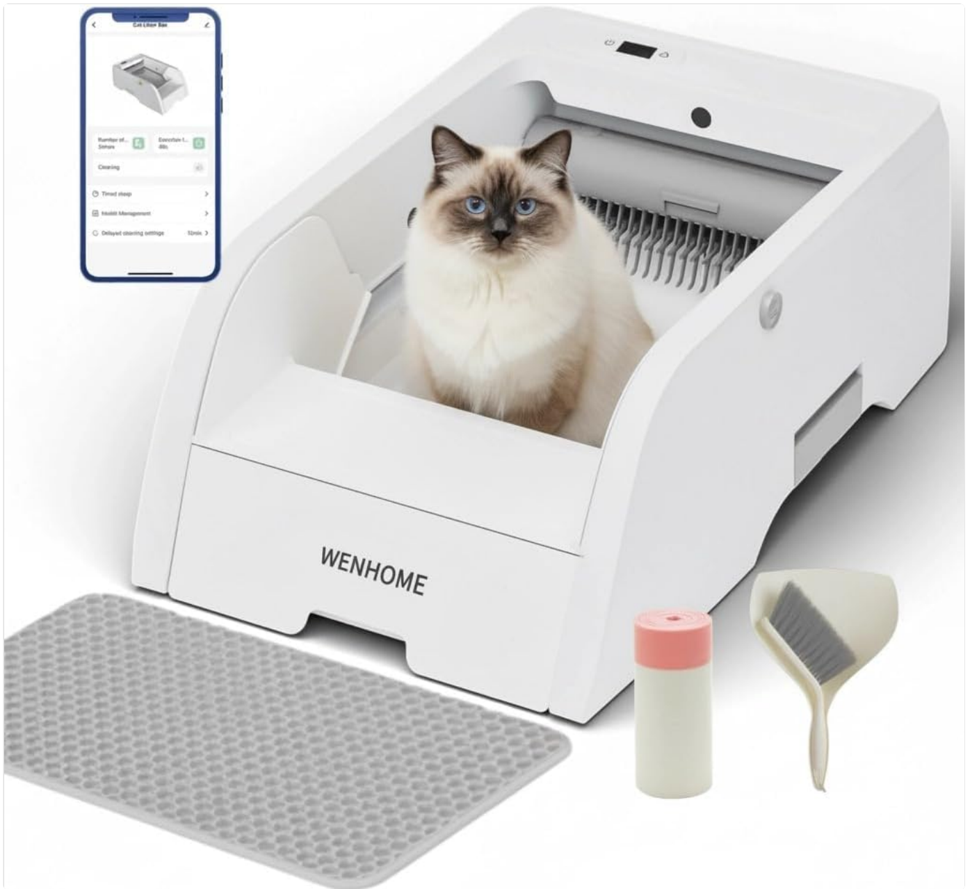
Figure 2.1: WENHOME LB2003 Automatic Self-Cleaning Cat Litter Box with accessories. The image displays the main unit, a cat inside, a litter mat, a small brush, and a roll of trash bags.