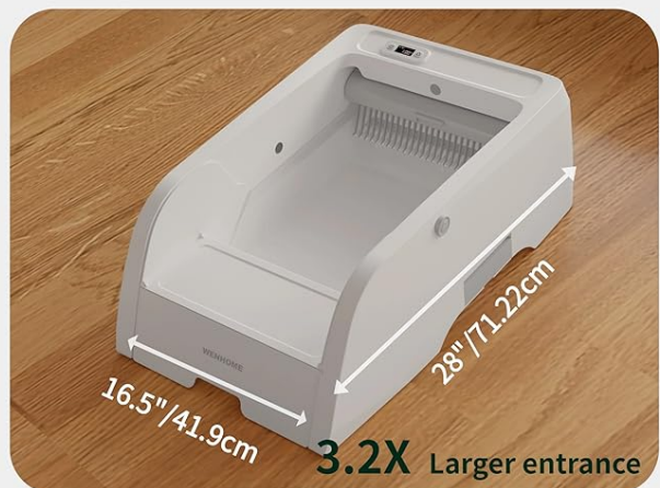
Figure 2.2: Wide-Opening Self-Cleaning Cat Litter Box. This image highlights the 16.5-inch opening, suitable for cats over 2.2 pounds, and its traditional litter box appearance for quick pet adaptation.