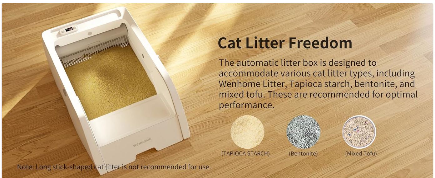
Figure 2.4: Cat Litter Freedom. This image displays the recommended litter types: Tapioca Starch, Bentonite, and Mixed Tofu, noting that long stick-shaped litter is not recommended.