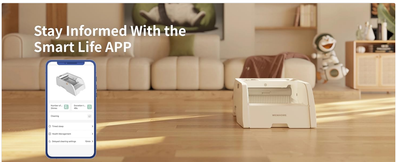
Figure 5.2: Stay Informed With the Smart Life APP. This image shows the mobile application interface, demonstrating features like cleaning