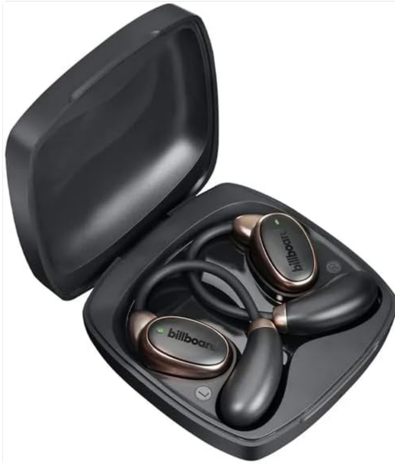
Image: The Billboard Cooper OWS headphones placed inside their open charging case, ready for charging.

The headphones provide up to 8 hours of continuous playback on a single charge, and the charging case provides an additional 4 full charges, totaling up to 40 hours of battery life.