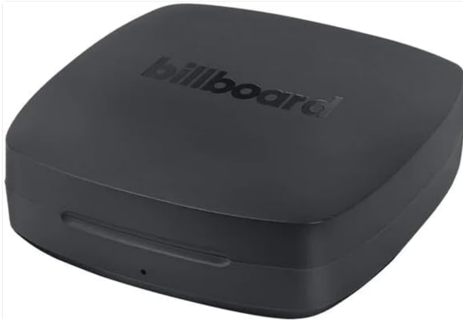
Image: The compact, black charging case for the Billboard Cooper OWS headphones.