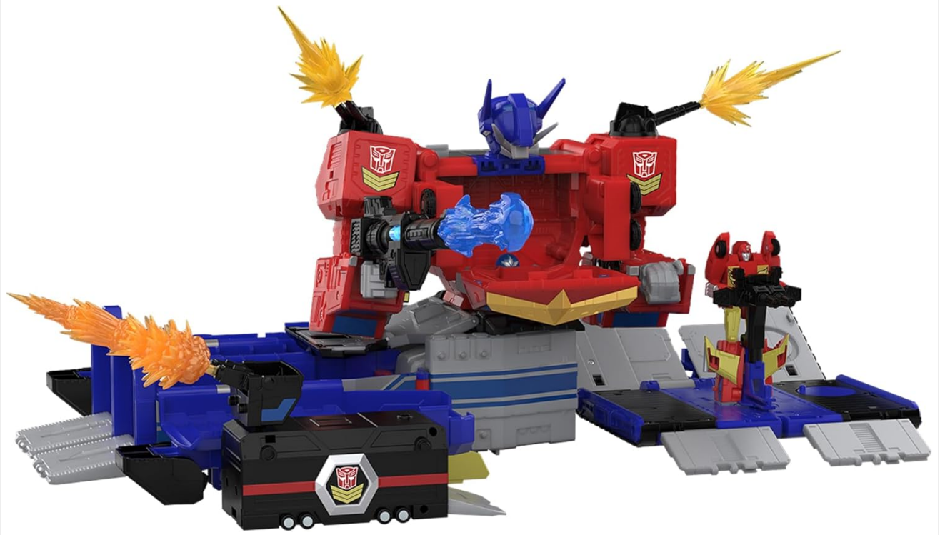
Image: Star Optimus Prime in battle station mode, featuring multiple weapon ports and a platform for Micromaster figures.