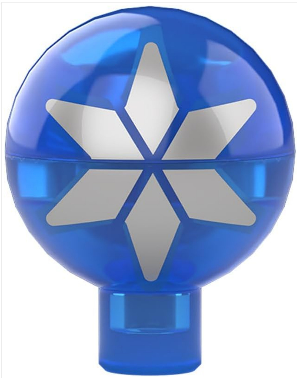
Image: The blue translucent Zodiac Orb accessory with a star pattern.