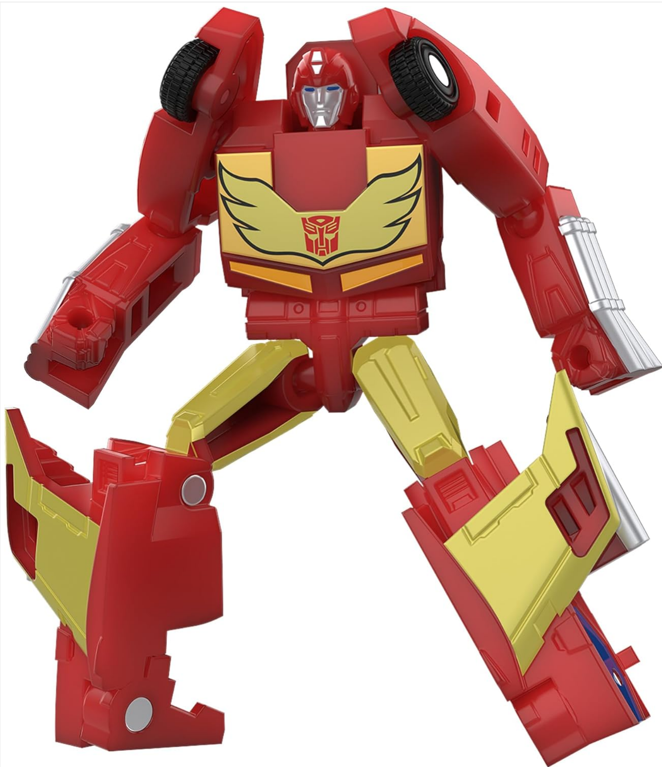
Image: Micromaster Autobot Hot Rod in its robot form.