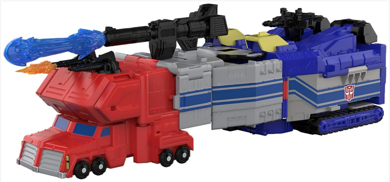
Image: Star Optimus Prime in truck mode, connected to its MT-13 Microtrailer.