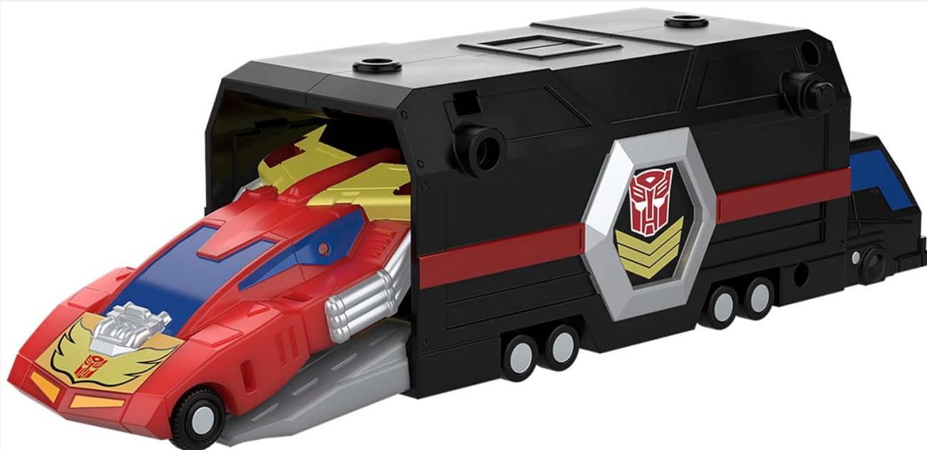
Image: Micromaster Hot Rod in vehicle mode, stored within the MT-13 Microtrailer.