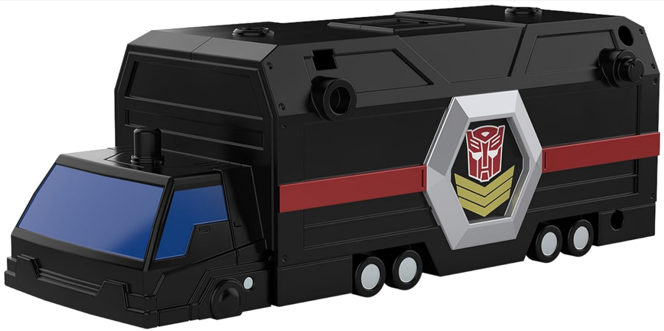
Image: The MT-13 Microtrailer in its standalone vehicle configuration.