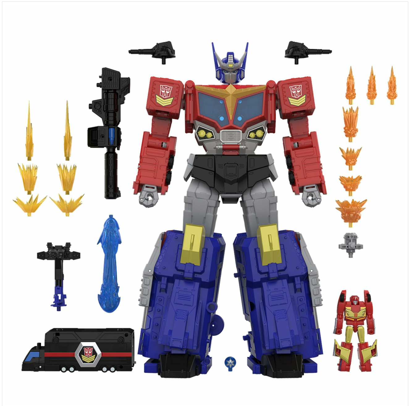
Image: Star Optimus Prime in its imposing robot mode, holding a fiery blast effect accessory.

This is the primary mode of the figure, featuring articulated head, arms, and legs for various action poses. The figure stands at 15 inches tall.