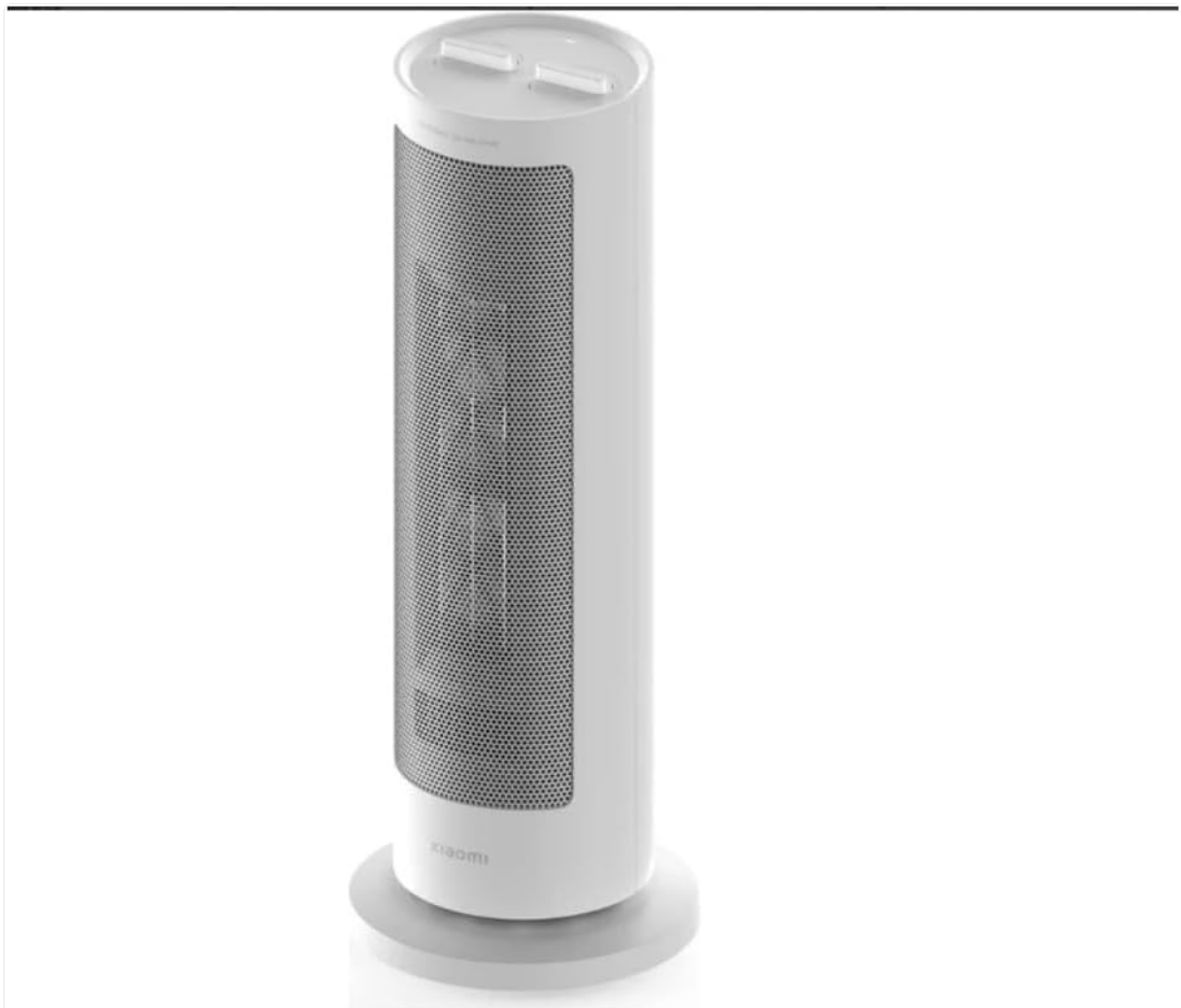
Figure 1: Front view of the Xiaomi Smart Tower Fan Heater EU. This image displays the sleek, white cylindrical design with a perforated grille covering the heating element and air outlet, and control buttons located on the top surface.