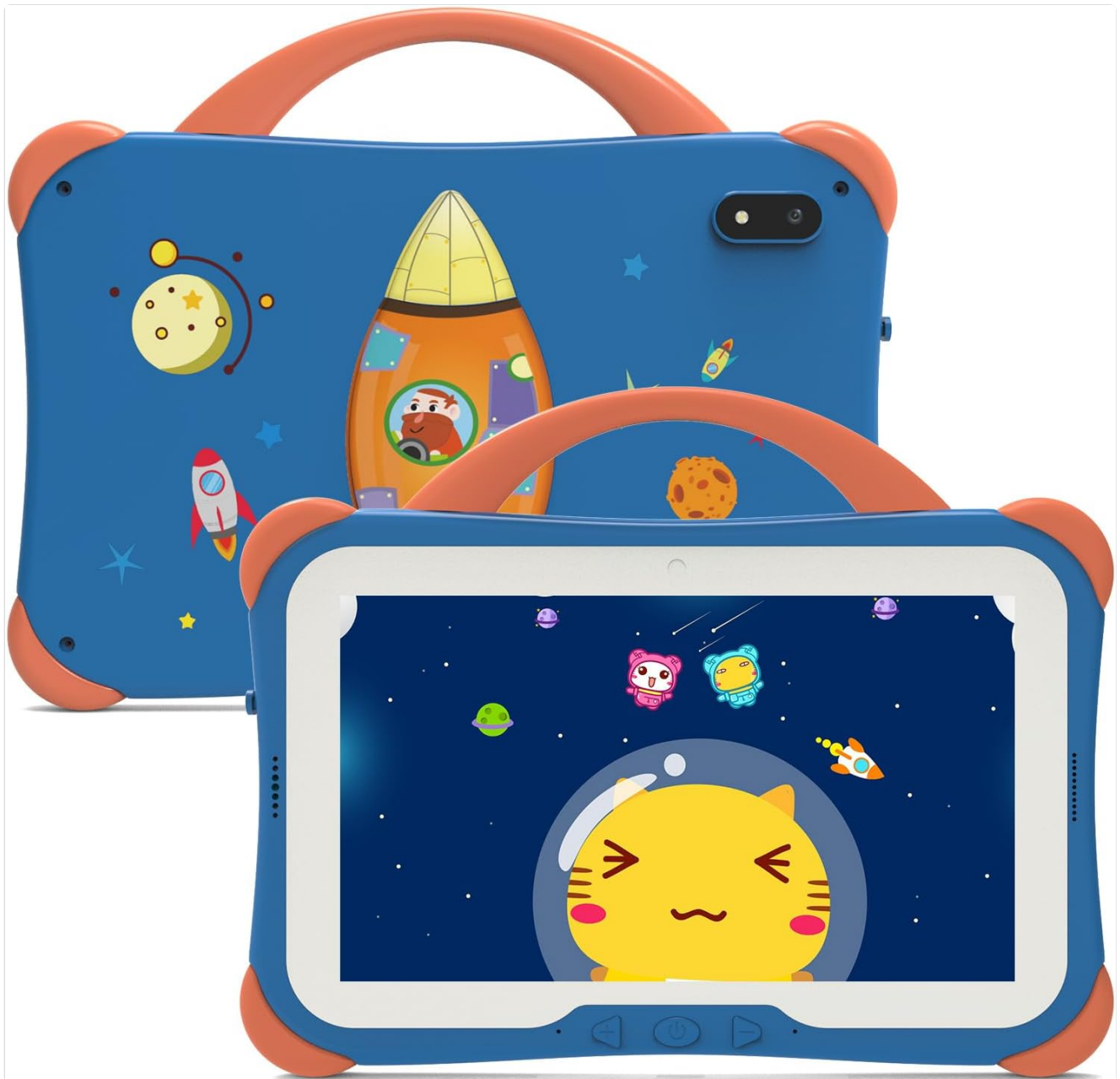
Image: Front and back view of the weelikeit Kids Tablet in blue, showcasing its protective case and vibrant display.