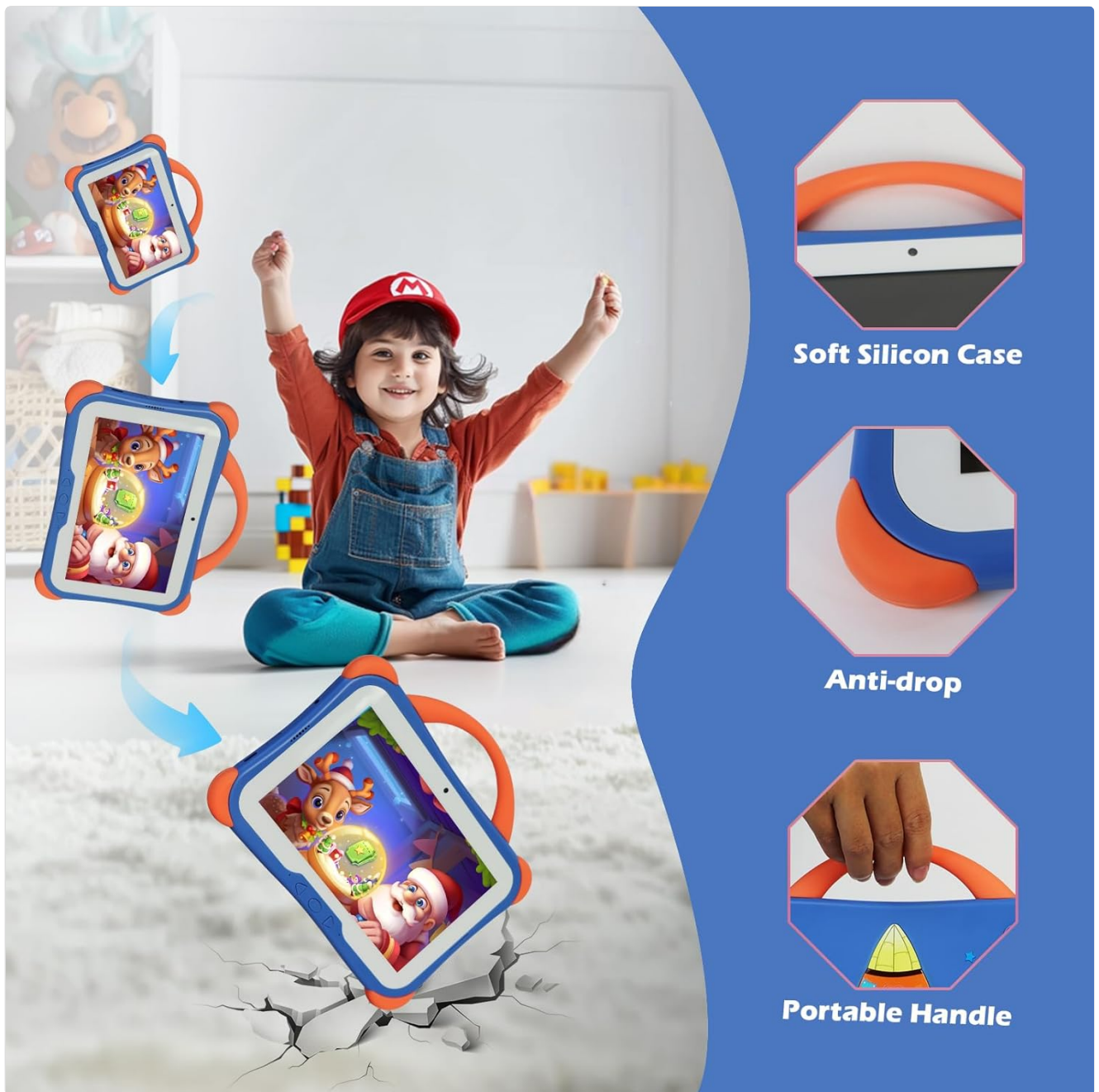
Image: Features of the tablet's protective case, including its soft silicone material, anti-drop design, and portable handle.