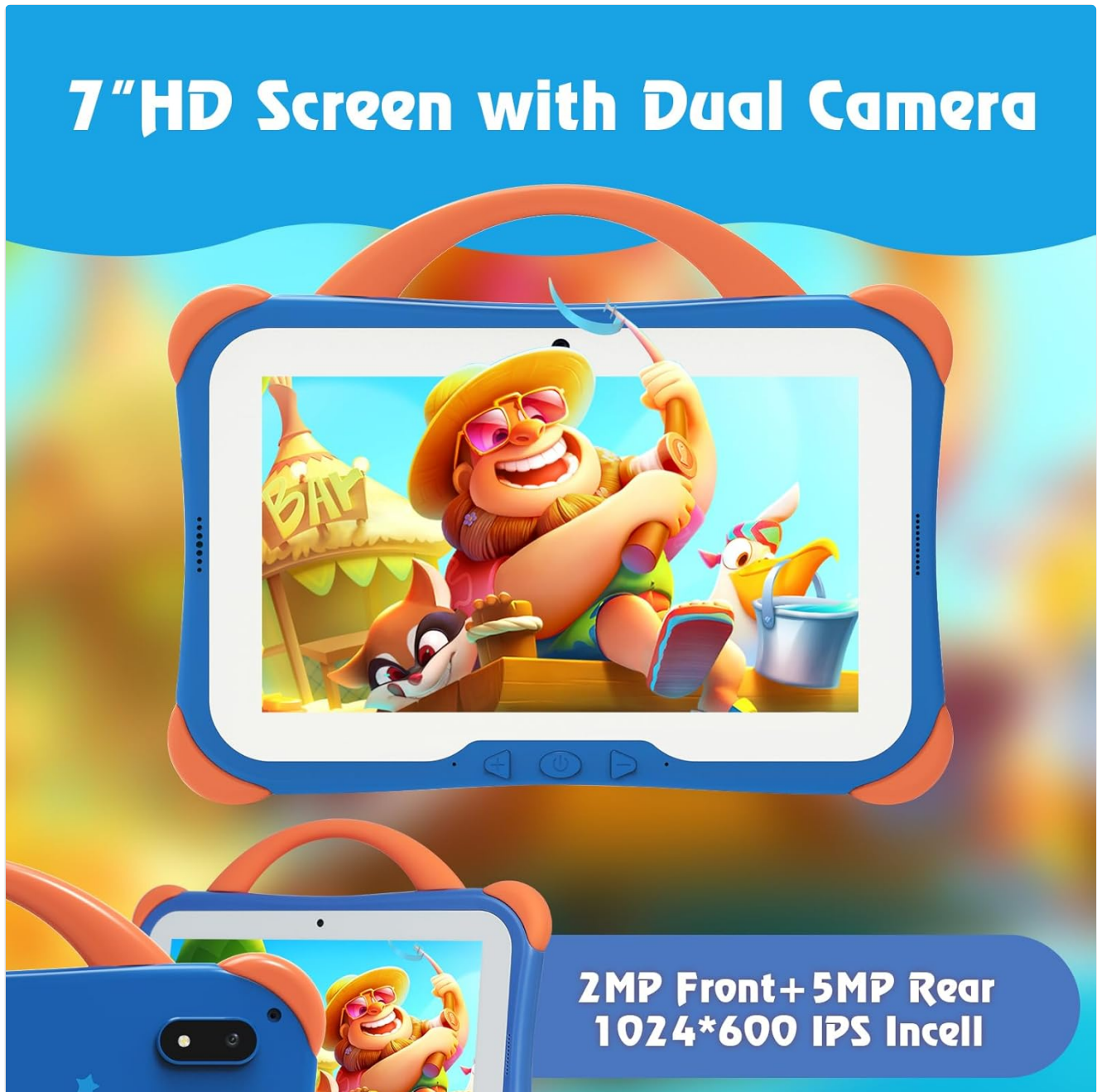
Image: The tablet's 7-inch HD screen and dual camera setup are highlighted.

The weelikeit 7-inch kids' tablet features a high-quality 1024 x 600 IPS HD screen, offering wide viewing angles and vibrant colors for an enjoyable visual experience. To promote eye health, it is recommended to remind children to maintain a proper viewing distance and take regular breaks during use.