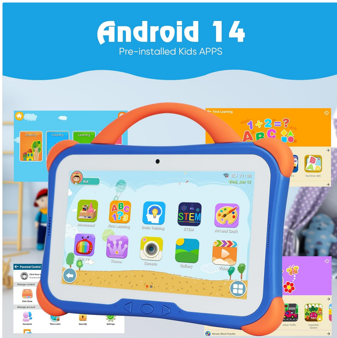
Image: The tablet screen showing the Android 14 interface with a selection of pre-installed educational apps for children.

The dedicated Kids' System comes pre-installed with various educational applications designed to help children develop skills and spark their imagination. This dual system allows for a seamless transition between a standard Android environment and a child-friendly interface.