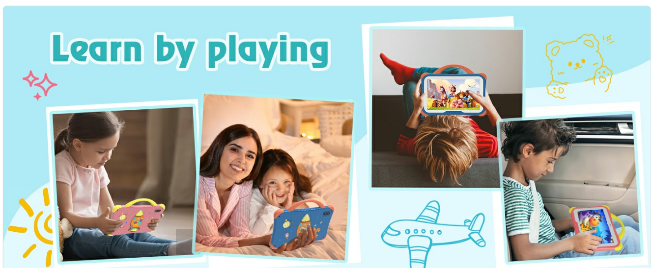
Image: Various scenarios depicting children learning and playing with the tablet, highlighting its versatility.