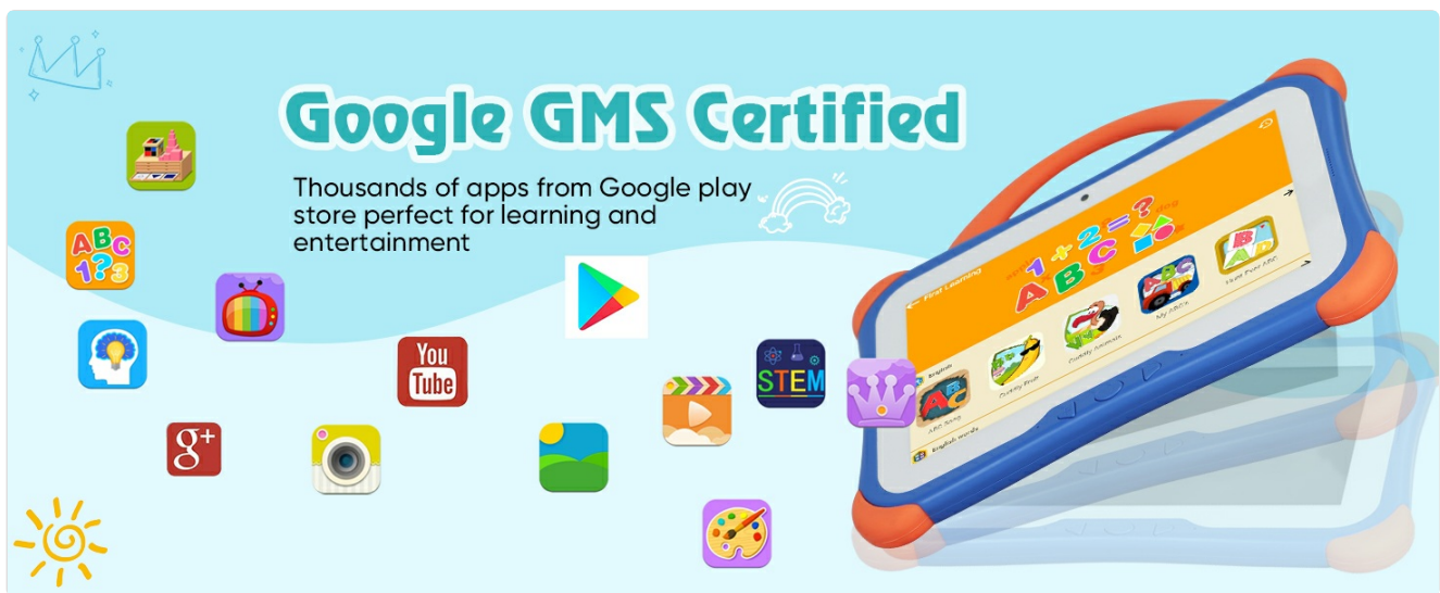
Image: Displaying Google GMS Certification, ensuring access to a wide range of apps from the Google Play Store for learning and entertainment.