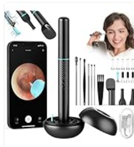
Image 3.1: The device is designed for precise and gentle use, suitable for sensitive ears.