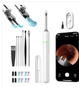
Image 5.2: The otoscope's versatility for various home examinations.

The device supports capturing photos and videos, which can be useful for sharing health information with medical professionals.