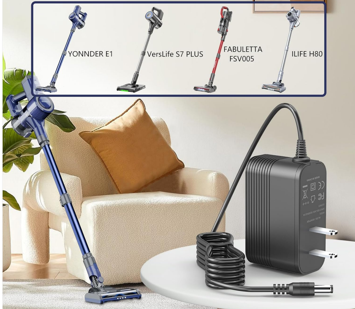
Figure 2.2: Verify voltage specifications on your vacuum and charger before use.