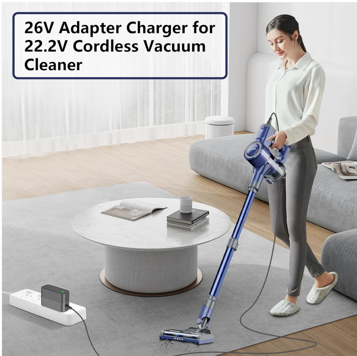
Figure 2.1: Compatible vacuum cleaner models with the VOJSALDR 26V charger.