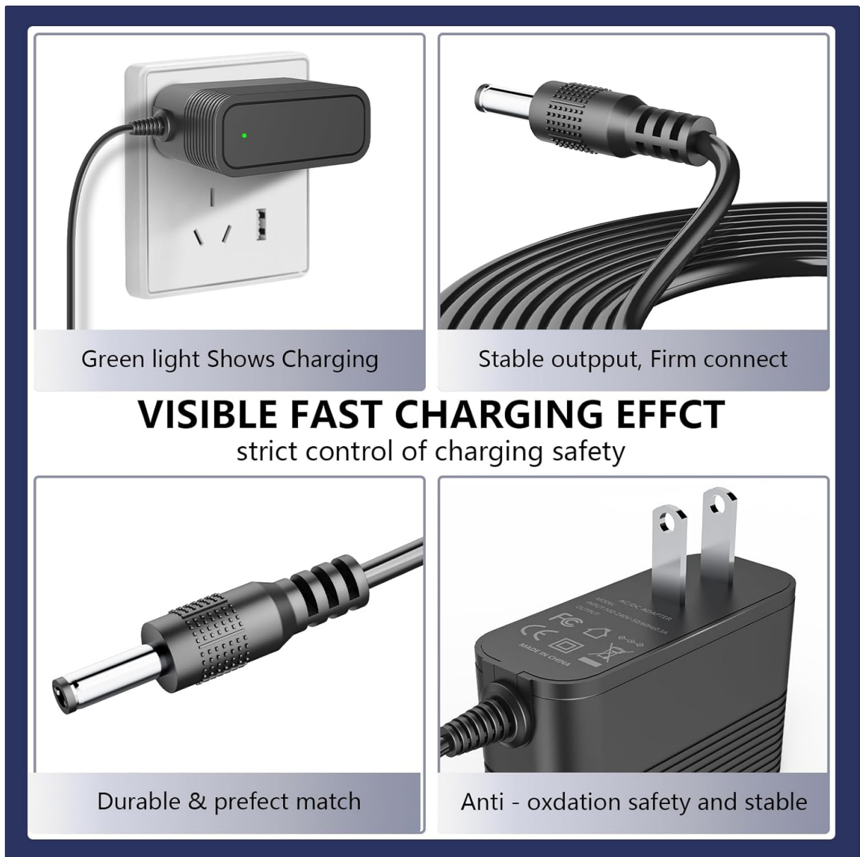
Figure 4.2: Charger features including the green charging indicator light.