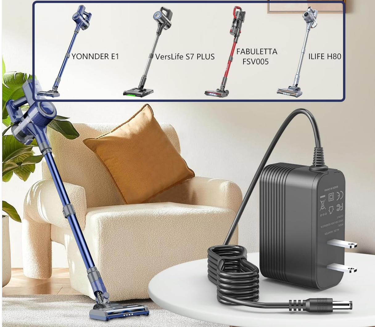
Figure 4.1: Proper connection of the charger to the vacuum cleaner and power outlet.