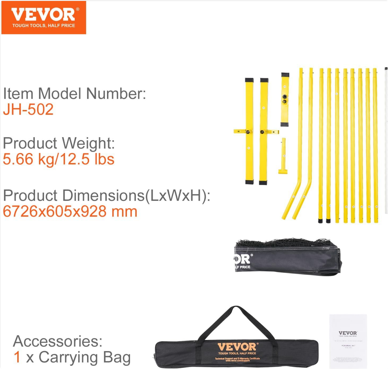
Figure 8.1: Visual overview of the net system's assembled state, including its overall dimensions and the components included in the package.

This image provides a visual overview of the net system's assembled state, including its overall dimensions and the components included in the package.