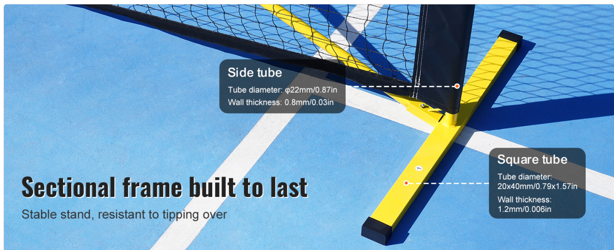
Figure 5.1: The pickleball net system with key dimensions: 22 ft length, 36 inches height at posts, and 34 inches center support pole height.

This net system is a regulation 22-foot net, suitable for standard pickleball court dimensions. The net height at the posts is 36 inches, and the center support pole ensures a consistent net height of 34 inches in the middle, as per official rules.