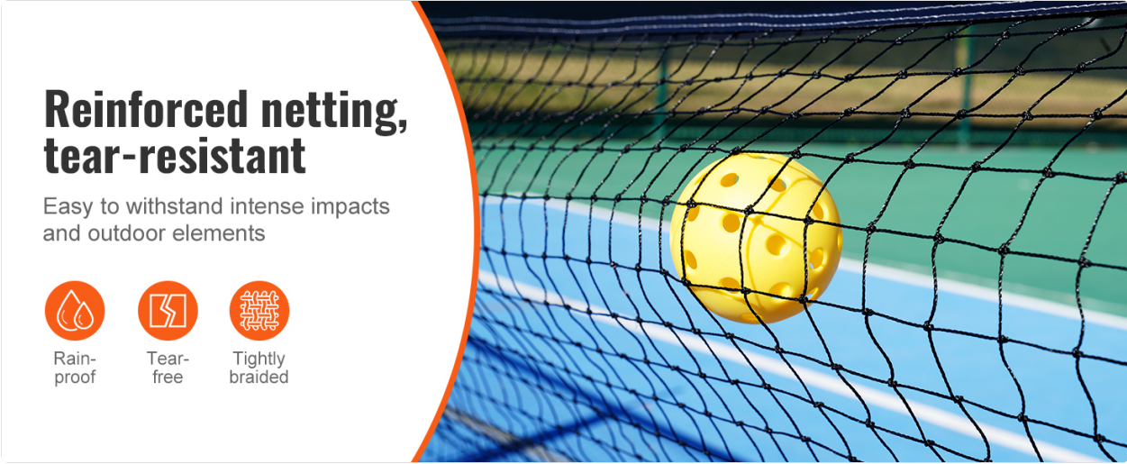
Figure 6.1: Close-up view detailing the robust construction of the net's reinforced fabric, fine mesh, and extended edging, designed for durability.

This image provides a detailed look at the net's construction, highlighting its strong fabric, fine mesh, and reinforced edging, which contribute to its tear-resistant and long-lasting qualities.