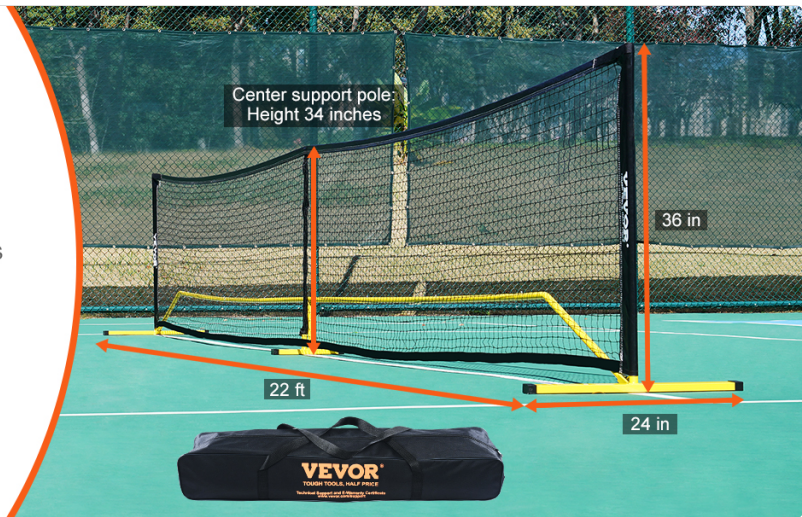
Figure 3.1: Complete VEVOR Portable Pickleball Net System with carrying bag.

The image above displays the full VEVOR Portable Pickleball Net System, including the net, frame components, and the dedicated carrying bag for transport and storage.