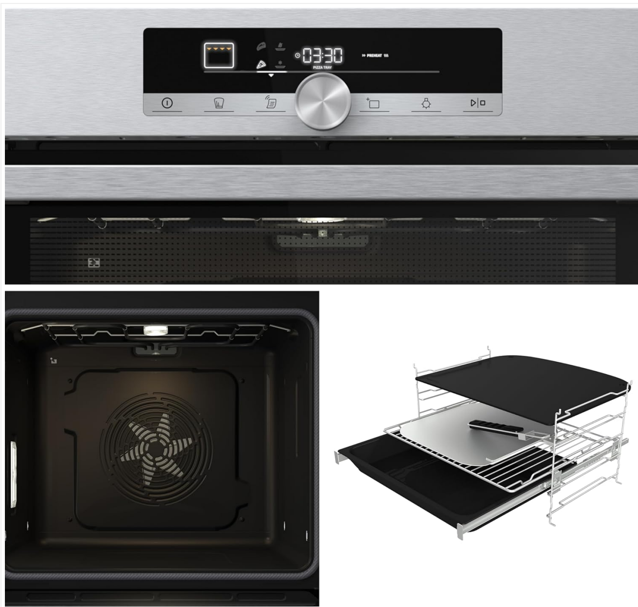
Figure 2: Included accessories for the Hisense BI350XPZ oven, showing the pizza tray, grill rack, and drip pan.