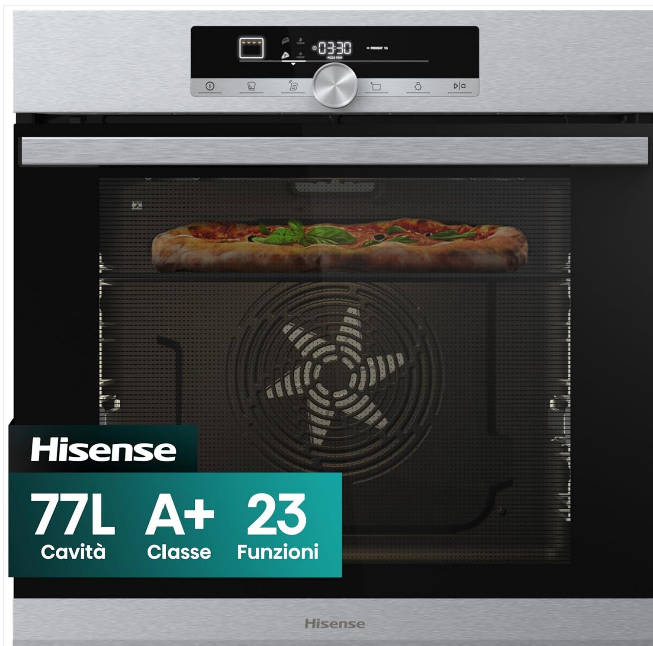
Figure 1: Front view of the Hisense BI350XPZ Electric Built-in Oven, featuring a pizza cooking inside.