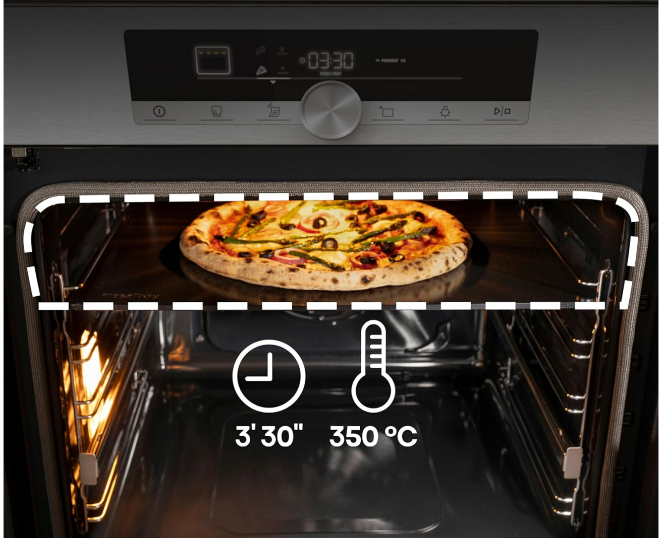
Figure 7: Pizza Mode Pro in action, highlighting the 3'30" cooking time at 350°C.