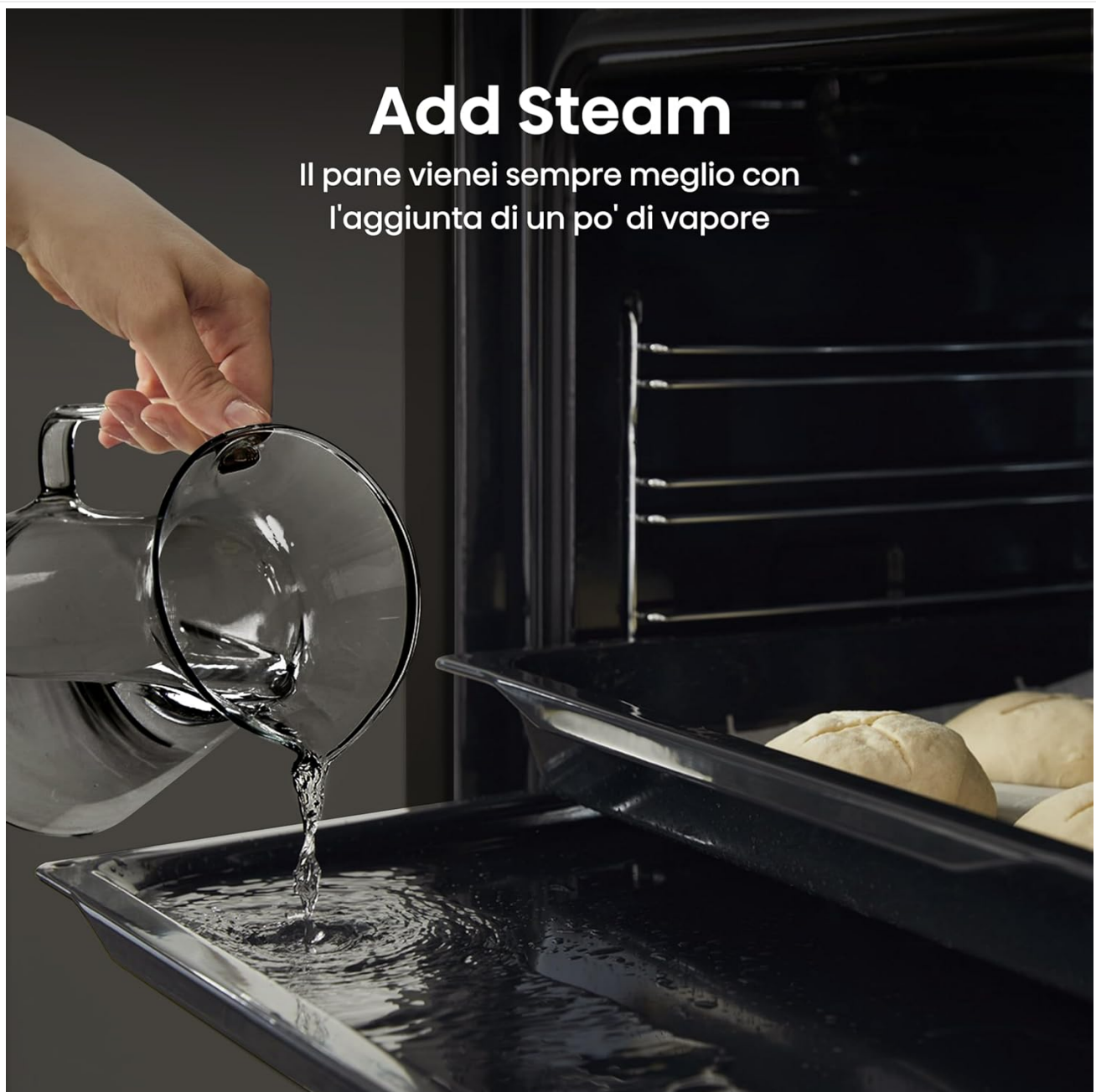
Figure 5: Using the Add Steam function, with water being poured into a tray.