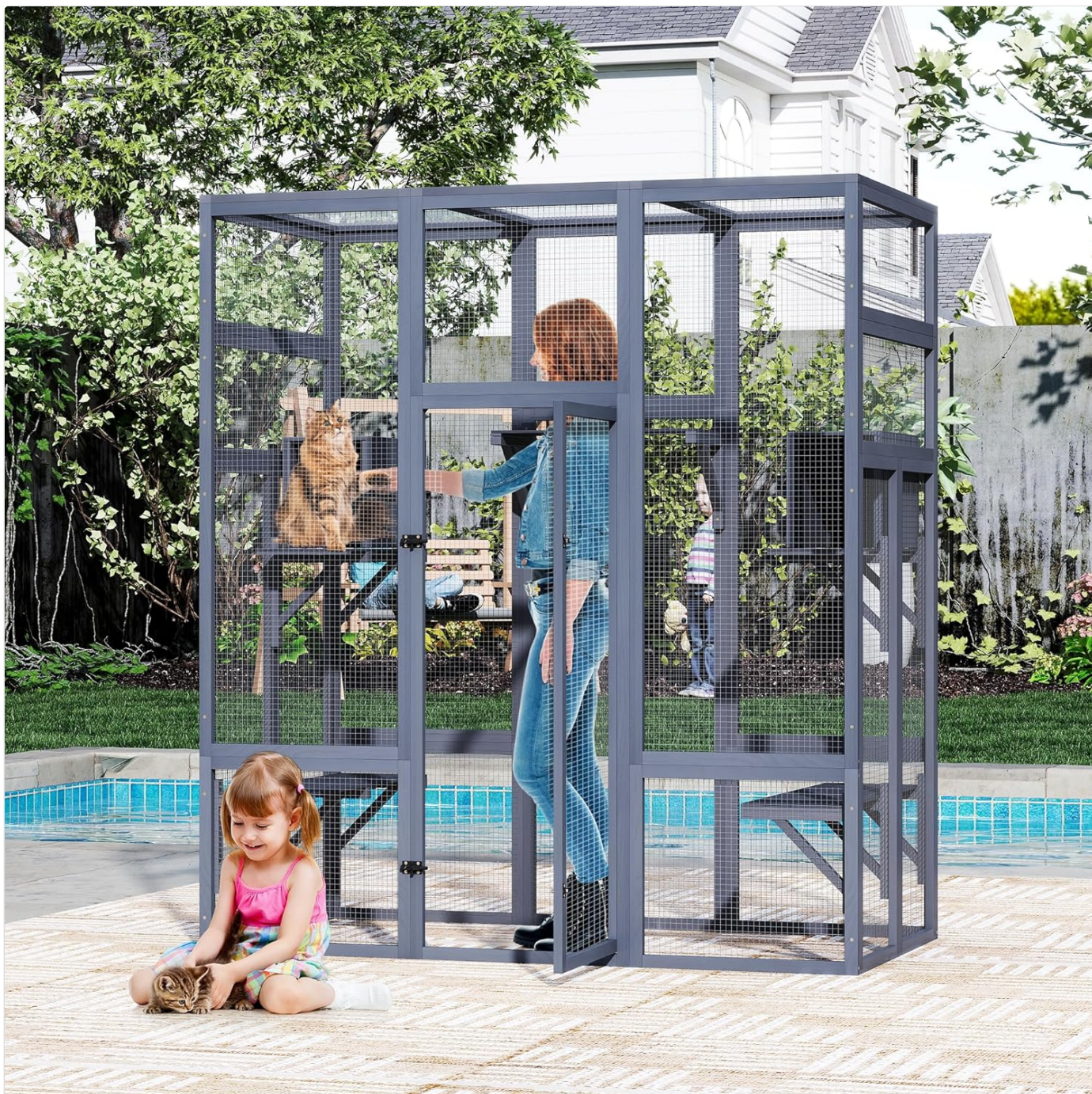
Figure 3: Interior layout with 5 platforms and 2 resting boxes for climbing and relaxation.