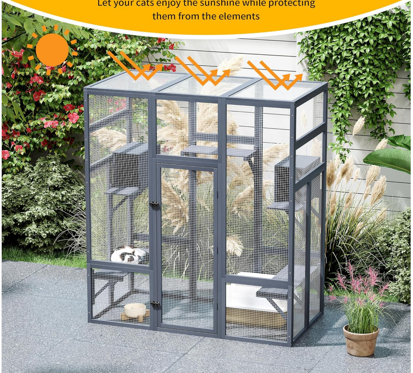
Figure 2: The catio provides ample space for interaction and play.

Let your cats enjoy the sunshine while protecting them from the elements