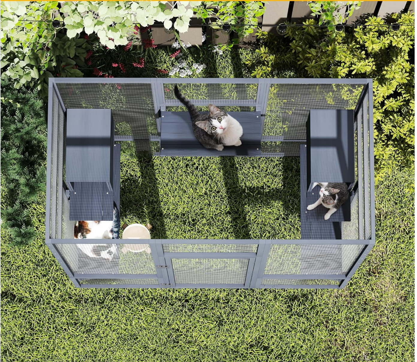
Figure 5: The waterproof roof protects pets from rain and allows for sunbathing.

Ensure enough space for cats to move around and rest