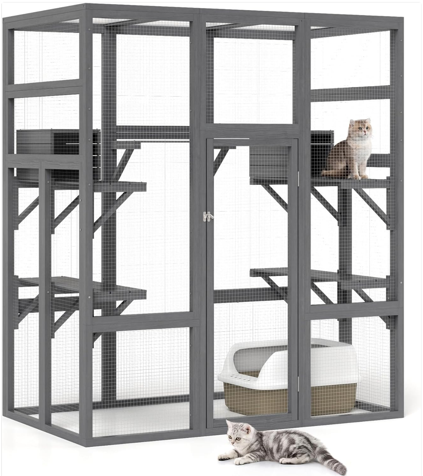
Figure 1: Fully assembled Nyeekoy 71-Inch Large Wood Catio.