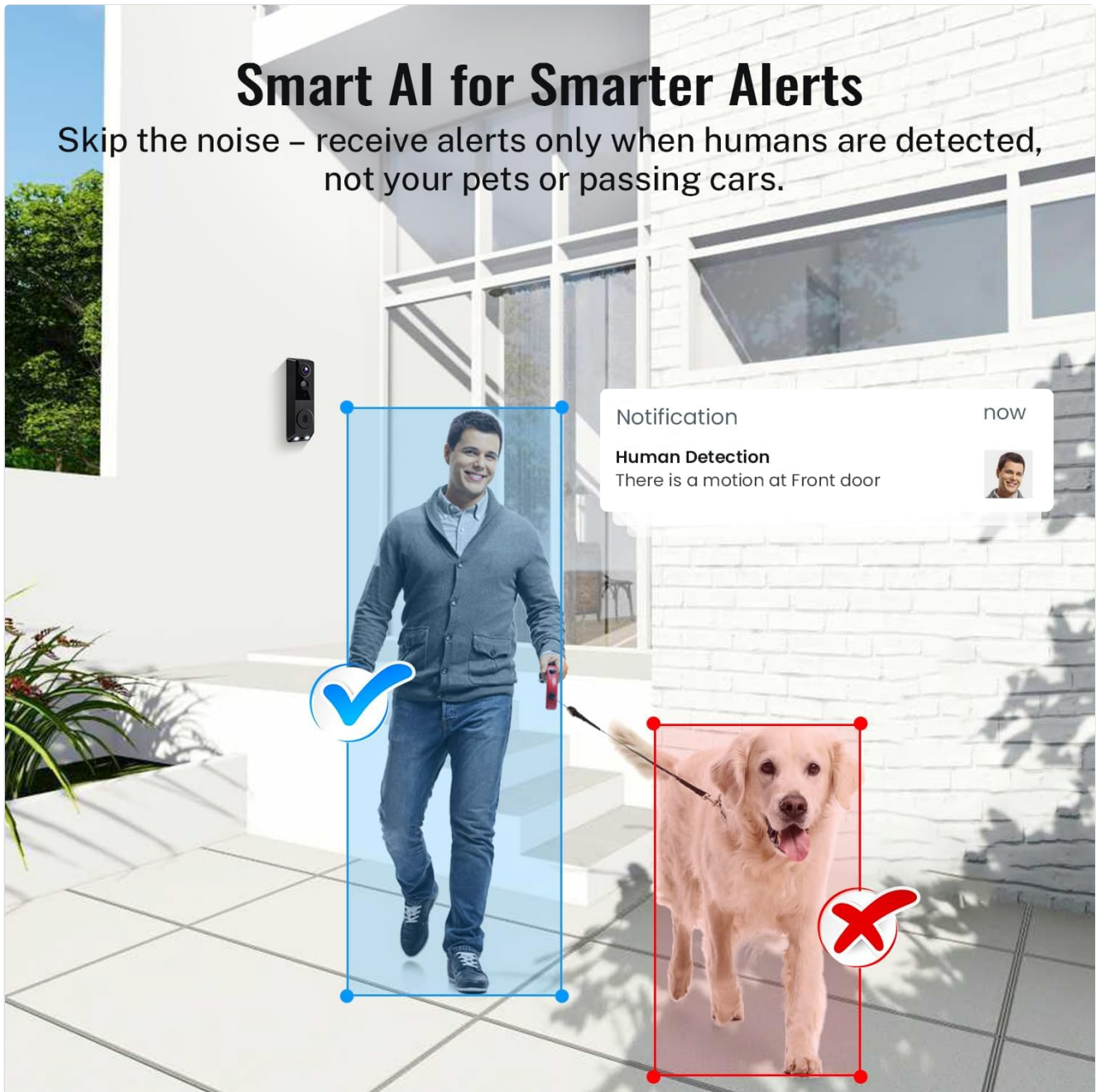
Image: An illustration showing the AI's ability to accurately detect human presence while filtering out pets or other non-human movements.

Skip the noise – receive alerts only when humans are detected, not your pets or passing cars.