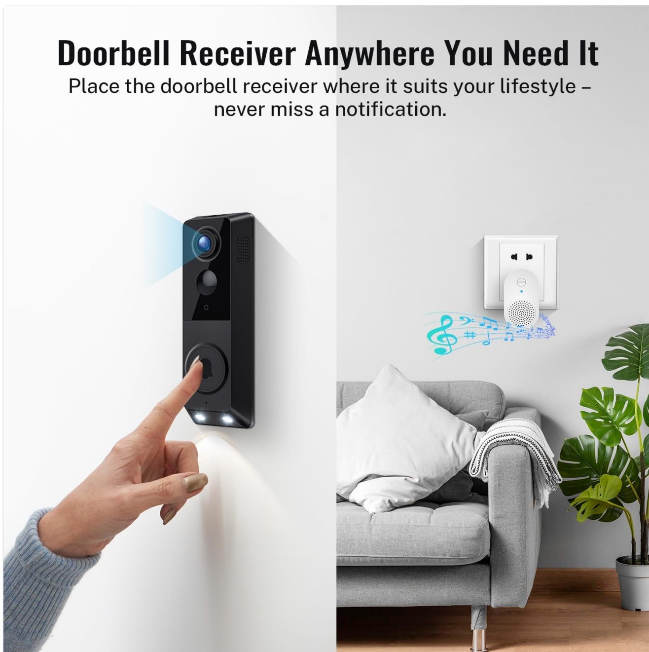
Image: The doorbell chime unit plugged into a wall outlet, demonstrating flexible placement.