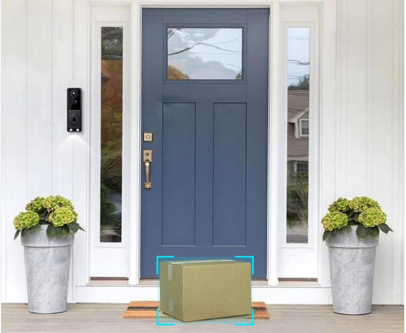
Image: The doorbell camera actively monitoring a package on a porch, with a visual indicator of AI detection.

Stay ahead of porch pirates with real-time delivery alerts and warnings if anyone approaches your package.