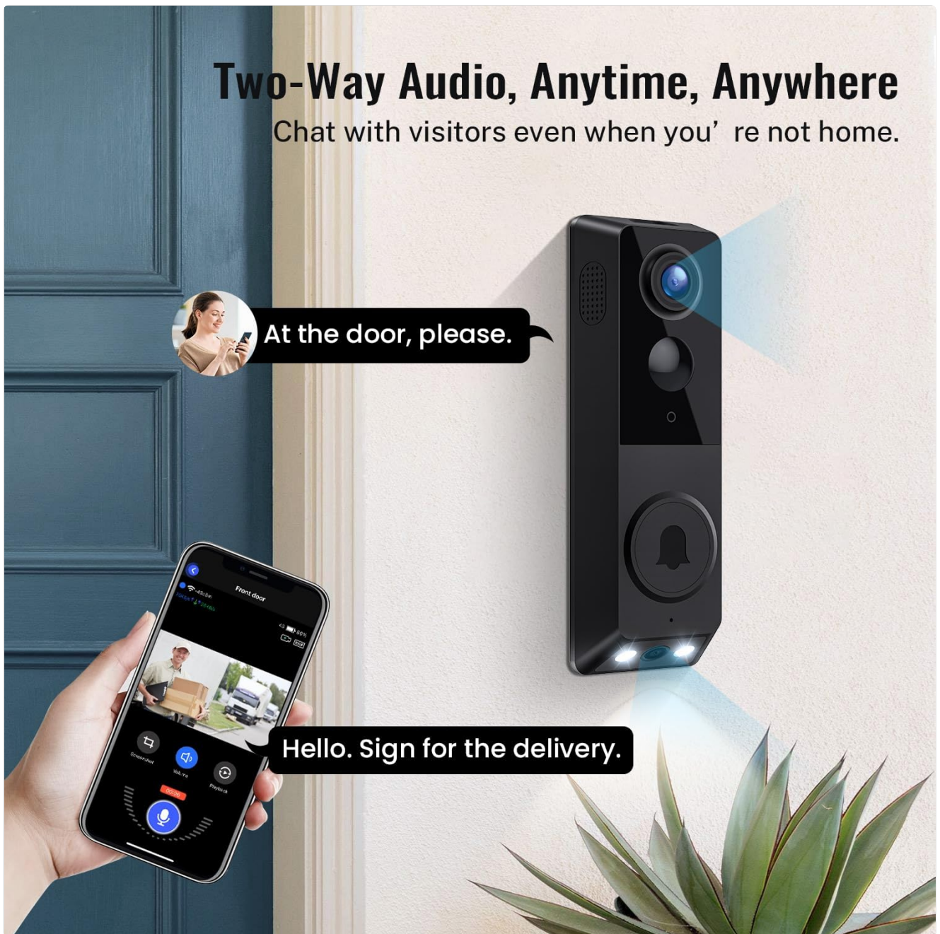
Image: A user engaging in two-way communication with a delivery person via the doorbell camera and smartphone app.

Chat with visitors even when you're not home.