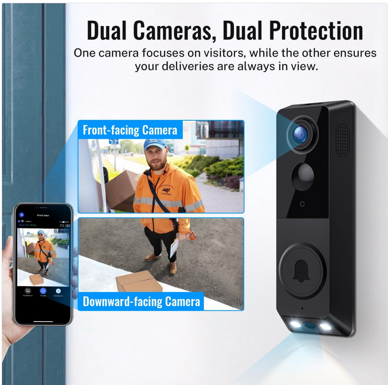
Image: A smartphone screen displaying simultaneous views from the front-facing and downward-facing cameras.

The BoomChill G50 features two cameras: a front-facing camera for visitors and a downward-facing camera to monitor packages. Both cameras operate simultaneously to provide comprehensive coverage.