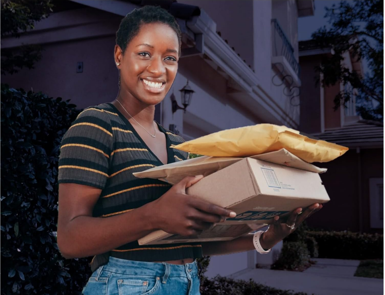
Image: A person holding packages at night, demonstrating the clarity of color night vision.

Color night vision brings accuracy to after-dark surveillance.