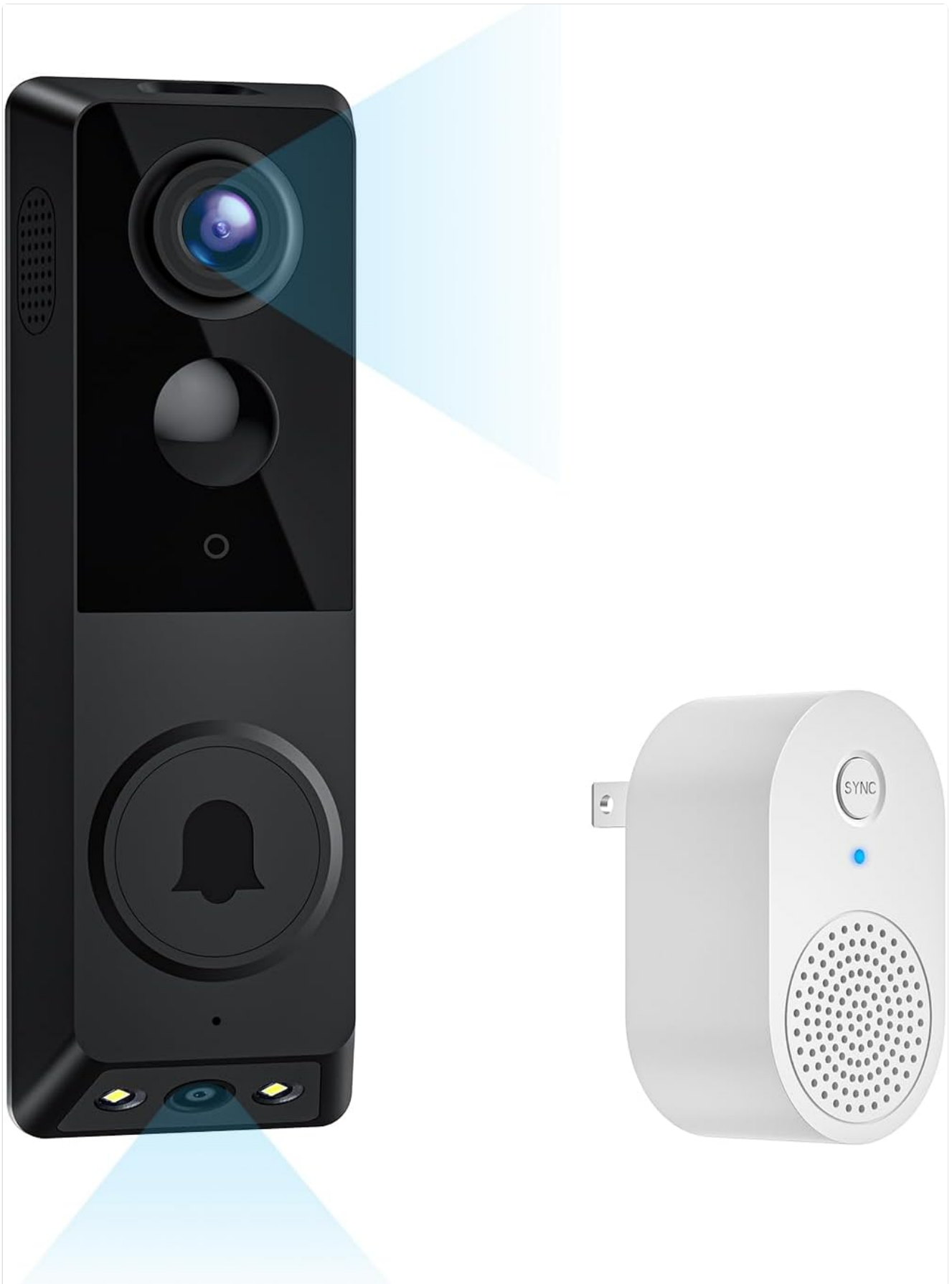
Image: BoomChill G50 Security Video Doorbell Camera and its accompanying Chime unit.