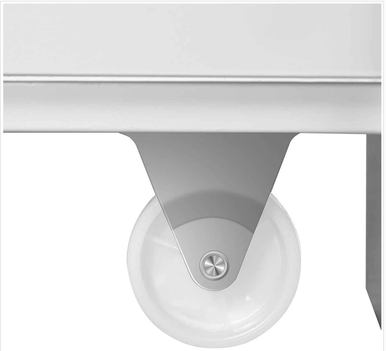
Figure 3: Detail of the Wheels. This image shows a close-up of one of the cabinet's wheels, highlighting its design for smooth movement.