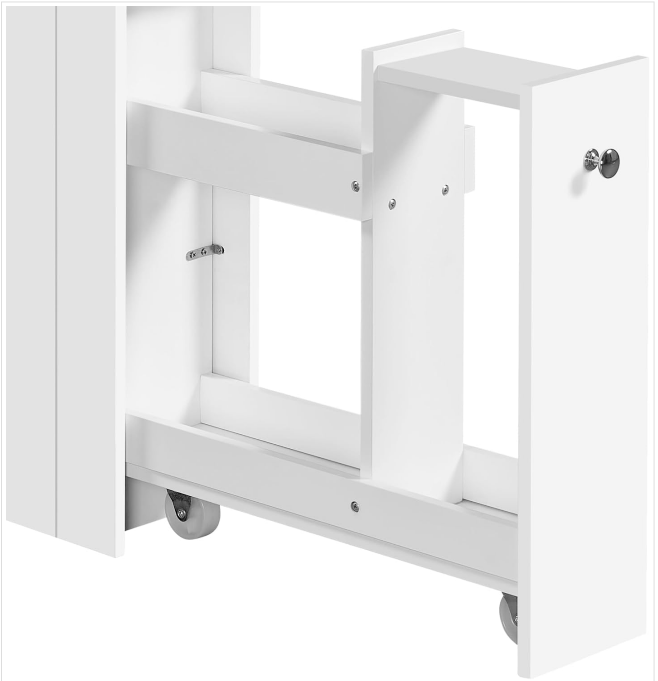
Figure 4: Pull-out Mechanism. This image details the internal structure and guiding rails of the pull-out drawer, demonstrating how it extends from the main cabinet.