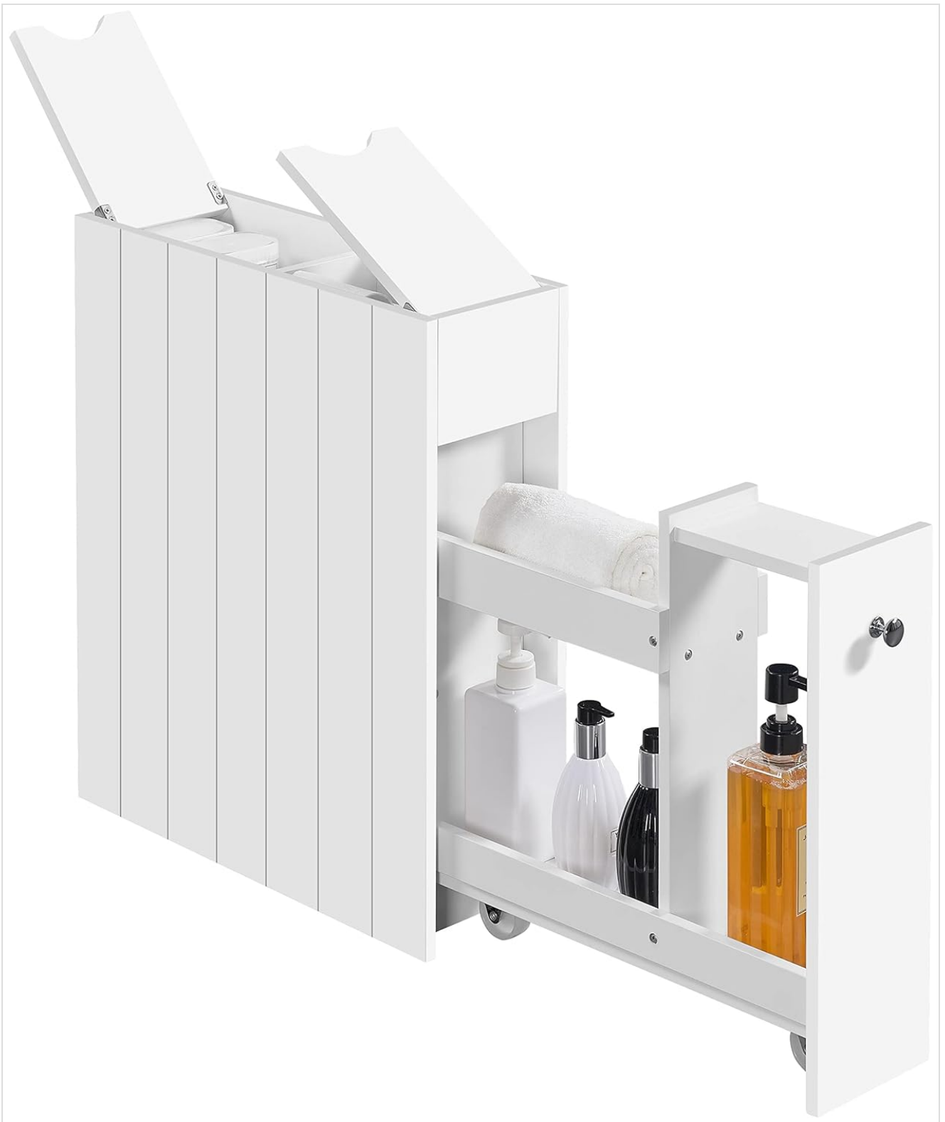
Figure 8: Pull-Out Drawer in Use. This image shows the main product with its pull-out drawer fully extended, revealing various bottles and items stored within.