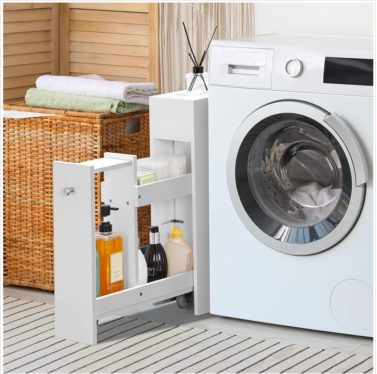
Figure 10: Laundry Room Placement. The cabinet is shown next to a washing machine, illustrating its versatility in different household areas.