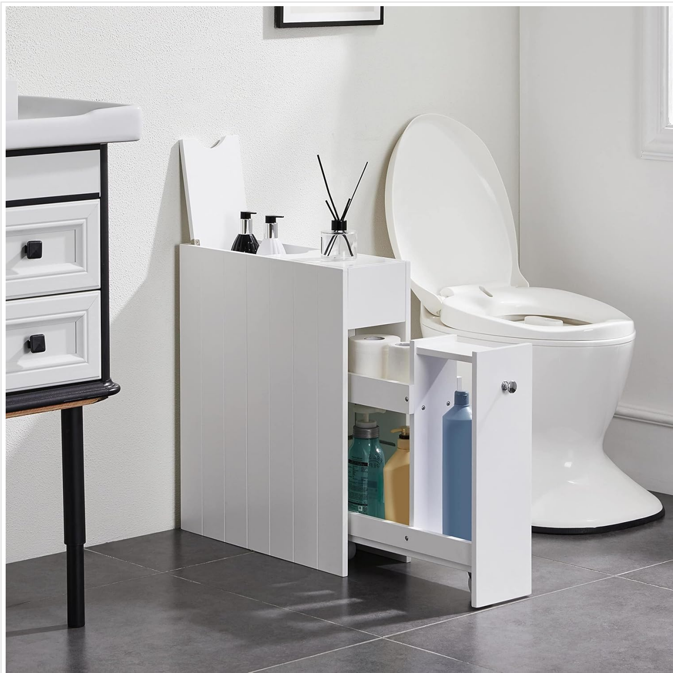
Figure 9: Bathroom Placement. The cabinet is shown positioned neatly next to a toilet, demonstrating its space-saving design.