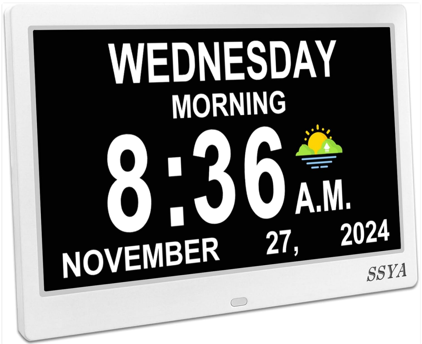
Figure 1: Front view of the SSYA Dementia Clock displaying the current time and date.