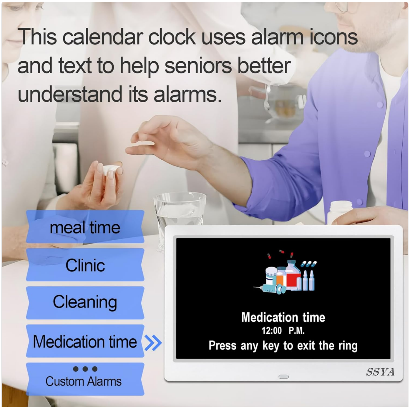
Figure 4: The clock's alarm interface, showing a "Medication time" reminder.