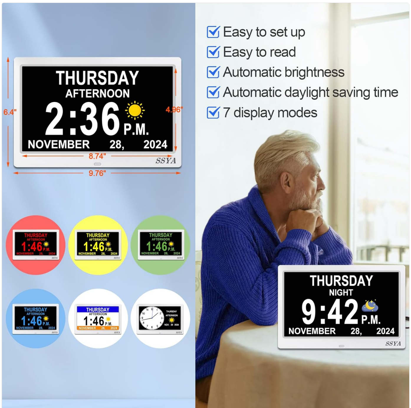
Figure 2: Overview of clock dimensions and available display modes.