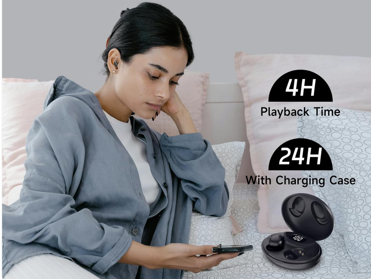
Image 2.1: The charging case provides up to 24 hours of total battery life for the earbuds.

The earbuds battery life is 4H and the charging case lasts up to 20H.