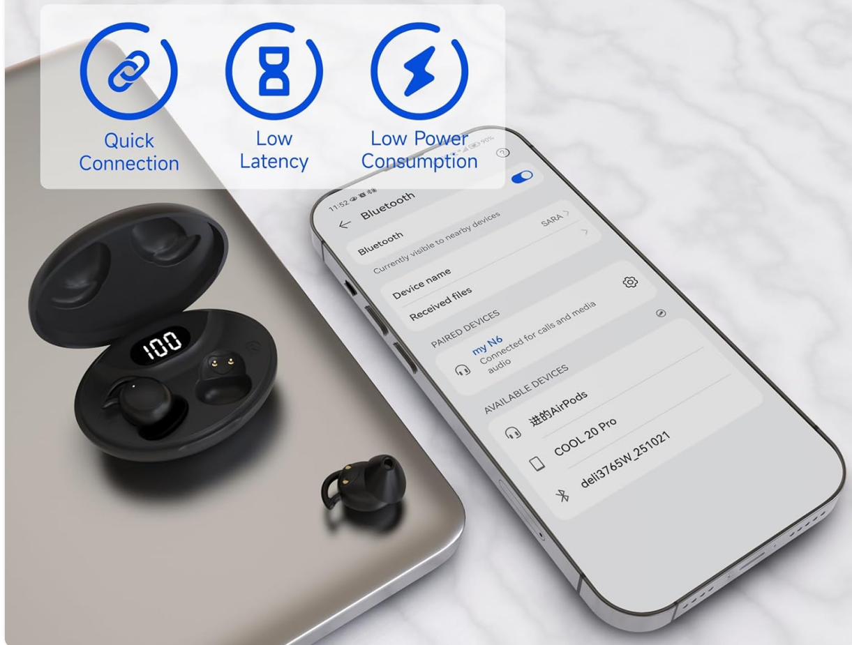
Image 2.2: One-step pairing with Bluetooth 5.3 for quick and stable connection.

It will automatically connect when the lid is opened after first connection.