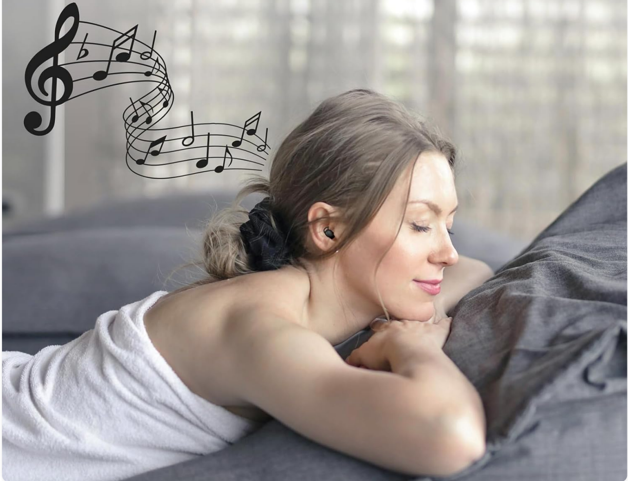
Image 1.1: IFECCO Invisible Sleep Earbuds designed for comfortable wear during sleep.

Comfortable to Wear for Peaceful Sleeping.