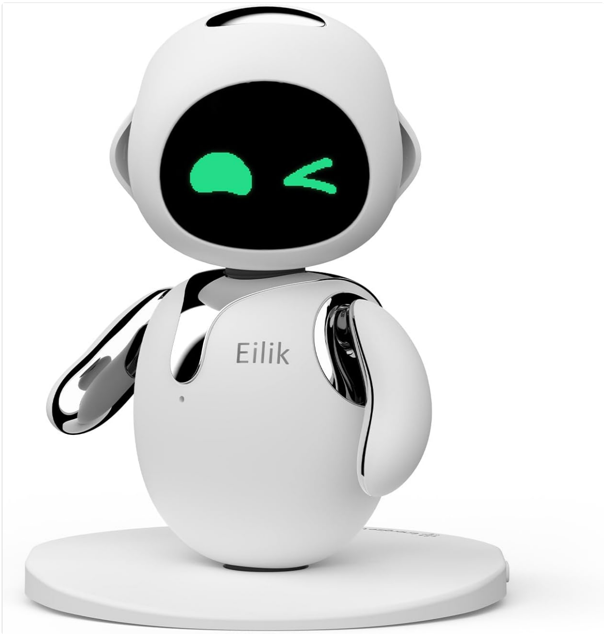
Figure 1: Eilik Silver Interactive Robot Pet