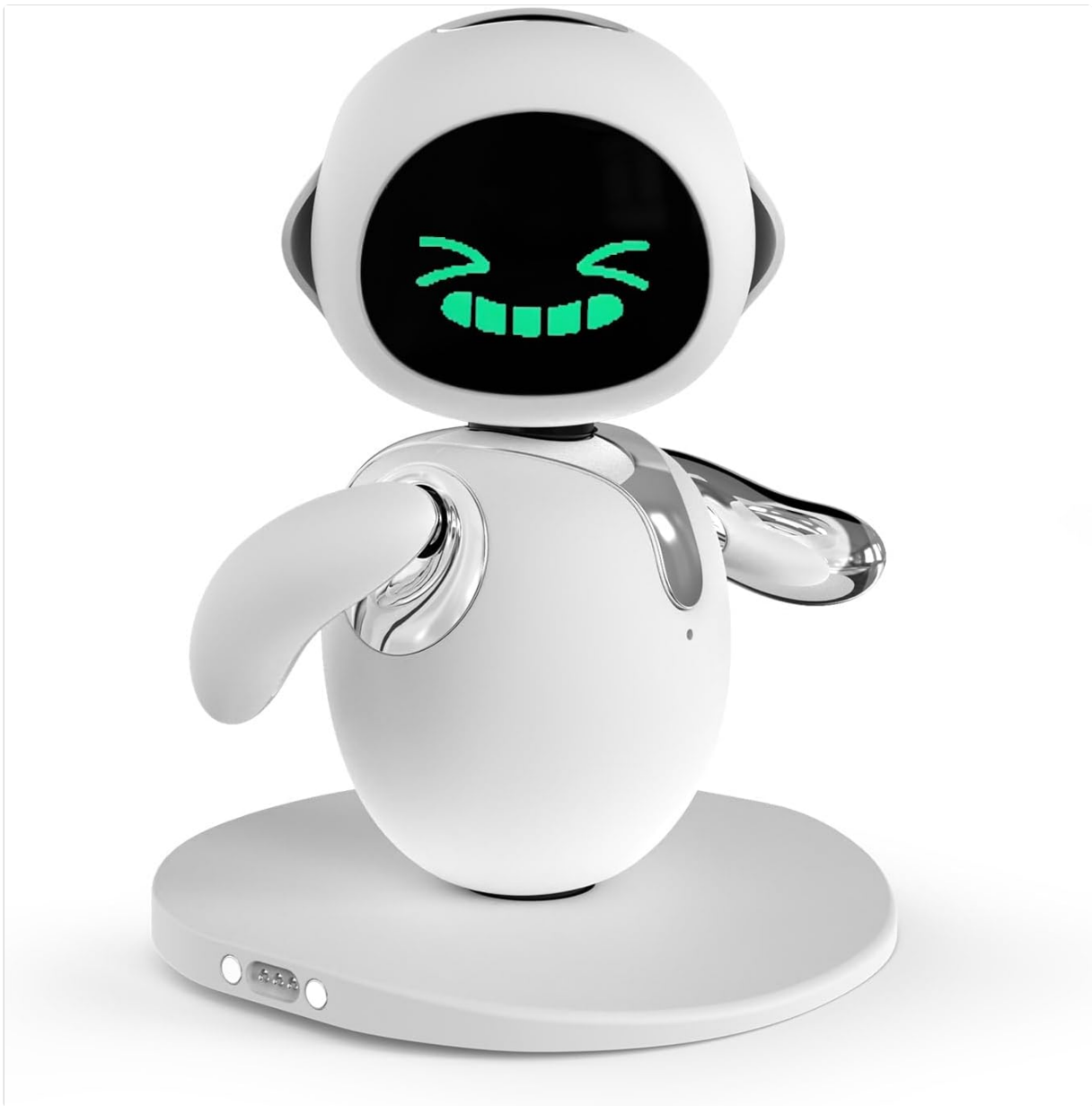
Figure 2: Eilik Silver and its accessories

This image displays the Eilik Silver robot along with its various accessories, including the USB-C charging cable, food toys, magnets, double-sided tape, and additional arm attachments like the SOS Bag Pack, Lifeline Hook, Haze Remover, and Danger Digger.