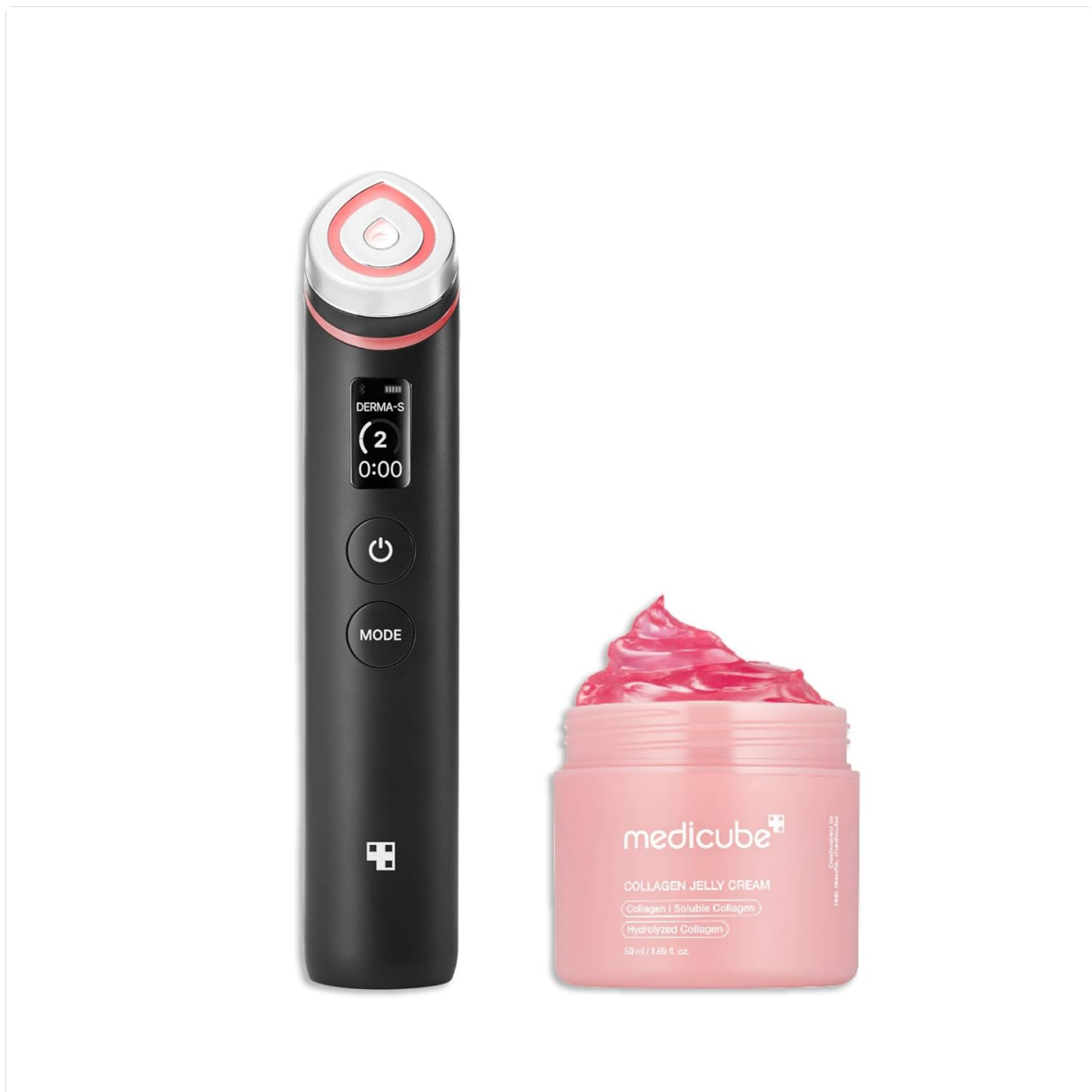
Figure 2.1: The medicube Booster Glow Duo, featuring the Age-R Booster Pro device and Collagen Jelly Cream.