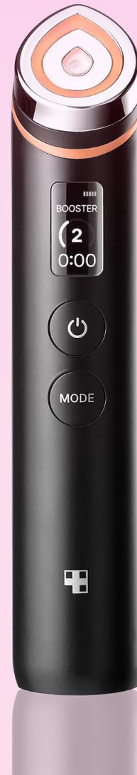
Figure 4.1: The Age-R Booster Pro device.