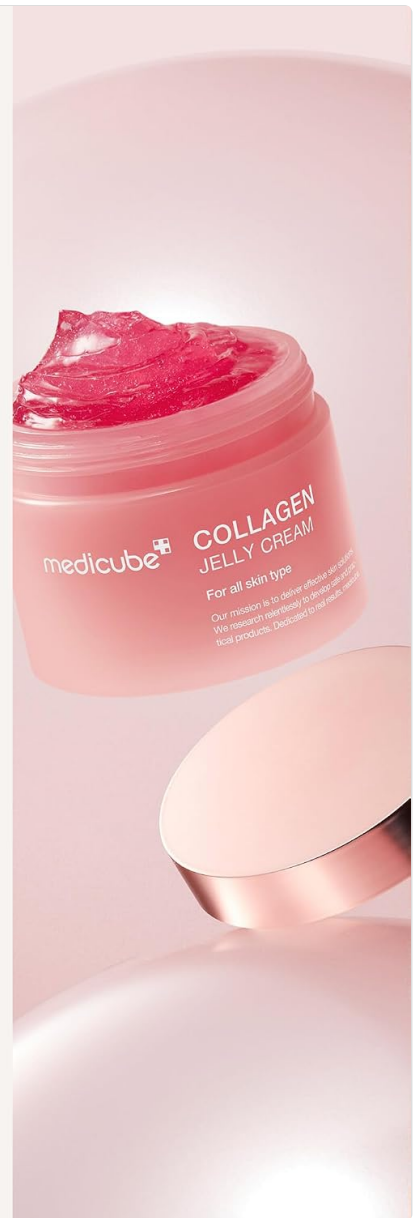
Figure 4.3: Medicube Collagen Jelly Cream.