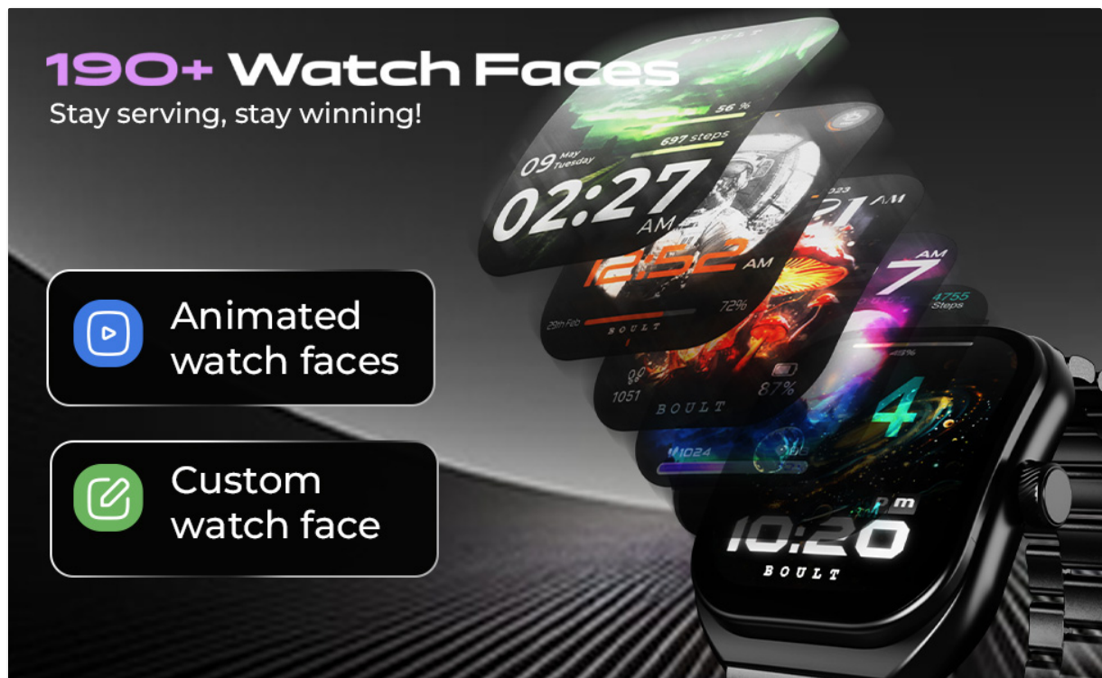
Image: A close-up view of the smartwatch display, emphasizing its 2.01-inch IPS curved screen and 240x296 resolution.

The GOBOULT Trail Smart Watch features a 2.01-inch 3D Curved HD Display with 500 Nits Brightness for clear visibility. Navigate through menus and features using touch gestures and the working crown.