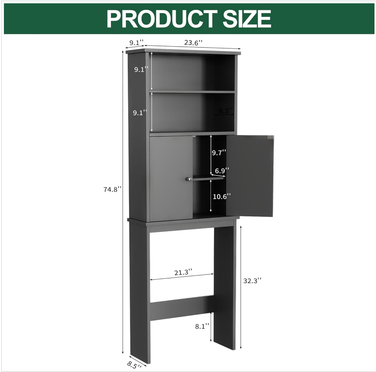
Figure 3.1: Product Dimensions. This diagram illustrates the overall dimensions of the cabinet and its internal compartments, including the clearance for a toilet.