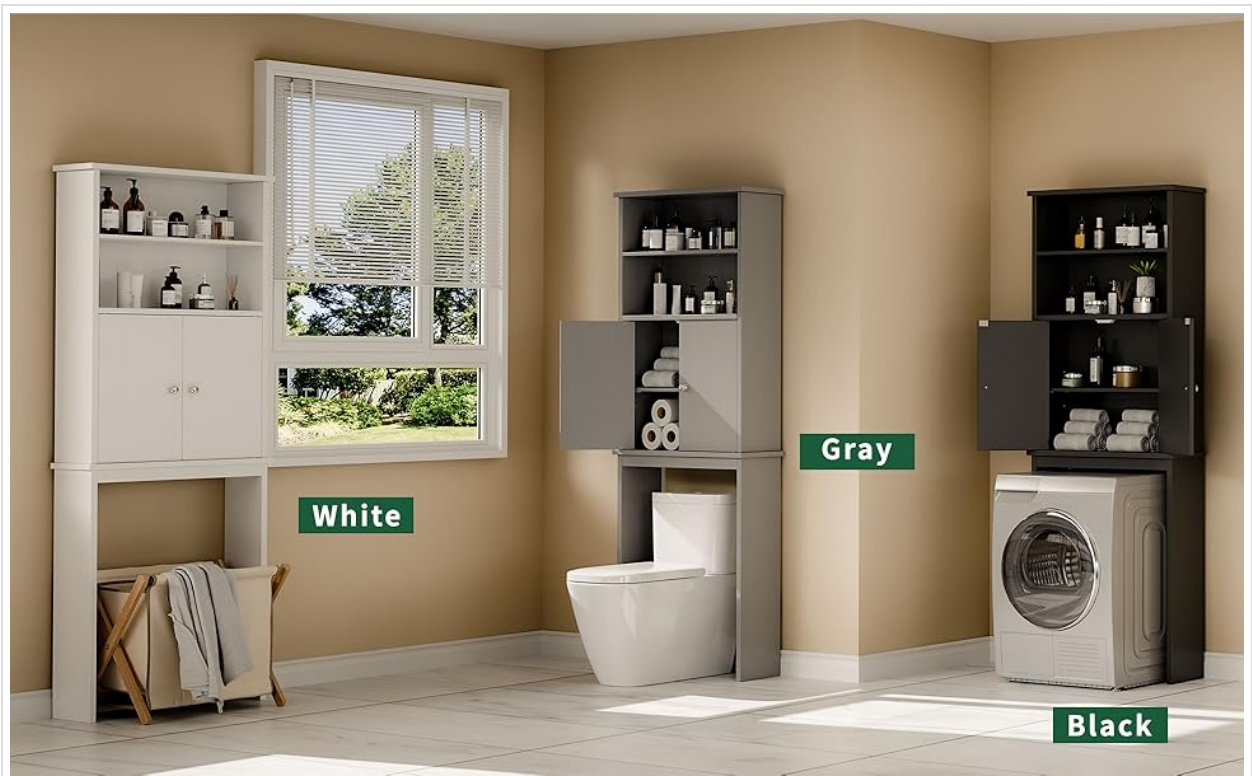
Figure 6.2: Versatile Usage. The cabinet can be used in multiple configurations and room types, such as over a toilet or a washing machine.