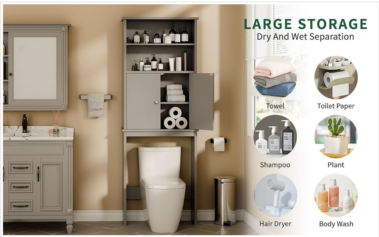
Figure 6.1: Large Storage Capacity. This image illustrates how various items can be organized within the cabinet's open and closed compartments.